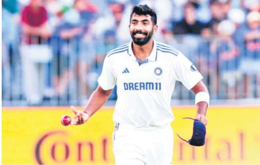
at the same venue where India were all out for 36 in their previous visit in 2020. Recalling that match, Head said, "I

including several pivotal wickets, showcasing his exceptional form. His stellar performance was a testament to his remarkable consistency this year. Earlier this year, he was named Player-of-the-Series in the T20 World Cup, where he played a key role in India's title-winning campaign. Head was the sole Australian batter to get a fifty in Perth as the top order comprising the likes of Steve Smith, Usman Khawaja and Marnus Labuschagne struggled but the explosive middle-order batter is certain his teammates won't be approaching him for tips. "They are not coming to me for batting tips, that's for sure. Everyone goes about it in different ways. We'll have a chat over the next three or four days. "(Bumrah) is so unique, and that's with any of the bowlers, really. Every (batter) picks up different cues and goes about it in a different way." The Australian squad reconvened on Monday after a short break. The two sides will now play a pink ball Test in Adelaide from Friday