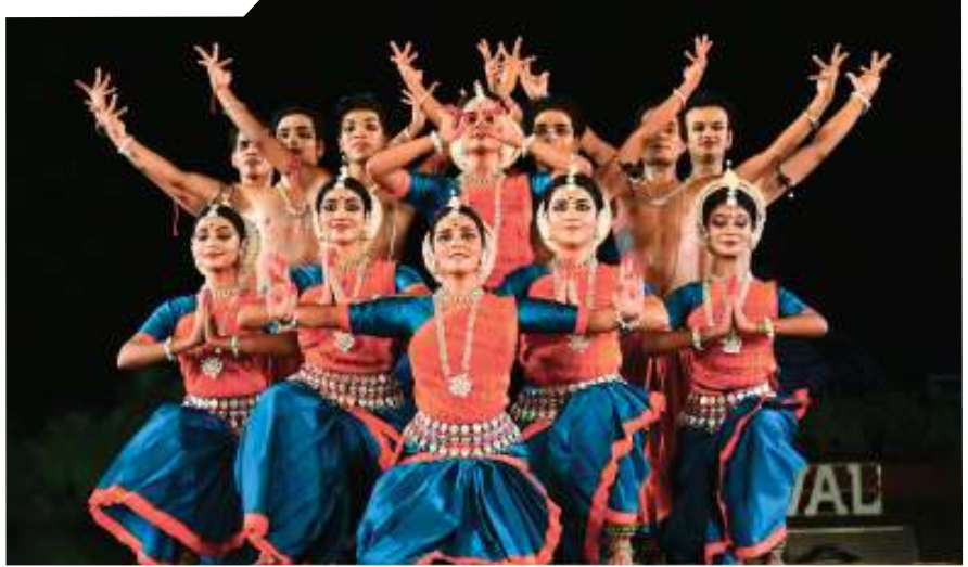
Artistes perform during the 35th Konark Dance Festival 2024, in Puri