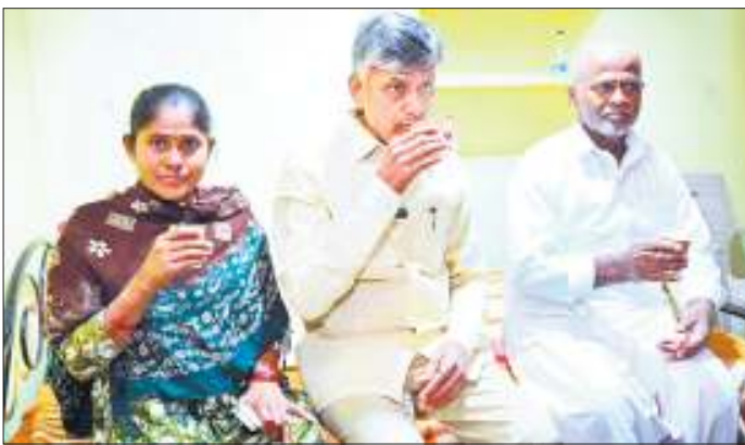
CM N Chandrababu Naidu has tea with family members of a pension beneficiary at Nemakallu village in Bommanahal mandal of Anantapur district on Saturday