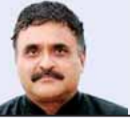
ASHWANI GURU JI

The Divya Chikitsa Mantras stand out as a remarkable system for channelising divine energy