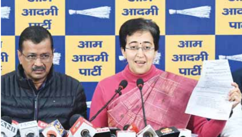
Delhi Chief Minister Atishi and AAP National Convener Arvind Kejriwal during a press conference.

Yojana, reaffirming the legitimacy of the scheme. The fresh controversy will add another dimension to the ongoing tussle between the AAP and the bureaucracy, with accusations flying between parties. The move underlines the tenuous relationship between the bureaucracy and the elected Delhi Government after an amendment to the Government of National Capital Territory of Delhi (GNCTD) Act, the services department comes under the control of the Lieutenant Governor. The latest flashpoint, which comes weeks ahead of the Delhi Assembly polls, sparked a slugfest between the AAP and BJP leaders. The BJP has accused the ruling party of duping people, since the two schemes have not been approved yet. The Department of Women and Child Development (WCD), in a public notice in newspapers, has said the Mukhyamantri Mahila Samman Yojana does not exist and has not been approved by the Delhi government. It has urged