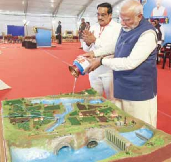
Prime Minister Narendra Modi with Union Minister CR Patil during the foundation stone laying ceremony of Ken-Betwa River Linking Project, in Khajuraho, Madhya Pradesh.

The ambitious first of its kind interlinking of the Ken-Betwa River as desired by former Prime Minister late Atal Bihari Vajpayee two decades ago, finally kick started with the foundation stone laying by PM Narendra Modi on Wednesday which also marked the birth anniversary of the political stalwart Bharat Ratna Vajpayee. The Vajpayee government had proposed river linking as a solution for irrigation needs as well as for dealing with floods. Modi laid the foundation stone of the Rs 44,600 crore Ken-Betwa River Link Project at Khajuraho in Madhya Pradesh and said the river linking will open new doors of prosperity and happiness in the Bundelkhand region. Union Water Resources Minister C R Patil and Madhya Pradesh Chief Minister Mohan Yadav handed over two kalash (urns) containing water from Betwa and Ken rivers, respectively, to Modi, who poured it over a model of the project to launch the river linking work. As per the initial estimation of the project, nearly 44 lakh people in 10 districts of Madhya Pradesh and 21 lakh in Uttar Pradesh will get drinking water under the project. Nearly 7.18 lakh agricultural families in 2,000 villages will benefit from the project, which will also generate 103 MW of