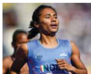
participating in the Indian Grand Prix meet in Bengaluru and the National Inter-State meet in Panchkula in June even as her suspension was till November 21, 2024. The most intriguing thing is that she ran four races in June. When PTI reached out to her after her training session on Wednesday, Hima declined to comment on the issue. An Athletics Federation of India (AFI) source also confirmed that her suspension got over in November. A 'case resolution agreement' is made between the anti-doping agency and the athlete when both parties consent, and the athlete agrees to accept the consequences imposed without pursuing further appeals.

Asian Games gold medallist sprinter Hima Das, who was exonerated for a 'whereabouts' failure by the National Anti-Doping Agency (NADA), was handed a retrospective suspension by the same body in an unusual turn of events. The 16-month suspension period ran from July 22, 2023 to November 21, 2024 and the athlete is now free to take part in tournaments but what has created a flutter is that she had been competing in events as recently as in June this year. NADA has recently announced that she was suspended by its anti-doping panels for failing to provide her whereabouts. Known as the 'Dhing Express', she was handed the suspension under a case resolution agreement as per the NADA website. She is currently training in Thiruvananthapuram. The timeline around her suspension has created confusion as the athlete has been competing since April this year, including