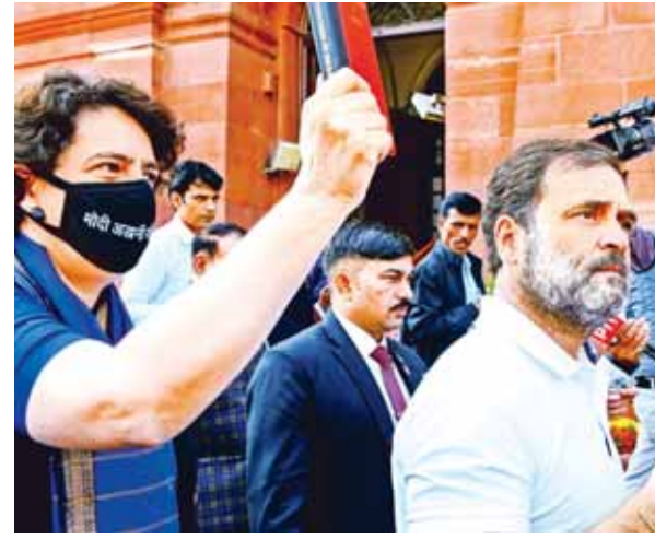
shared the same opinion. "How can someone holding the position of a Politburo member of the CPI (M) speak in such a communal manner?" Venugopal asked. "This is part of a deal to please the BJP. This is not just a CPI (M) statement—it is a BJP quotation aimed at crucifying Rahul Gandhi," he alleged. Leader of Opposition V D Satheesan echoed similar sentiments, charging the CPI (M) with pushing the same communal agenda propagated by the Sangh Parivar. "Post-Parliamentary elections, the CPI (M) is engaged in majority appeasement. This is an effort to gain favour with the Sangh Parivar and escape scrutiny from

PIONEER NEWS SERVICE ■ NEW DELHI/ THIRUVANANTHAPURAM CPI (M) Politburo member A Vijayaraghavan's recent controversial remarks regarding the Lok Sabha victories of Rahul Gandhi and Priyanka Gandhi Vadra from the Wayanad constituency have drawn sharp criticism from Congress and Indian Union Muslim League (IUML) leaders on Sunday. Congress leaders accused the senior CPI (M) leader of making the comments to "please" the Sangh Parivar, while their United Democratic Front (UDF) ally, the IUML, alleged that he was attempting to provoke majority communalism in society. During a party event in Wayanad on Saturday, Vijayaraghavan reportedly claimed that Rahul Gandhi secured victory in the high-range segment twice with the support of communal forces and that extremist elements were present at Priyanka Gandhi's campaign rallies. AICC General Secretary K C Venugopal strongly criticised Vijayaraghavan, accusing him of using "communal" language that even the Sangh Parivar might hesitate to employ against Rahul Gandhi. Venugopal also questioned whether the CPI (M)