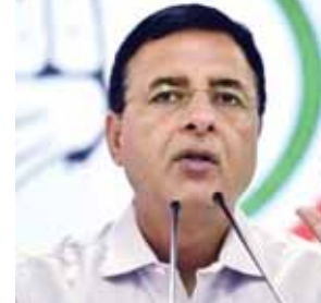
the three opposition leaders? Who is the constitutional authority? Who are the journalists? Who are the business persons? What information was retrieved by the BJP government and agencies? How was it used - misused and to what consequence?" the Congress leader asked. He also questioned if appropriate criminal cases would now be lodged against the political executive or officers in the present government and the company owning NSO. "Will the Supreme Court

PIONEER NEWS SERVICE ■ NEW DELHI Congress general secretary Randeep Surjewala on Sunday claimed that the Pegasus spyware case verdict in the US proved how 300 WhatsApp numbers of Indians were targeted and asked if the Supreme Court would now conduct a further inquiry in view of the judgment. Surjewala shared a media report which said that, for the first time, a court in the US had held Israel's NSO Group liable for its intrusive spyware Pegasus. "The Pegasus spyware case verdict proves how 300 WhatsApp numbers of Indians were targeted in the illegal spyware racket," Surjewala said in a social media post. He said it was time for the Narendra Modi government to answer who the 300 names targeted were. "Who are the two Union ministers? Who are