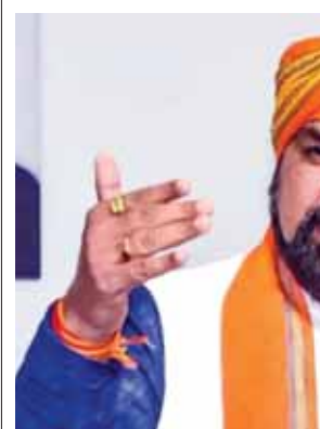
PIONEER NEWS SERVICE ■ NEW DELHI Bihar Deputy Chief Minister and BJP leader Samrat Choudhary said on Sunday said NDA will contest the assembly polls in Bihar next year under the leadership of Chief Minister Nitish Kumar and Prime Minister Narendra Modi. "There is no confusion," he said during a Press conference at the BJP headquarters in the national Capital when asked to comment on speculation that the National Democratic Alliance (NDA) could do a rethink on projecting Kumar as its leader in the polls. He was responding to Union Home Minister Amit Shah's recent interview to a news channel in which he was

asked if the NDA could go to the polls in Bihar without declaring a chief ministerial candidate, like it recently did with great success in Maharashtra. Shah, a former BJP president who is still regarded as the party's principal strategist, had replied after a pause, "We will sit together and decide. We will let you know after we have made a decision." The cryptic response had led to furious speculation that the BJP could insist on not projecting Kumar in the 2025 polls. Dismissing the speculation, Choudhary said, "The NDA is working under the leadership of Nitish Kumar and Prime Minister Narendra Modi in Bihar and we will continue to contest elections under the leadership of both leaders."