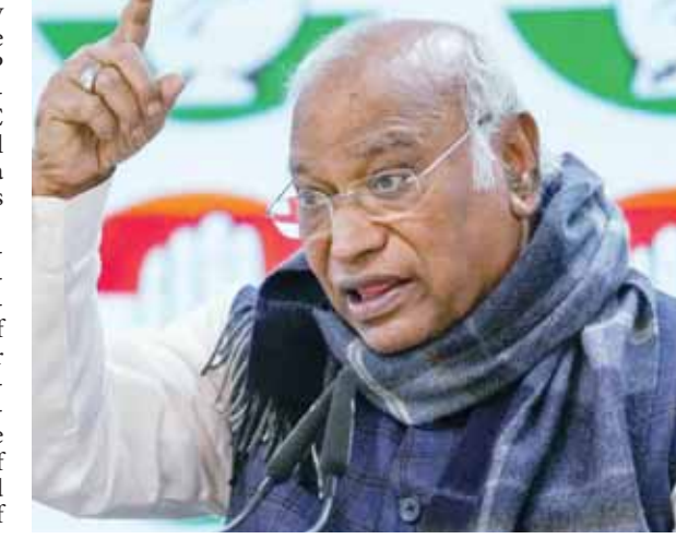
cated the grand old party would legally challenge the amendment, Lok Sabha MP and Congress general secretary (organisation) KC Venugopal said the poll panel had chosen opacity and a pro-government attitude in its dealings thus far. Reacting to the development, Kharge said Modi government's audacious amendment in the Conduct of Election Rules is another assault in its systematic conspiracy to destroy the institutional integrity of the Election Commission of India. "Earlier, they had removed the Chief Justice of

an election rule to prevent public inspection of certain electronic documents such as CCTV camera and webcasting footage as well as video recordings of candidates to prevent their misuse. Based on the recommendation of the Election Commission of India (ECI), the Union law ministry on Friday amended Rule 93(2)(a) of the Conduct of Election Rules, 1961, to restrict the type of "papers" or documents open to public inspection. While Congress general secretary-in-charge communications Jairam Ramesh indi-