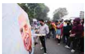
PNS : JAMSHEDPUR

The much-anticipated second edition of Jam@Street was successfully held at the Tata Motors Township (Telco Area) today, attracting over 25,000 enthusiastic participants from across the city. Organized by Tata Steel ULSL in collaboration with Tata Motors and Tata Cummins, the event transformed the stretch from the Labour Bureau