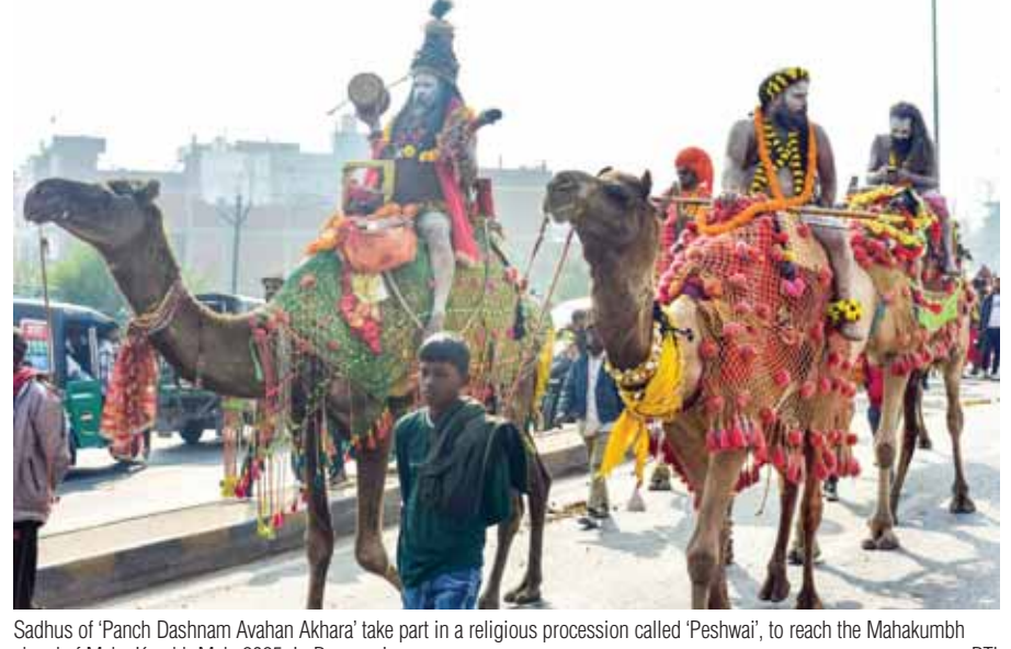
Sadhus of 'Panch Dashnam Avahan Akhara' take part in a religious procession called 'Peshwai', to reach the Mahakumbh ahead of Maha Kumbh Mela 2025, in Prayagraj