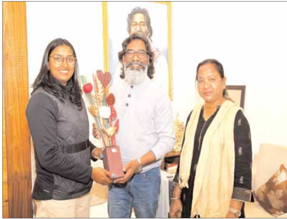
PNS : RANCHI

A grand ceremony is proposed to be organized at the Army Ground located in Namkum on December 28