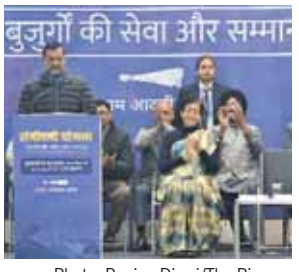
Keiriwal promises free medical treatment for