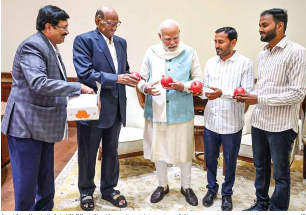
Prime Minister Narendra Modi with NCP (SP) chief Sharad Pawar and farmers during a meeting in Delhi

TDP, JD(U) and Shiv Sena have stoutly defended the bills, saying frequent elections are an obstruction to development programmes and simultaneous polls will boost them by cutting down on election expenditure.