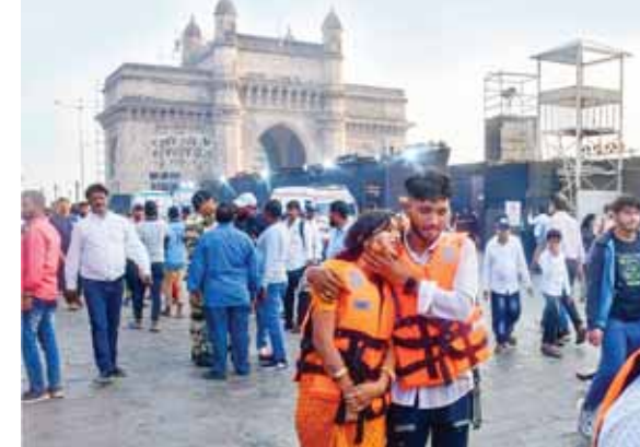
Passengers after being rescued in a joint operation by the Indian Navy and Indian Coast Guard

Confirming that the mishap took place due to a hit by a Navy vessel, a Defence spokesperson said late in the evening: "At about 1600 hours on December 18 a Navy craft undergoing engine trials lost control and collided with a passenger ferry Neel Kamal off Karanja, Mumbai. The ferry was carrying passengers from Gateway of India to Elephanta Island. The accident has reportedly led to the tragic loss of 13 lives including one Navy man and two Original Équipment Manufacturer (OEM) personnel onboard the Naval craft," the Defence spokesperson said. The Navy vessel. pegged the number of survivors at 99. "The survivors -- picked up by the Navy and civil craft in the area -- have been transferred to jetties and hospitals in the vicinity," the Defence spokesperson said. The private boat named "Neel Kamal" with many passengers on board was on its way from the Gateway of India to the Gharapuri Island, where there is UNESCO World Heritage Site of Elephanta Caves. The Indian Navy boat had six persons on board.