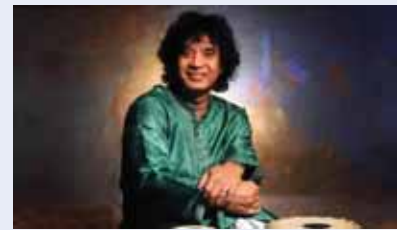
Tabla maestro Zakir Hussain passes away

The four-time Grammy Award winner, Indian tabla maestro and an innovative music fusion creator, Zakir Hussain is no more with us. The silence on his tabla is a huge loss for Hindustani classical music and jazz fusion. Zakir was truly an indelible gem in the world of music. The list of his national and international accolades is really long, as he had always made India proud with his tireless contribution in