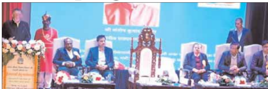
Governor Santosh Kumar Gangwar addresses a gathering during the 150th year celebration of the Indian Meteorological Department (IMD) at Ranchi Smart City Auditorium in Ranchi on Monday. PNS

The Governor said that the efforts of the Meteorological Department and Meteorological Center, Ranchi have played an important role in reducing the effects of severe natural disasters such as lightning, floods, heavy rainfall and cold wave in the state. He said that the confidence of the public towards the Meteorological Center has increased, as it has strengthened disaster management by