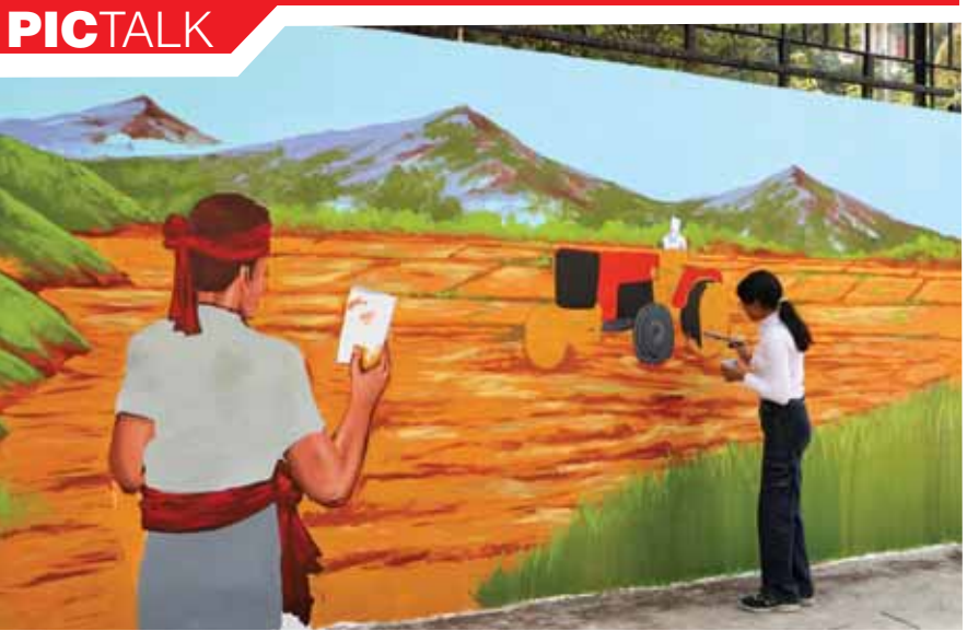
An artist paints a wall at Lodhi Road area, in New Delhi

tors. Demand weakness is a central issue. While rural demand remains relatively resilient thanks to a favourable monsoon, it alone cannot offset the broader slowdown. Restrictive monetary policies have further constrained growth. To combat inflation, the RBI has kept interest rates steady for two years, leading to high borrowing costs that discourage both business investment and consumer spending. Global and domestic challenges compound the problem. Slowing global demand and climate-related disruptions in agriculture have adversely affected exports and food production. Additionally, the RBI's interventions to stabilise the rupee by selling dollars have inadvertently tightened liquidity, slowing economic growth. A stronger rupee, while stabilising in some respects, makes Indian exports more expensive and less competitive internationally. Addressing these challenges requires targeted solutions. Boosting consumption through wage growth could be a key strategy. Policy measures that reduce bureaucratic hurdles, provide tax incentives, and simplify labour and land laws can unlock the potential of small and medium enterprises, which form the backbone of the economy. Tackling inflation and strengthening supply chains will also play a critical role in stabilising the economy.