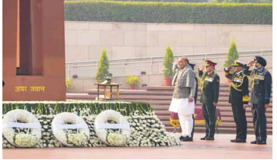
Union Defence Minister Rajnath Singh pays homage at the National War Memorial on the occasion of Vijay Diwas, marking India's victory in the 1971 Bangladesh liberation war. Chief of Defence Staff (CDS) Gen Anil Chauhan, Chief of Army Staff Gen. Manoj Pande, Navy Chief Admiral Dinesh K Tripathi and IAF Chief Air Chief Marshal AP Singh are also seen