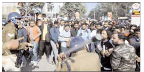
Police lathicharge on protesters outside JSSC office Namkum in Ranchi on Monday.

been made on all the routes leading to the JSSC office. The office premises have also been converted into a cantonment. Vajra vehicles, water cannons and 2500 soldiers have been deployed on the spot. At the same time, the protesting students clearly say that the police are not happy with even peaceful protests. They said that in a democracy everyone has the