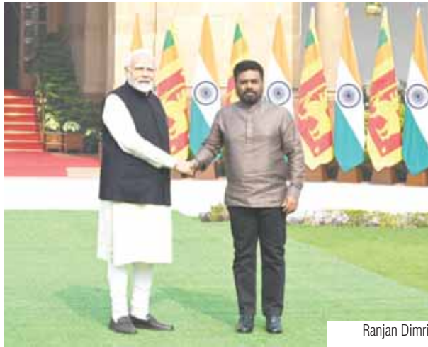
Rameshwaram and Talaimanar to boost connectivity between the two nations.

India and Sri Lanka on Monday here adopted a futuristic vision to expand their partnership, resolved to soon conclude a defence cooperation pact and decided to ramp up energy ties by establishing electricity grid connectivity and multi-product petroleum pipelines. The decisions were taken during wide-ranging talks between Prime Minister Narendra Modi and Sri Lankan President Anura Kumara Dissanayaka. Modi said both sides decided to emphasise investment-led growth and connectivity for the India-Sri Lanka economic partnership, and it was decided that physical, digital and energy connectivity will be key pillars of the cooperation. Work will be done to establish electricity grid connectivity and multi-product petroleum pipelines, Modi said, adding India will supply liquefied natural gas to the island nation's power plants. The prime minister also announced that a ferry service will be started between