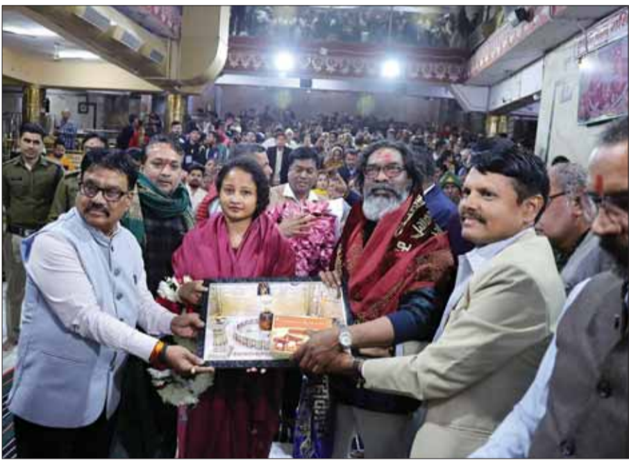
Chief Minister Hemant Soren along with his wife and MLA Kalpana Murmu Soren pray at Mahakal Shiva Temple in Ujjain on Monday.

The school teachers also went to the police station regarding this matter, but no action was taken. This entire incident has been captured in CCTV. The footage clearly shows how a miscreant is misbehaving with the girls.