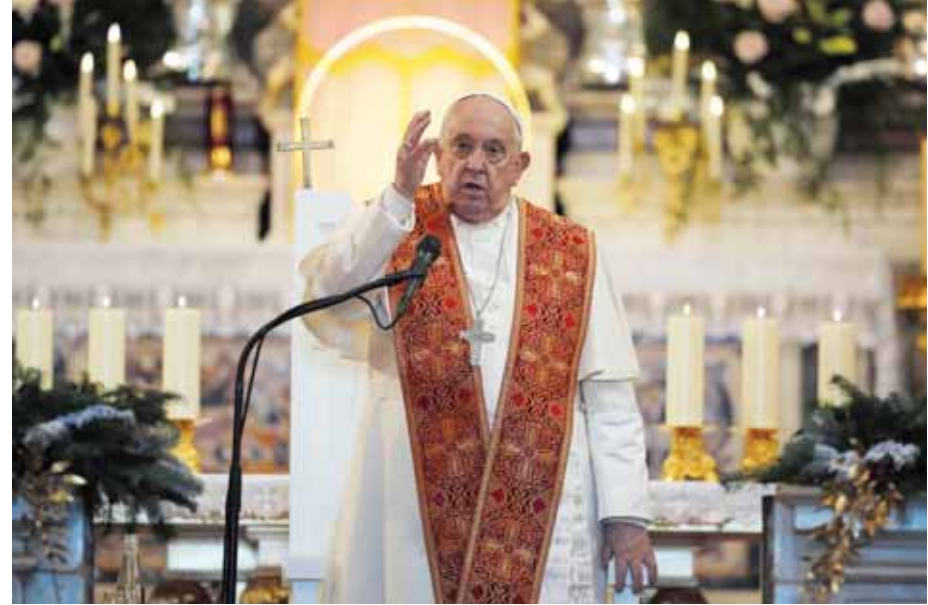
Pope Francis delivers the Angelus prayer inside the Cathedral of Our Lady of the Assumption of Ajaccio on the occasion of his one-day visit in the French island of Corsica on Sunday.

Pope Francis on the first papal visit ever to the French island of Corsica on Sunday called for a dynamic form of laicism, promoting the kind of popular piety that distinguishes the Mediterranean island from secular France as a bridge between religious and civic society. Speaking at the close of a Mediterranean conference on popular piety, Pope Francis, as he is called in Corsican, described a concept of secularism "that is not static and fixed, but evolving and dynamic," that can adapt to "unforeseen situations" and promote cooperation "between civil and ecclesiastical authorities." The pontiff said that expressions of popular piety, including processions, communal prayer of the Holy Rosary, "can nurture constructive citizenship" on the part of Christians. At the same time, he warned against such manifestations being seen only in terms of folklore, or even superstition. During off-the-cuff remarks, the pope relayed his experience attending a festival in northern Argentina before his pontificate where he witnessed the importance of popular piety for the faithful "that seeks a healthy complicity." The visit to Corsica's capital Ajaccio, birthplace of Napoleon, is one of the briefest of his papacy beyond Italy's borders, just about nine hours on the ground, including a 40-minute visit with French President Emmanuel Macron. Francis was joined on the dais by the bishop of Ajaccio,