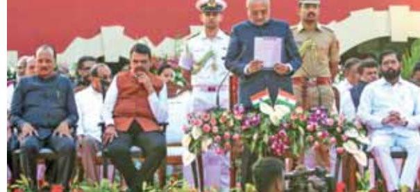
Maharashtra Governor CP Radhakrishnan, Chief Minister Devendra Fadanvis, Deputy Chief Ministers Ajit Pawar and Eknath Shinde and others during the swearing-in ceremony of cabinet ministers amid State Cabinet expansion, at Raj Bhavan, in Nagpur

In the first-ever expansion of this ministry undertaken by him ten days after he and two Deputy Chief Ministers were sworn in, Maharashtra Chief Minister Devendra Fadanvis on Sunday inducted 39 ministers, including 33 ranked ones, into his Cabinet, while he dropped 10 senior MahaYuti leaders, including BJP's Sudhir Mungantiwar and Nationalist Congress Party NCP (Ajit Pawar) leader Chhagan Bhujbal, from it. In a swearing-in ceremony held at Raj Bhavan in Nagpur for the second time since 1981, Maharashtra Governor CP Radhakrishnan administered oath of office to the 39 ministers, including six Ministers of State, ahead of the start of the Winter Session of the Maharashtra Legislature on Monday. Interestingly enough, as many as 25 new faces found place in the Devendra Fadanvis Cabinet. Late BJP leader Gopinath Munde's daughter Pankaja Munde, who has made a comeback as a State minister for the second time in her career, is among the four women ministers in the State Cabinet. With the induction of 39 ministers, the total number of ministers in the State Cabinet has gone up to 42, which is one less than the stipulated 43-member ministry which accounts for 15 percent of total