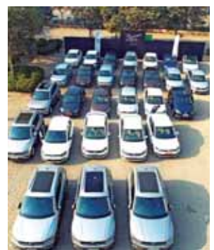
Toyota Kirloskar Motor, Hyundai Motor India, Kia

It is the highest-ever participation in the history of the event so far, he added. Automakers participating in the event include Tata Motors, Maruti Suzuki, Mahindra & Mahindra,