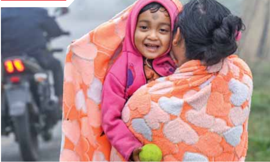
A woman protects her child from cold during a foggy winter morning, in Nadia