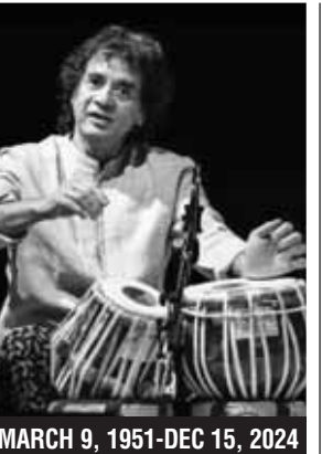
MARCH 9, 1951-DEC 15, 2024

in corrupt practices and bribery in India, UAE and Turkey. "In 2019, Oracle India sales employees also used an excessive discount scheme in connection with a transportation company, a majority of which was owned by the Indian Ministry of Railways..." One of the sales employees involved in the transaction maintained a spreadsheet that indicated $67,000 was the "buffer" available to potentially make payments to a specific Indian SOE (State Owned Entity) official. "A total of approximately $330,000 was funneled to an entity with a reputation for paying SOE officials and another $62,000 was paid to an entity controlled by the sales employees," states the 10-page order of Securities and Exchange Commission imposing hefty fine of Rs.23 Million Dollars on Oracle, caught for bribery amount of 6.8 Million Dollars.