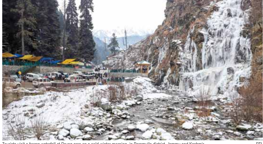
Tourists visit a frozen waterfall at Drung area on a cold winter morning, in Baramulla district, Jammu and Kashmir