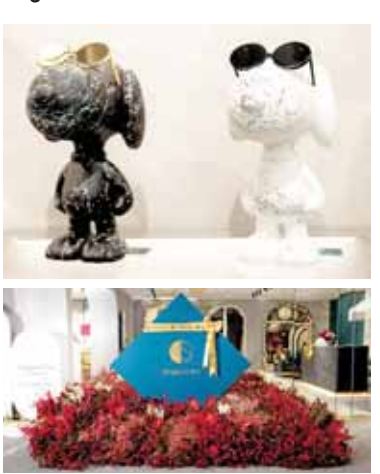
Featuring a collaboration with the esteemed furniture brand EDRA, the Delhi store also marks the debut of Maison Sia's first furniture line,

Maison Sia x Edra . The synergy between local architects, such as Seza Architects , and international design houses has shaped a unique and immersive shopping experience. With luxury home décor products like funky showpieces namely Leblon Delienne , Sas Atelier , different-sized candles, and heavy coffee table books, the boutique also features exquisite lighting solutions, with each piece crafted from responsibly sourced materials, adding character and sophistication to any space. Designer wallpapers and precisely curated furniture further elevate the store's ambiance, offering a glimpse into a world of design where quality and creativity meet. Maison Sia's Delhi flagship store signals the brand's commitment to bringing global design luxury narratives to India's most refined design enthusiasts.