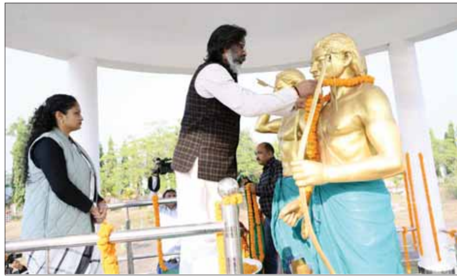
Chief Minister Hemant Soren and MLA Kalpana Soren paying homage to martyrs Sido-Kanhu, Chand-Bhairav and braveheart Phoolo-Jhano at Sido-Kanhu Murmu Park, Bhognadih, Barhet on Saturday.

ernment is a government run from the village. The line of development is being drawn according to the needs of the poor, labourers and deprived class people here. He said that I will not let all your