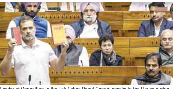
Leader of Opposition in the Lok Sabha Rahul Gandhi speaks in the House during the Winter session of Parliament, in New Delhi, Saturday

Leader of Opposition Rahul Gandhi on Saturday accused the Bharatiya Janata Party (BJP), and the Rashtriya Swayamsevak Sangh (RSS) of being "supporters of Manusmriti" adding that "their supreme leader Savarkar always blamed the Indian Constitution". Participating in a debate in the Lok Sabha on the 75 years of the adoption of the Constitution, the Congress leader said that while talking of protecting the Constitution, the ruling party is "ridiculing" Savarkar. Drawing a parallel with the story of Eklavya who had to chop off his thumb as 'Guru Dakshina' to Dronacharya, Gandhi alleged that by creation of "monopolies" for the Adani Group in various sectors, bringing in the Agnipath scheme, firing teargas at protesting farmers, bringing in lateral entry and allowing paper leaks, the government was "chopping off" the thumb of the youth, tillers, backward class people and the poor. Gandhi said that he wants to tell every poor person that the Constitution protects them, but the BJP keeps attacking it 24x7. He also reiterated his promise made on the floor of the House last session that a caste census will be conducted and the 50 per cent cap on reservation will be done away with to usher in a "new type of development" in the country. "I want to start my speech by