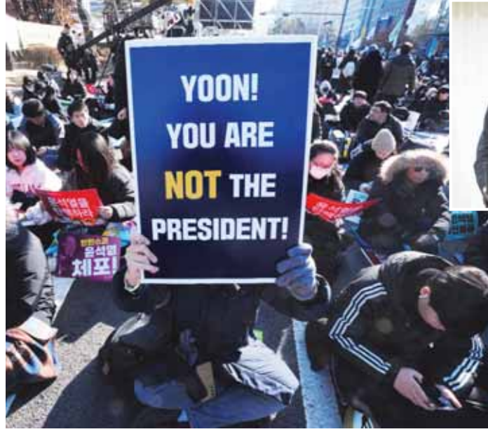
A participant holds up a banner before a rally to demand South Korean President Yoon Suk Yeol's impeachment outside the National Assembly in Seoul, South Korea. (inset) President Yoon Suk Yeol.

from launching provocations by miscalculation. Han asked the foreign minister to inform other countries that South Korea's major external policies remain unchanged, and the finance minister to work to minimize potential negative impacts on the economy by the political turmoil, according to Han's office.