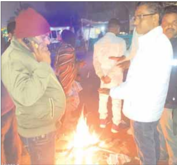
People stand near a bonfire to warm themselves on a cold winter evening in Ranchi on Saturday.