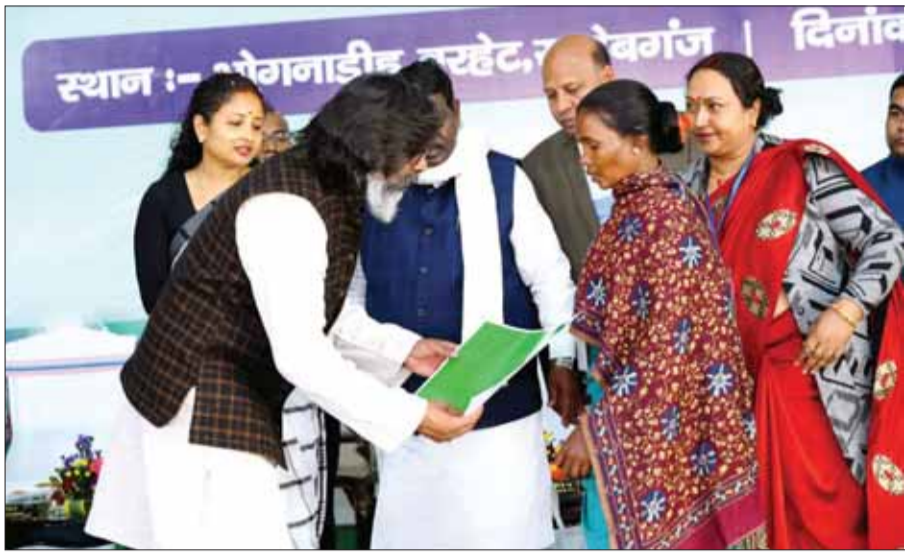
Chief Minister Hemant Soren distributes assets among beneficiaries during laying the foundation stone of various development projects in Barhet on Saturday.

address that despite Jharkhand state being rich in mineral wealth, the tribal-indigenous people here remained deprived of basic facilities. Since the formation of our government, we have been continuously working