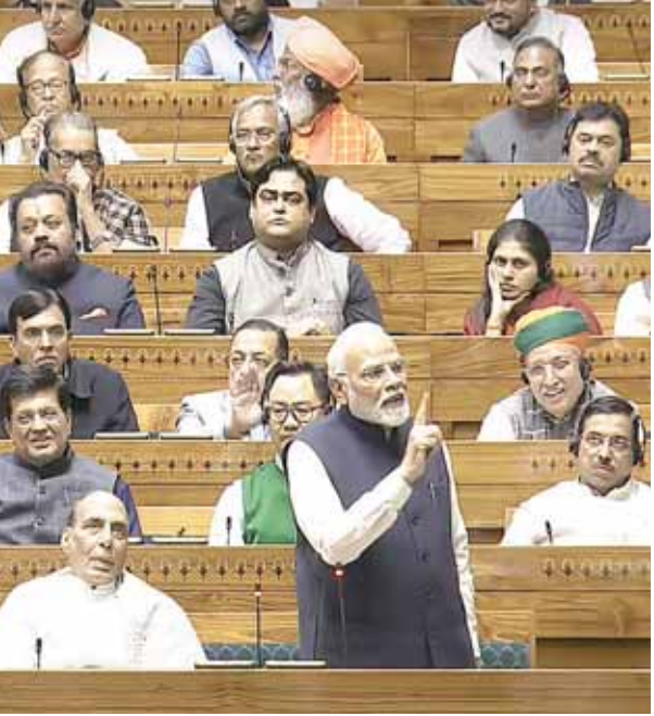
Prime Minister Narendra Modi speaks in the Lok Sabha during the discussion on the 'glorious journey of 75 years of the India Constitution', in the ongoing Winter Session of Parliament