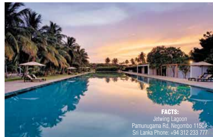
FACTS: Jetwing Lagoon Pamunugama Rd, Negombo 11504, Sri Lanka Phone: +94 312 233 777

The wellness packages integrate these pillars, ensuring that every guest embarks on a transformative journey that inspires lasting lifestyle changes. From slow flow yoga and meditation sessions, luxurious spa treatments, age-old ayurvedic treatments, and nourishing wellness cuisine, we provide a comprehensive approach to rebalancing and restoring your body, mind, and spirit."