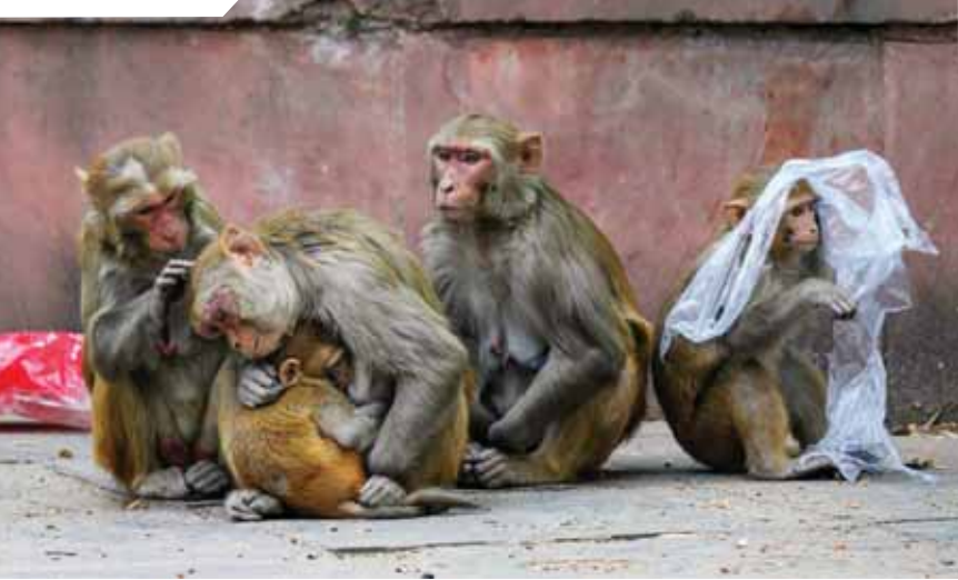
Monkeys huddle together on a chilly day, in New Delhi