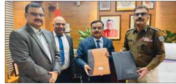
Bol and Jharkhand Police signed MoU for salary package.

made available to the policemen under this special salary package.