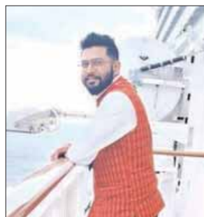
BY SRIJAN KISHORE

The conclusion of COP29 in Baku, Azerbaijan, marks a critical juncture in global climate governance, with implications that resonate deeply for India. As a rapidly developing nation grappling with the dual challenge of sustaining economic growth while mitigating climate vulnerabilities, India's response to the outcomes of COP29 will meaningfully influence its Environmental, Social, and Governance (ESG) trajectory.