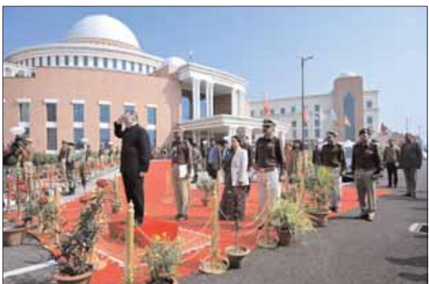
Governor Santosh Gangwar receives Guard of Honour at the State Legislative Assembly in Ranchi on Wednesday.

The state government will take the initiative to include "Ho", "Mundari", "Kudukh" and other tribal languages in the Eighth Schedule of the