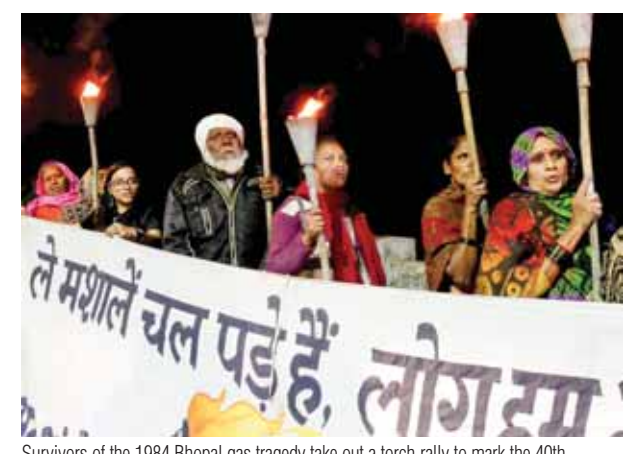
Survivors of the 1984 Bhopal gas tragedy take out a torch rally to mark the 40th anniversary of the disaster.