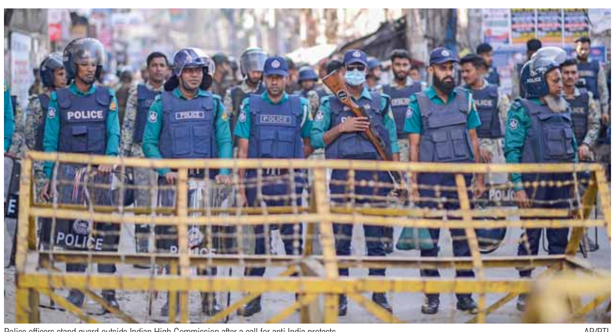
Police officers stand guard outside Indian High Commission after a call for anti India protests