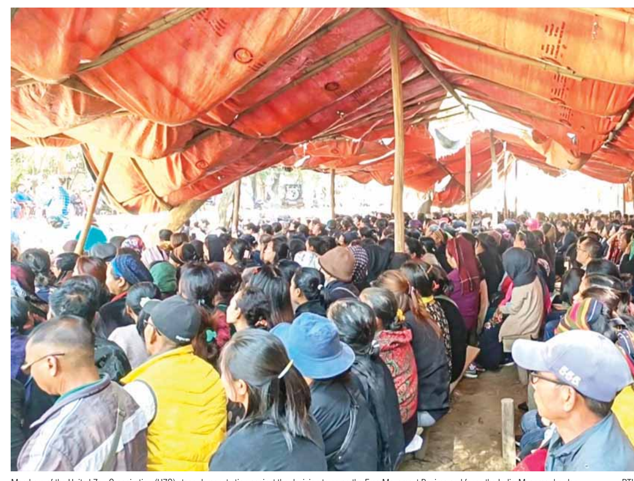
Members of the United Zou Organization (UZO) stage demonstration against the decision to scrap the Free Movement Regime and fence the India-Myanmar border.

Chandigarh has become the country's first administrative unit where 100 per cent implementation of the three criminal laws has been done with Prime Minister Narendra Modi on Tuesday saying these new legislations are becoming protector of citizen's rights and the basis of ease of justice. The laws -- Bharatiya Nyaya Sanhita, Bharatiya Nagrik Suraksha Sanhita and Bharatiya Sakshya Adhiniyam - came into effect on July 1, replacing the British-era Indian Penal Code, Code of Criminal Procedure and the Indian Evidence Act, respectively. Chandigarh has become the country's first administrative unit where 100 per cent implementation of the three laws has been done. Speaking on the occasion, the prime minister said the new criminal laws represent a concrete step towards realising the ideals enshrined in the Constitution for the benefit of all citizens. He said the new laws came into effect at a time when country is moving ahead with the pledge of "Viksit Bharat" and 75 years of adoption of Constitution have been completed, thus the launch of the Bharatiya Nyaya Sanhita, rooted in constitutional values, is a significant occasion.