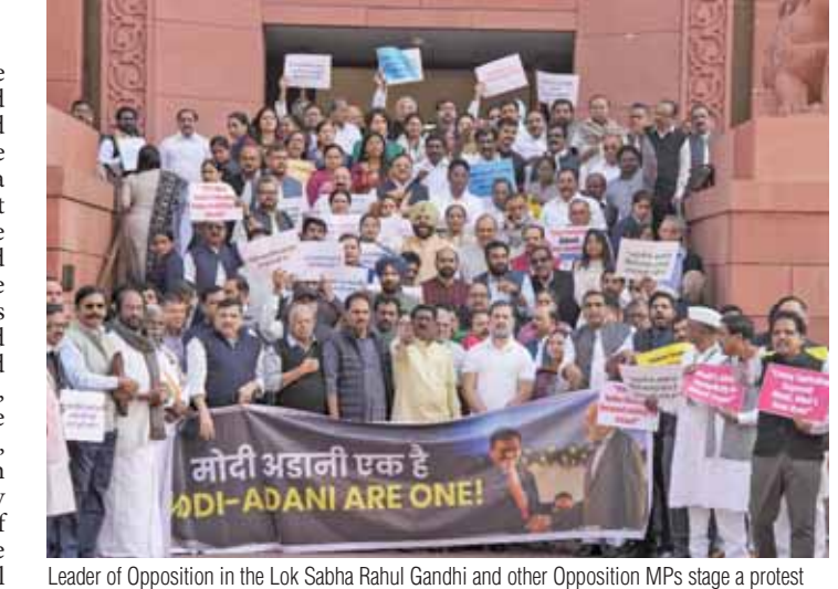
Leader of Opposition in the Lok Sabha Rahul Gandhi and other Opposition MPs stage a protest during the Winter session of Parliament

Fissures are visible in the Opposition's Congress led INDIA Bloc, after the grand old party's massive defeats in the recent Maharashtra and Haryana Assembly elections and not much appreciated performance in the State polls of Jharkhand and Jammu and Kashmir where the party contested with its alliance partners, Jharkhand Mukti Morcha (JMM) and National Conference (NC), respectively. Rather one of the key allies in INDIA Bloc, Trinamool Congress (TMC), on Tuesday pitched for their party supreme West Bengal Chief Minister Mamata Banerjee be made the Bloc leader for all practical purposes, as the woman leader has a "100 per cent record" to take the Bharatiya Janata Party (BJP). Partners like TMC, Samajwadi Party (SP) have raised eyebrows as the alliance could not work in the bypolls of Uttar Pradesh other States and the defeats have been shouldered on Congress. Congress found itself without its key allies, including the SP and TMC during a joint Opposition protest in the Parliament complex on Tuesday.