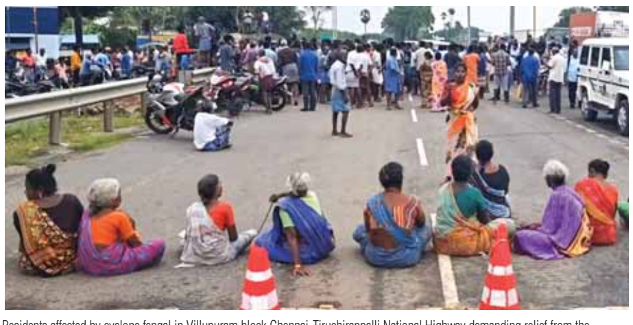
Residents affected by cyclone Fengal in Villupuram block Chennai-Tiruchirappalli National Highway demanding relief from the government.