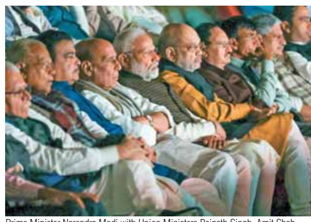
Prime Minister Narendra Modi with Union Ministers Rajnath Singh, Amit Shah, Nitin Gadkari, JP Nadda, and others during the screening of the film 'The Sabarmati Report', at the Parliament in New Delhi