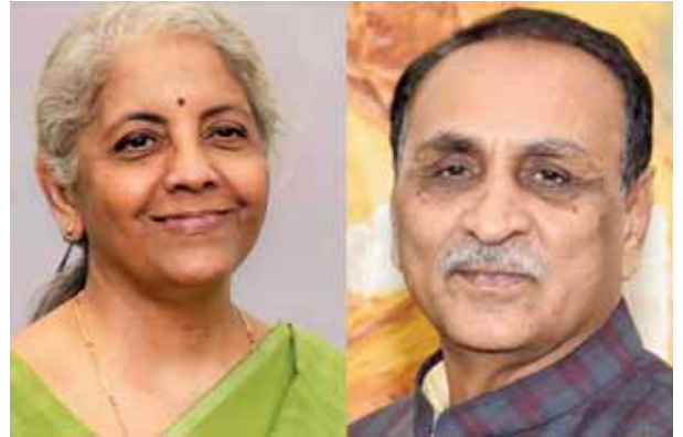
The BJP's Parliamentary Board is sending former Gujarat CM Vijay Rupani and Finance and Corporate Affairs Minister Nirmala Sitharaman as central observers

After days of uncertainty, in the wake of it leading the MahaYuti to a spectacular victory in the Maharashtra Assembly polls, the ruling Bharatiya Janata Party (BJP) finally began to get its act together on Monday as it called its legislature party meeting on December 4 to elect its leader - ahead of the swearing-in ceremony scheduled to be held on the following day. Though the BJP has not yet formally announced its Chief Ministerial choice, party sources said that the party's central leadership has put a stamp of approval on the name of its senior leader and former CM Devendra Fadnavis for the top post in the state. At a meeting to be held at 10 am on December 4 in the Central Hall of the Maharashtra Vidhan Bhavan, Fadnavis will in all likelihood be elected as the BJP's Legislature Party (BJPLP) leader, paving the way for his being sworn in as the next CM of Maharashtra on December 5. The BJP's Parliamentary Board is sending former Gujarat CM and the party's in-charge for Punjab Vijay Rupani and Finance and Corporate Affairs Minister Nirmala Sitharaman as the central observers for the BJPLP meeting. After the BJPLP meeting, the leaders of the ruling MahaYuti, comprising the BJP, Shiv Sena (Eknath Shinde) and NCP (Ajit Pawar), will call Maharashtra Governor CP Radhakrishnan, and formally stake claim to form a new government in the state. While confirming that the