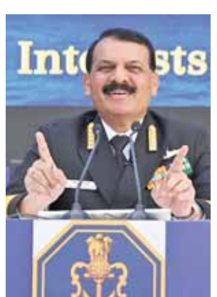
Chief of the Naval Staff Admiral Dinesh K. Tripathi addresses a press conference, ahead of Navy Day

Navy Chief Admiral Dinesh K Tripathi on Monday said here Indian Navy is aware of "surprising growth" of the Pakistan Navy, that aims to become a 50-ship Navy in the next decade with the help of China. He also said Pakistan has chosen weapons over the welfare of its people. Making this assertion here, the Naval Chief said given the state of its economy, Pakistan is strengthening its Navy. "They have chosen weapons over the welfare of their people," he said and quipped "good luck to them." "We are aware of the surprising growth of the Pakistan Navy which aims to become a 50-ship Navy," he said. On China helping Pakistan boost its maritime prowess, the Navy Chief said it showed Beijing's interest in making that country militarily stronger. "Many Pakistan Navy warships and submarines are being built with Chinese support showing that China is interested in making Pakistan's Navy stronger," he said. "Their eight new submarines will have significant combat potential for the Pakistan Navy but we