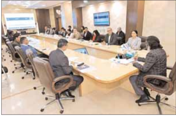
Chief Minister Hemant Soren holds a high-level meeting with the Principal Secretary / Secretary of various departments in the Jharkhand Ministry in Ranchi on Monday.

The Chief Minister said that revenue management should be strengthened. Along with this, steps should be taken to control the waste of revenue and establishment expenditure. The Chief Minister also asked the officials to remove its flaws by doing micro level observation of the revenue generation system. He said that all departments should prepare an action plan for revenue collection. The CM said that many times due to lack of coordination between the departments, the pace of revenue collection slows down and revenue collection is not done as per the target. In such a situation, to solve this