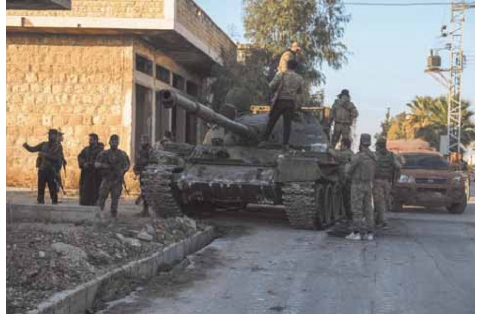
Syria. Thousands of Syrian insurgents have fanned out inside Syria's largest city Aleppo a day after storming it with little resistance from government troops.