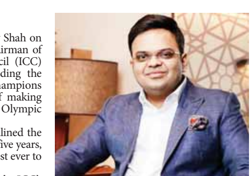
As of now, the Pakistan Cricket Board (PCB) has decided to accept the 'Hybrid Model' under which India play their matches in Dubai. But the PCB also wants the same courtesy to be accorded to Pakistan in all four ICC tournaments till 2031, which will be co-hosted or singularly hosted by the Indian cricket board. Now, as the head of the global body and with less than 100 days left for the tournament to begin, Shah will have to co-ordinate with both the PCB and his former colleagues at the BCCI for an 'acceptable solution' in order to organise a hassle-free tournament.

PTI ■ DUBAI Indian cricket administrator Jay Shah on Sunday took charge as the chairman of the International Cricket Council (ICC) with an immediate goal of ending the impasse surrounding the Champions Trophy and a broader vision of making cricket a commercially viable Olympic sport. The 36-year-old Shah, who headlined the BCCI as its secretary for the last five years, is the fifth Indian and the youngest ever to head the global cricket body. He was the unanimous choice of the ICC's Board of Directors and replaced New Zealand attorney Greg Barclay, who didn't wish to continue for a third consecutive term. Before Shah, businessman late Jagmohan Dalmiya, politician Sharad Pawar, lawyer Shashank Manohar and industrialist N Srinivasan have all headed the world cricket body. Shah, the son of India's Home Minister Amit Shah, will have his task cut out as the ICC looks to find an acceptable solution to implement the 'Hybrid Model' for the Champions Trophy originally scheduled in Pakistan.