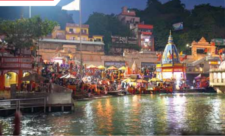
Devotees attend 'Ganga Aarti' at Har Ki Pauri, in Haridwar