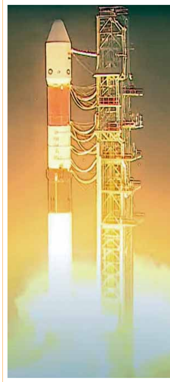
ISRO's PSLV-C60 carrying SpaDeX and its payloads, lifts off from the first launch pad at Satish Dhawan Space Centre, in Sriharikota