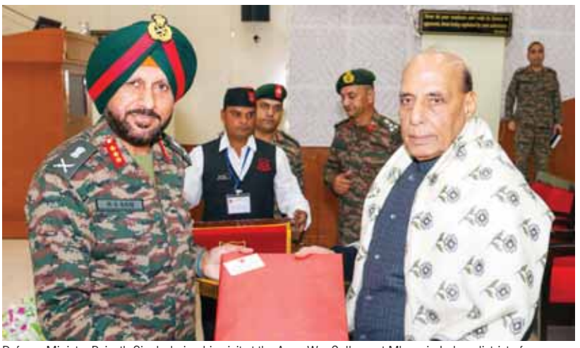
Defence Minister Rajnath Singh during his visit at the Army War College, at Mhow, in Indore district of

Rajnath said the Modi government is committed to strengthening integration and jointness among the three services. "In the times to come, the armed forces will be able to face challenges together in a better and more efficient way," he added. The defence minister said high-level training is provided to officers of all wings in the Mhow Cantonment. He appealed to