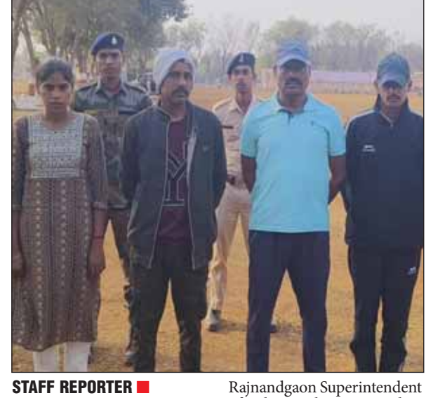
STAFF REPORTER RAJNANDGAON

Three policemen were 1 among four persons arrested on Monday in connection with alleged irregularities in the police constable recruitment in Rajnandgaon district in Chhattisgarh.