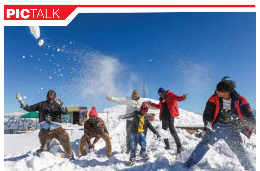
Tourists enjoy after fresh snowfall, at Patnitop hill station in Udhampur

cases with empathy and professionalism. This case is not an isolated incident but a grim reminder of the larger problem of sexual violence that plagues India. Despite constitutional guarantees of equality and dignity, women continue to face systemic discrimination and violence. The societal tendency to blame victims, coupled with institutional apathy, exacerbates their trauma. The High Court's poignant questions — "Why can't a woman walk freely, dress as she wishes, or speak to a man without being judged?" — resonate deeply in a society still grappling with entrenched patriarchy. The Court rightly emphasised that the onus is on the State and society to protect women without perpetuating stigma or blame. The incident also exposed lapses in campus security at Anna University. The university, which allows unrestricted access to outsiders, failed to prevent the accused from entering the premises. The police's approach also came under scrutiny for prematurely ruling out the involvement of additional suspects. The Court directed the State to examine whether rules were violated during these proceedings. This tragic case underscores the urgent need for systemic reforms. Law enforcement must be trained to handle cases of sexual violence with sensitivity. The media, too, must exercise restraint in reporting such cases to avoid amplifying the victim's trauma.