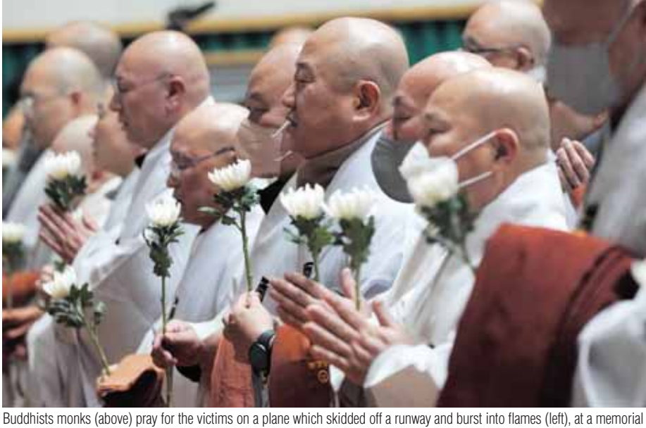
altar at Muan sport park in Muan, South Korea, on Monday.

Other observers said the videos showed the plane was suffering from suspected engine trouble but the landing gear malfunction was likely a direct reason for the crash. They said there wouldn't likely be a link between the land ing gear problem and the suspected engine issue. Earlier Monday, another Boeing 737-800 plane operated by Jeju Air returned to Seoul's Gimpo International Airport shortly after takeoff when the pilot