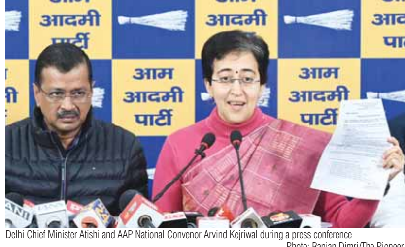
Delhi Chief Minister Atishi and AAP National Convener Arvind Kejriwal during a press conference.

Yojana, reaffirming the legitimacy of the scheme. The fresh controversy will add another dimension to the ongoing tussle between the AAP and the bureaucracy, with accusations flying between parties. The move underlines the tenuous relationship between the bureaucracy and the elected Delhi Government after an amendment to the Government of National Capital Territory of Delhi (GNCTD) Act, the services department comes under the control of the Lieutenant Governor. The latest flashpoint, which comes weeks ahead of the Delhi Assembly polls, sparked a slugfest between the AAP and BJP leaders. The BJP has accused the ruling party of duping people, since the two schemes have not been approved yet. The Department of Women and Child Development (WCD), in a public notice in newspapers, has said the Mukhyamantri Mahila Samman Yojana does not exist and has not been approved by the Delhi government. It has urged