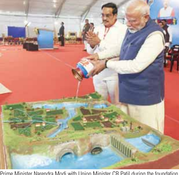
Prime Minister Narendra Modi with Union Minister CR Patil during the foundation stone laying ceremony of Ken-Betwa River Linking Project, in Khajuraho, Madhya Pradesh.

The ambitious first of its kind interlinking of the Ken-Betwa River as desired by former Prime Minister late Atal Bihari Vajpayee two decades ago, finally kicked started with the foundation stone laying by PM Narendra Modi on Wednesday which also marked the birth anniversary of the political stalwart Bharat Ratna Vajpayee. The Vajpayee government had proposed river linking as a solution for irrigation needs as well as for dealing with floods. Modi laid the foundation stone of the Rs 44,600 crore Ken-Betwa River Link Project at Khajuraho in Madhya Pradesh and said the river linking will open new doors of prosperity and happiness in the Bundelkhand region. Union Water Resources Minister C R Patil and Madhya Pradesh Chief Minister Mohan Yadav handed over two kalash (urns) containing water from Betwa and Ken rivers, respectively, to Modi, who poured it over a model of the project to launch the river linking work. As per the initial estimation of the project, nearly 44 lakh people in 10 districts of Madhya Pradesh and 21 lakh in Uttar Pradesh will get drinking water under the project. Nearly 7.18 lakh agricultural families in 2,000 villages will benefit from the project, which will also generate 103 MW of