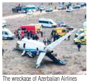
The wreckage of Azerbaijan Airlines Embraer 190 on the ground near the airport of Aktau, Kazakhstan.

hydropower and 27 MW of solar energy, officials involved in the project said. Addressing the event Modi said that in the 21st century, only the nations with adequate and well-managed water resources can advance. "The major challenge of the 21st century is water security. In the 21st century only those countries who have adequate water resources with proper management will move forward," he said. The PM also released a commemorative stamp and a coin in the memory of Vajpayee. Modi also performed 'bhumi puja' or ground-breaking ceremony for the construction of 1,153 Atal Gram Sewa Sadans costing Rs 437 crore at the Khajuraho program. Under the Ken Betwa project, a 77-metre high and 2.13 kilometres long Daudhan dam and two tunnels (upper level 1.9 km and lower level 1.1 km) will be constructed on the Ken river in the Panna Tiger Reserve. The dam will store 2,853 million cubic metres of water, the chief minister said. The surplus Ken water will be transferred to the Betwa river through the 221-km-long link canal from Daudhan dam, providing irrigation and drinking water facilities in both the states, he said. Continued on page 2