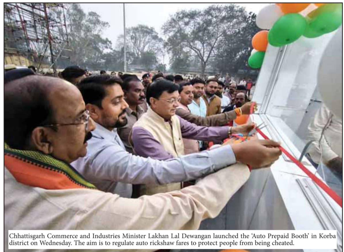
Chhattisgarh Commerce and Industries Minister Lakhan Lal Dewangan launched the 'Auto Prepaid Booth' in Korba district on Wednesday. The aim is to regulate auto rickshaw fares to protect people from being cheated.

Promotional material based on government schemes was distributed at the site.