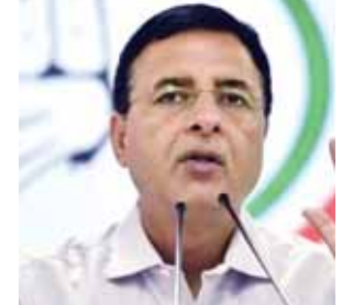
the three opposition leaders? Who is the constitutional authority? Who are the journalists? Who are the business persons? What information was retrieved by the BJP government and agencies? How was it used - misused and to what consequence?" the Congress leader asked. He also questioned if appropriate criminal cases would now be lodged against the political executive or officers in the present government and the company owning NSO. "Will the Supreme Court

PIONEER NEWS SERVICE ■ NEW DELHI Congress general secretary Randeep Surjewala on Sunday claimed that the Pegasus spyware case verdict in the US proved how 300 WhatsApp numbers of Indians were targeted and asked if the Supreme Court would now conduct a further inquiry in view of the judgment. Surjewala shared a media report which said that, for the first time, a court in the US had held Israel's NSO Group liable for its intrusive spyware Pegasus. "The Pegasus spyware case verdict proves how 300 WhatsApp numbers of Indians were targeted in the illegal spyware racket," Surjewala said in a social media post. He said it was time for the Narendra Modi government to answer who the 300 names targeted were. "Who are the two Union ministers? Who are