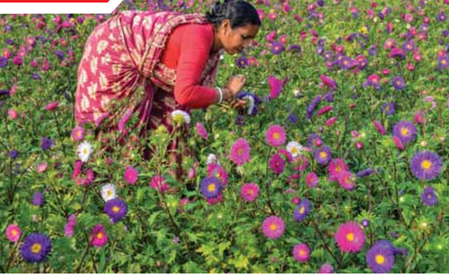
A woman plucks aster flowers at an orchard, in Nadia

T he Role of Indigenous Knowledge in Combating Climate Change: A Legacy of Hope The discourse on climate change dominated discussions at COP 2024, the United Nations Climate Change Conference, held in Baku, Azerbaijan, from November 11 to 22, 2024. Rising global temperatures, depleting natural resources, and rampant environmental degradation have emphasised the urgency of adopting sustainable practices and advancing conservation efforts. Amid this pressing crisis, the role of indigenous communities in preserving the environment emerges as a beacon of hope. Often referred to as the "guardians of nature," these communities have safeguarded ecosystems for centuries through their traditional knowledge, sustainable practices, and deep connection to the land. One exemplary figure embodying this harmonious relationship with nature was Padma Shri Tulsi Gowda. Known as the "Encyclopedia of the Forest" and affectionately called the "tree goddess" by her Halakki Vokkaliga tribe in Karnataka, Tulsi Gowda's life and work illustrate the profound impact of indigenous wisdom on environmental preservation. With an unwavering commitment to nature, she planted 30,000 saplings during her lifetime, nurturing them with meticulous care.