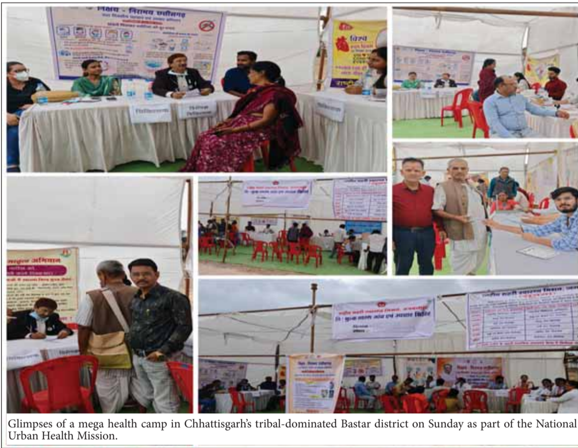
Glimpses of a mega health camp in Chhattisgarh's tribal-dominated Bastar district on Sunday as part of the National Urban Health Mission.

They received guidance on spinach seed production technology, onion cultivation, propagation of fruit plants, vegetable nursery management, jackfruit, lemon and sapota cultivation, livestock feed production, quail rearing and poultry farming.