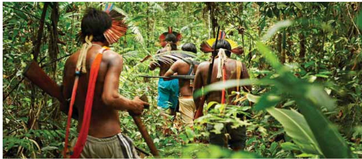
Indigenous communities represent less than 5 per cent of the world's population but protect 80 per cent of the planet's biodiversity, according to the United Nations.