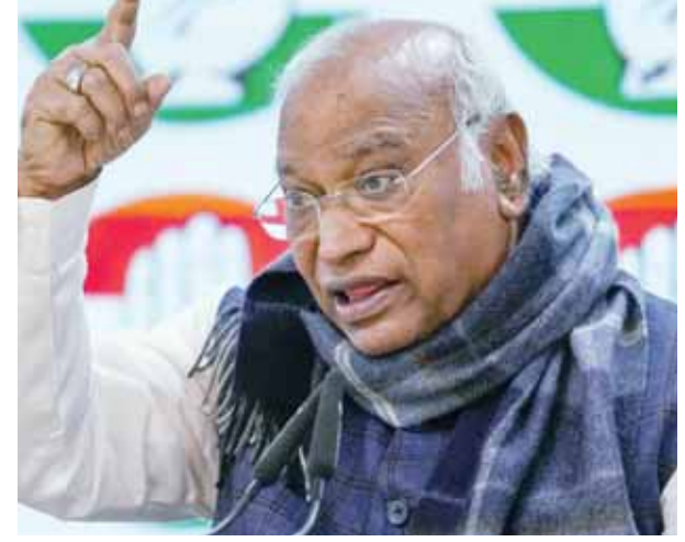
cated the grand old party would legally challenge the amendment, Lok Sabha MP and Congress general secretary (organisation) KC Venugopal said the poll panel had chosen opacity and a pro-government attitude in its dealings thus far. Reacting to the development, Kharge said Modi government's audacious amendment in the Conduct of Election Rules is another assault in its systematic conspiracy to destroy the institutional integrity of the Election Commission of India. "Earlier, they had removed the Chief Justice of

an election rule to prevent public inspection of certain electronic documents such as CCTV camera and webcasting footage as well as video recordings of candidates to prevent their misuse. Based on the recommendation of the Election Commission of India (ECI), the Union law ministry on Friday amended Rule 93(2)(a) of the Conduct of Election Rules, 1961, to restrict the type of "papers" or documents open to public inspection. While Congress general secretary-in-charge communications Jairam Ramesh indi-