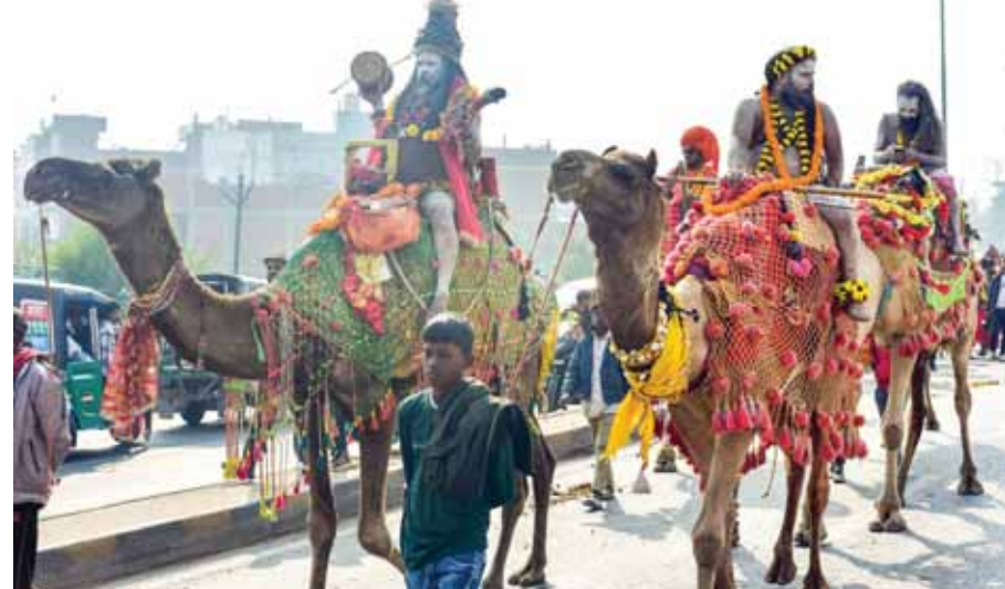
Sadhus of 'Panch Dashnam Avahan Akhara' take part in a religious procession called 'Peshwai', to reach the Mahakumbh ahead of Maha Kumbh Mela 2025, in Prayagraj