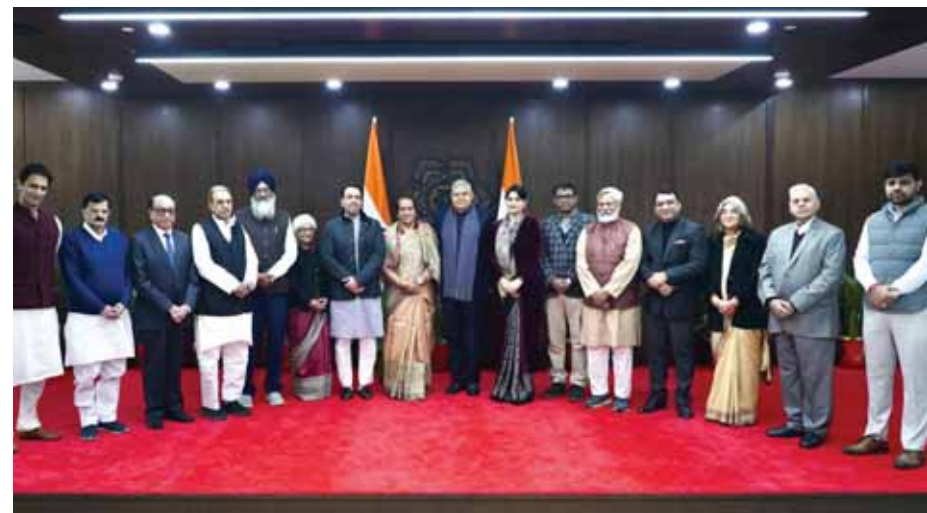
to think, why did you go there (Parliament)?" he said. Addressing awardees of the Chaudhary Charan Singh Awards - 2024, the vice-president said agriculture was the spine of rural development. "Unless agriculture develops, the rural landscape cannot be changed. And unless the rural landscape changes, we cannot aspire to have a developed nation," he said. For India to be a developed nation by 2047, people's income must increase eight-fold that, he said, was a "daunting challenge". Dhankhar also laid stress on the need for strengthening the village economy. "The greatest market we have is agricultural produce, yet farming communities are hardly involved with it. The farming sector must be prioritised by governments for it

PNS ■ NEW DELHI Against the backdrop of Parliament witnessing poor productivity due to disruptions, Vice-President Jagdeep Dhankhar on Sunday called for accountability of lawmakers and said people would force them to think why they were sent to Parliament. He also said that for any democracy to succeed, expression and dialogue must go hand in hand with great responsibility on both sides. Dhankhar is the Rajya Sabha's ex-officio chairman. Calling for accountability among parliamentarians, he said, "... Make no mistake, I am referring to parliamentarians. People have learned to take disorder as order. There is no sense of revulsion." Hopefully, people will write and their thoughts will move, the vice-president said, according to an official statement. "People will force you