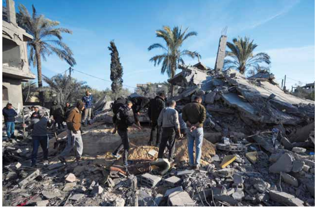
Palestinians look at home destroyed by an Israeli strike late Saturday in Deir al-Balah.

Holocaust, adamantly rejects such allegations. It says it has made great efforts to spare civilians and is only at war with Hamas, which it accuses of genocidal violence in the attack that ignited the war.