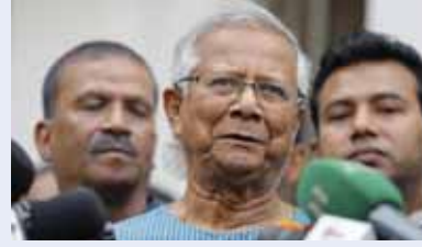
India's relations with Bangladesh are passing through a difficult phase after the Sheikh Hasina government succumbed before violent protests led by students in the first week of August. All development after her fall is quite worrisome for New Delhi. No doubt it was a foregone conclusion that Dhaka will no longer follow a pro-India policy. But Bangladesh is hell-bent upon destroying the cordial and bilateral relations that New Delhi crafted with the Sheikh Hasina regime. The ouster of the liberal Sheikh Hasina regime has embold-