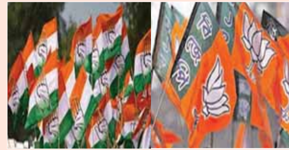
The Mahatari Vandan money is going to BJP's favourites in the name of Sunny Leone, he said.

Information came to light on Sunday that a man in Bastar was collecting the benefits of the scheme by registering as Bollywood actress Sunny Leone.