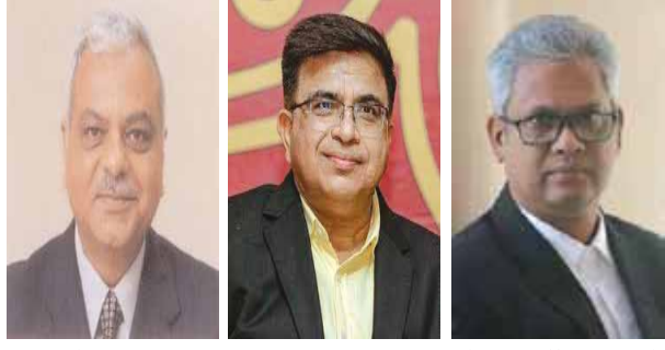
The Economic Offences Wing (EOW) in Chhattisgarh on November 4 registered an FIR against the two retired IAS officers and the former Advocate General for allegedly misusing their position and conniving with