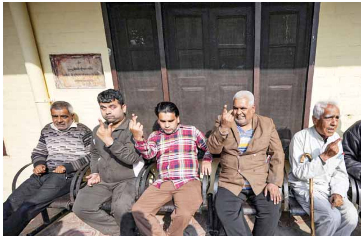
Visually-impaired people show their fingers marked with indelible ink after casting votes during elections in Punjab for five municipal corporations and 44 municipal councils and nagar panchayats, in Amritsar.