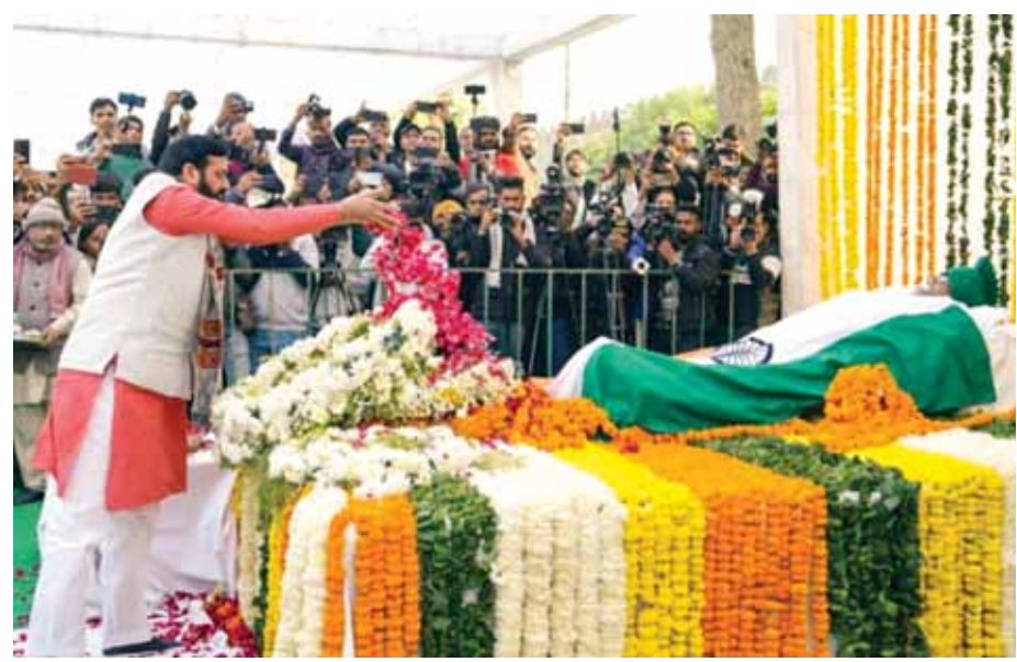
Haryana Chief Minister Nayab Saini pays last respect to the mortal remains of former Haryana chief minister Om Prakash Chautala during his last rites at Teja Khera farmhouse, in Sirsa.