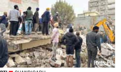
PTI ■ CHANDIGARH

Rescue operations were underway after a multistorey building collapsed in the Sohana village of Punjab's Mohali district on Saturday, officials said. Locals said some people were feared trapped under the debris. The district authorities launched a rescue operation. Two excavators were pressed into