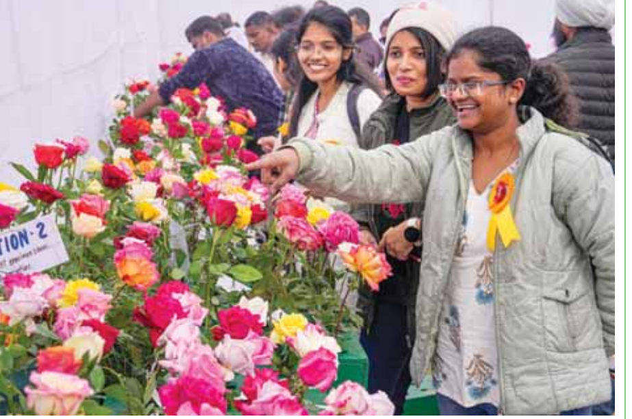
Visitors at the 'All India Winter Rose Show' organised by the New Delhi Municipal Council (NDMC) in association with The Rose Society of India, at India-Africa Friendship Rose Garden, Chanakyapuri