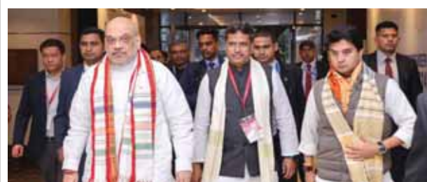
Home Minister Amit Shah with Union Minister for Development of North Eastern Region (DoNER) Jyotiraditya Scindia and Tripura Chief Minister Manik Saha at the 'Bankers Conclave' organised as part of the North Eastern Council, in Agartala.