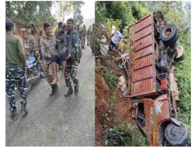
overturned. The four died on the spot and about 30 others sustained injuries. Some of the injured have been admitted to the primary health centre in Koleng. Others are receiving treatment at a hospital in Darbha.

As per preliminary information, the driver of the mini goods carrier, with around three dozen people on board, lost control over the wheel following which it skidded off the road and