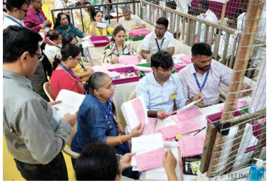
PIONEER NEWS SERVICE ■ NEW DELHI

In a move to check the potential misuse of postal ballot facility extended to voters on poll duty, electoral rules have been changed to ensure that such people cast their vote at designated facilitation centres only and do not keep the ballot papers with them for a long time. Based on the recommendations of the Election Commission (EC), the Ministry of Law and Justice has amended an election rule to prevent public inspection of certain