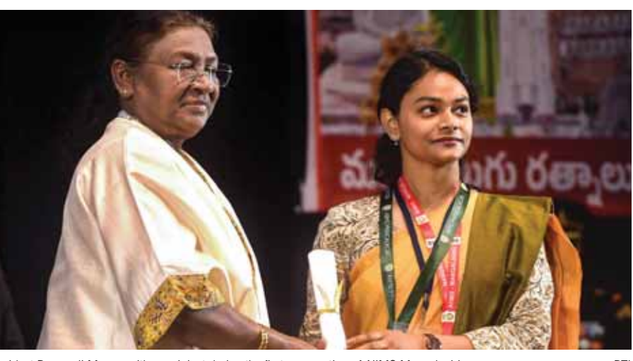
President Droupadi Murmu with a recipient during the first convocation of AIIMS Mangalagiri.

discussion on the issue on Tuesday on the ground that it had already been decided to have a discussion under rule 101 on Wednesday considering the seriousness of the incident. However, the Opposition members were not