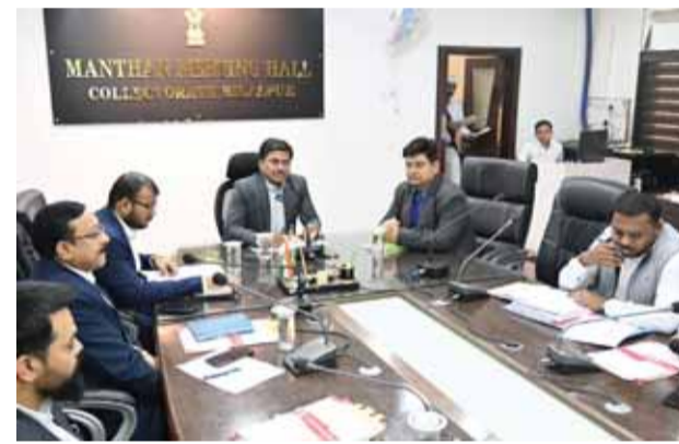
Authorities in Chhattisgarh's Bilaspur district are gearing up to set up a 'Divyang Bazaar' to connect disabled people with employment, an official communique said on Monday.

The disabled people will be allotted space there to set up their businesses. They will also receive the benefits of welfare schemes aimed at uplifting the disabled.