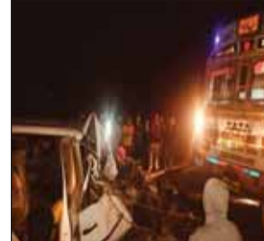
Seven persons including four women were killed on Monday when a sports utility vehicle (SUV) were in collision with a truck in Balod district in Chhattisgarh.

The injured, including five women, a man and a child, were taken to a community health centre and then shifted to the Rajnandgaon district hospital where one of them succumbed during treatment.