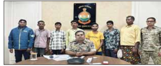
Thirteen Maoists, one carrying a reward of Rs 1 lakh, were arrested and explosives seized from them in Sukma district of Chhattisgarh, police said on Monday.