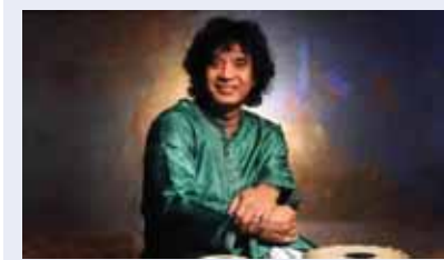
Tabla maestro Zakir Hussain passes away

The four-time Grammy Award winner, Indian tabla maestro and an innovative music fusion creator, Zakir Hussain is no more with us. The silence on his tabla is a huge loss for Hindustani classical music and jazz fusion. Zakir was truly an indelible gem in the world of music. The list of his national and international accolades is really long, as he had always made India proud with his tireless contribution in