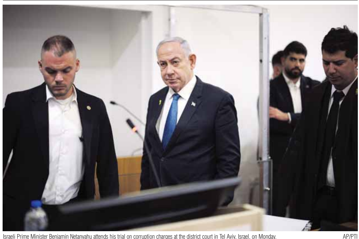
Israeli Prime Minister Benjamin Netanyahu attends his trial on corruption charges at the district court in Tel Aviv, Israel, on Monday.

face, dozens more people came forward with claims of suspected losses that the bank is working to verify, it said. The MUFG case is the second recent one involving criminal activity at a major Japanese financial institution. In November, Nomura Holdings acknowledged that a former employee had been arrested on suspicion of robbery, attempted murder and arson targeting a client in Hiroshima. Asked about the MUFG thefts, the chief government spokesman said Monday that banking operations require high levels of trust and a sense of public service. The case was "extremely regrettable," said Chief Cabinet Secretary Yoshimasa Hayashi.