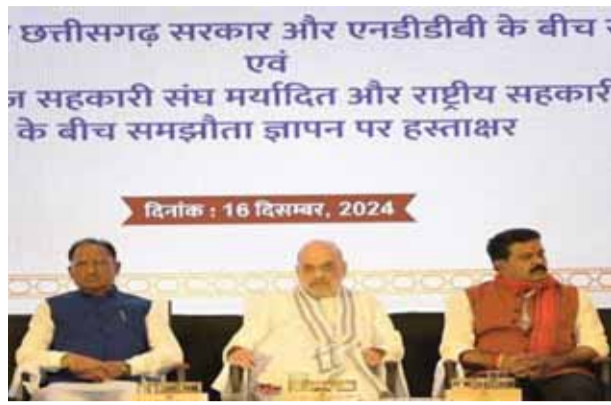
The Chhattisgarh government signed two MoUs on Monday to boost dairy and forest produce sectors in the state.

The Chhattisgarh State Minor Forest Produce Cooperative Federation Ltd