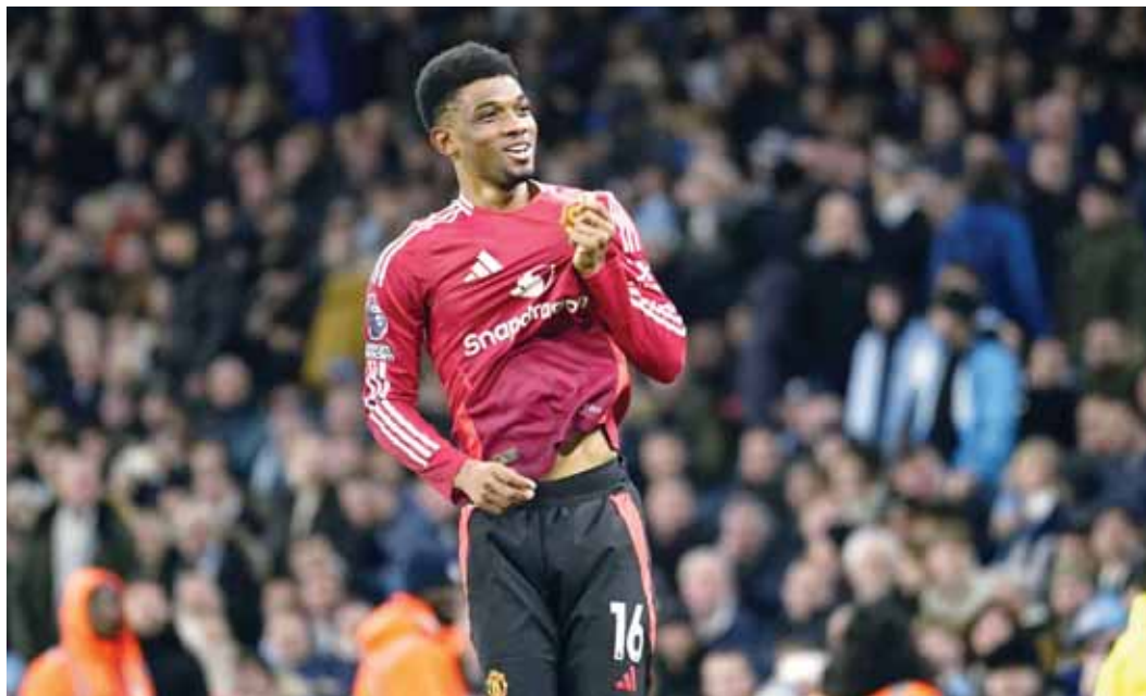
United is 13th and five points behind fifth-place City, which has seen its title defense unravel during its losing run.

simple as that,” Guardiola said. It was a first derby victory for new United head coach Ruben Amorim, who led Sporting Lisbon to a 4-1 win against City in one of his last games in charge of the Portuguese club in November. But for a long time it looked like being a third-straight league loss for United after Josko Gvardiol’s headed goal in the 36th. Fernandes was guilty of missing the target when through on goal in the second half and United struggled to create chances against a City team that rarely looked like adding to its lead. But in a dramatic end to the match, Diallo raced after an underhit backpass from Matheus Nunes. Nunes then brought down the United forward in the box and referee Anthony Taylor pointed to the penalty spot. Fernandes made no mistake this time — sending Ederson the wrong way. Moments later, Diallo ran onto a long pass from Lisandro Martinez, flicked the ball high and past Ederson before rolling it