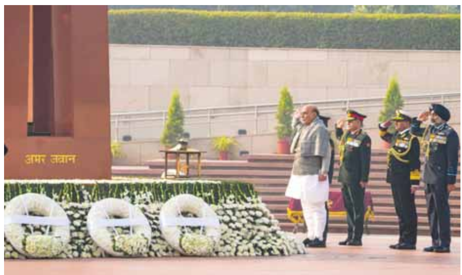
Union Defence Minister Rajnath Singh pays homage at the National War Memorial on the occasion of Vijay Diwas, marking India's victory in the 1971 Bangladesh liberation war. Chief of Defence Staff (CDS) Gen Anil Chauhan, Chief of Army Staff Gen. Manoj Pande, Navy Chief Admiral Dinesh K Tripathi and IAF Chief Air Chief Marshal AP Singh are also seen