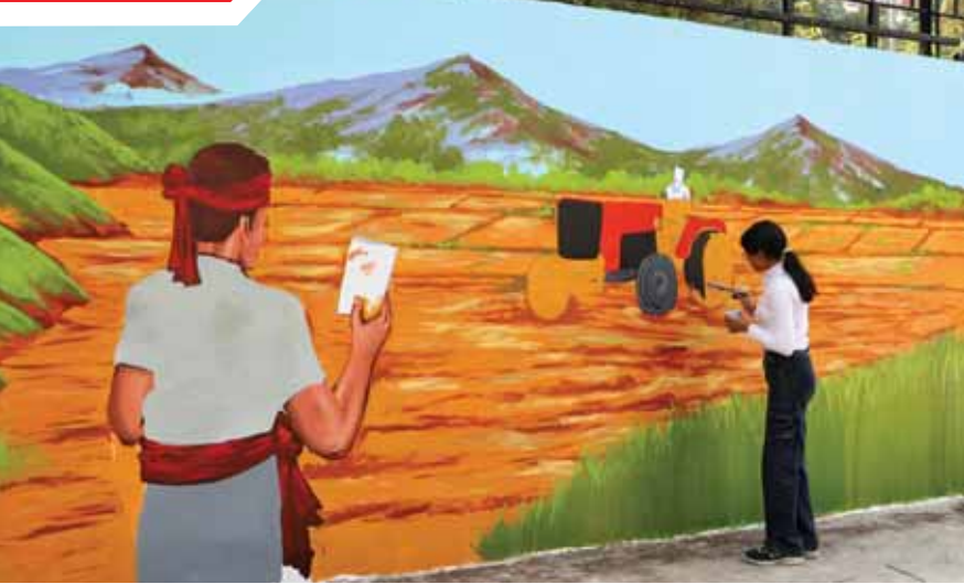
An artist paints a wall at Lodhi Road area, in New Delhi