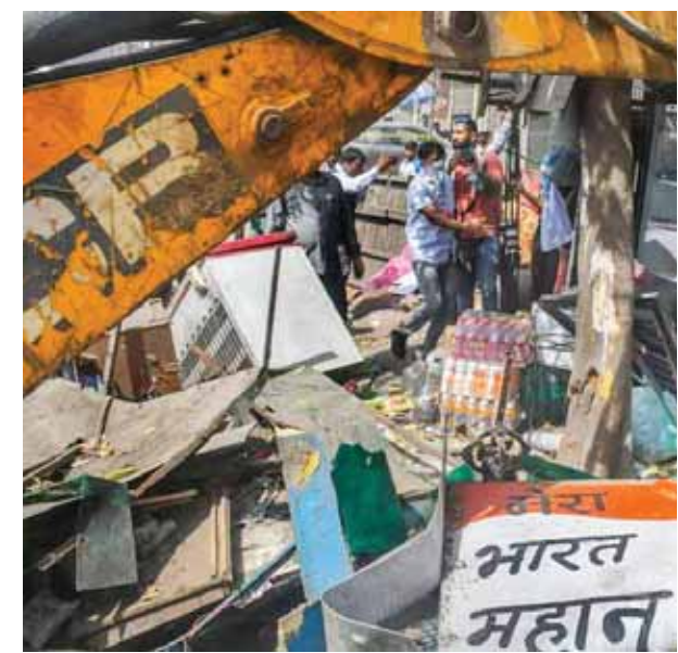
A bulldozer being used to demolish unauthorised structures in Jahangirpuri earlier this year.

of NCT of Delhi." Dealing with every report on a separate file, the LG has uniformly noted that, "The CAG reports are vital to assess the financial and administrative health of Government in a democratic set up. These Reports are the touchstone of transparency in governance. Adherence to the constitutional mandate of placing such reports on the Table of the Legislature from time to time expeditiously is an essential ingredient of a functional democracy to ensure full disclosure and to seek guidance of the Apex Legislative Body for taking course corrections where necessary."