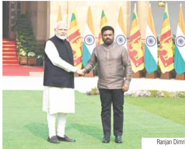
Rameshwaram and Talaimanar to boost connectivity between the two nations.

India and Sri Lanka on Monday here adopted a futuristic vision to expand their partnership, resolved to soon conclude a defence cooperation pact and decided to ramp up energy ties by establishing electricity grid connectivity and multi-product petroleum pipelines. The decisions were taken during wide-ranging talks between Prime Minister Narendra Modi and Sri Lankan President Anura Kumara Dissanayaka. Modi said both sides decided to emphasise investment-led growth and connectivity for the India-Sri Lanka economic partnership, and it was decided that physical, digital and energy connectivity will be key pillars of the cooperation. Work will be done to establish electricity grid connectivity and multi-product petroleum pipelines, Modi said, adding India will supply liquefied natural gas to the island nation's power plants. The prime minister also announced that a ferry service will be started between