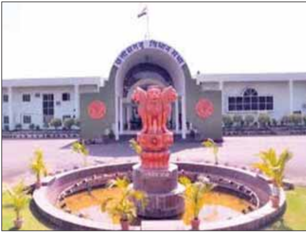
Congress members on Monday created ruckus in the Chhattisgarh Assembly over underweight gunny bags supplied to farmers and, dissatisfied with the Minister's answer, staged a walkout.

The Minister also ruled out setting up an enquiry into the matter.