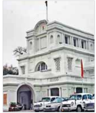
A photograph of a large, ornate building, likely a government or institutional structure in Delhi.