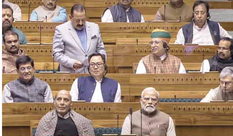
Prime Minister Narendra Modi with Defence Minister Rajnath Singh and others in the Lok Sabha during the Winter session of Parliament, in New Delhi

Parliament continued to be a battle-field virtually for the political parties on eleventh consecutive day on Wednesday as both ruling and Opposition benches trade charges against each other blaming neither of them are allowing smooth functioning of the Winter Session. With a brief functioning of the Lok Sabha which passed a bill to amend Railway Laws, Bharatiya Janata Party (BJP) led National Democratic Alliance (NDA) parties of the Treasury bench were at par with the Congress led Opposition INDIA Bloc in sloganeering in and out of the Lok Sabha and Rajya Sabha causing disruptions in both the Houses which ultimately led to adjournment of the day. Congress-led INDIA Bloc and BJP soon after the adjournments held Presser to flag concerns over non functioning of the Winter Session. Parliament proceedings were washed out in the first week of the winter session starting November 25 due to protests by Opposition members demanding discussion on issues like the indictment of industrialist Gautam Adani in a United States court and Sambhal violence and since last week, the ruling BJP MPs have been raising the issue of alleged nexus between Soros and the Congress posing a threat to national security. While several Opposition members alleged Rajya Sabha Chairman Jagdeep Dhankhar's "partisan" conduct which prompted them to move a