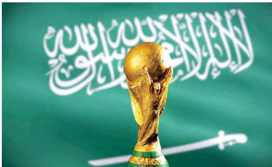
The kingdom plans to spend tens of billion of dollars on projects related to the World Cup as part of the crown prince's sweeping Vision 2030 project that aims to modernize Saudi society and economy. At its core is spending on sports by the $900 billion sovereign wealth operation, the Public Investment Fund, which he oversees. Critics have called it "sportswashing" of the kingdom's

tournament hosts by applause from more than 200 FIFA member federations in an online meeting hosted from Zurich by Infantino. It will kick off a decade of scrutiny on Saudi labor laws and treatment of workers mostly from South Asia needed to help build and upgrade 15 stadiums, plus hotels and transport networks ahead of the 104-game tournament. One of the stadiums is planned to be 350 meters (yards) above the ground in Neom — a futuristic city that does not yet exist — and another named for the crown prince is designed to be atop a 200-meter cliff near Riyadh. During the bid campaign, FIFA has accepted limited scrutiny of Saudi Arabia's human rights record that was widely criticized this year at the United Nations. Saudi and international rights groups and activists warned FIFA it has not learned the lessons of Qatar's much-criticized preparations to host the 2022 World Cup.