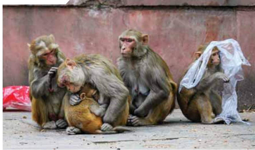
Monkeys huddle together on a chilly day, in New Delhi