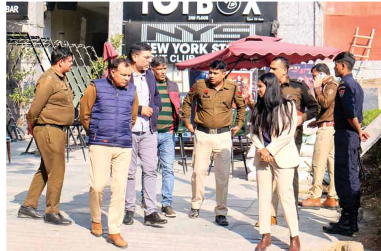
Police personnel investigate at the spot after a low-intensity explosion occurred outside a night club, in Gurugram.