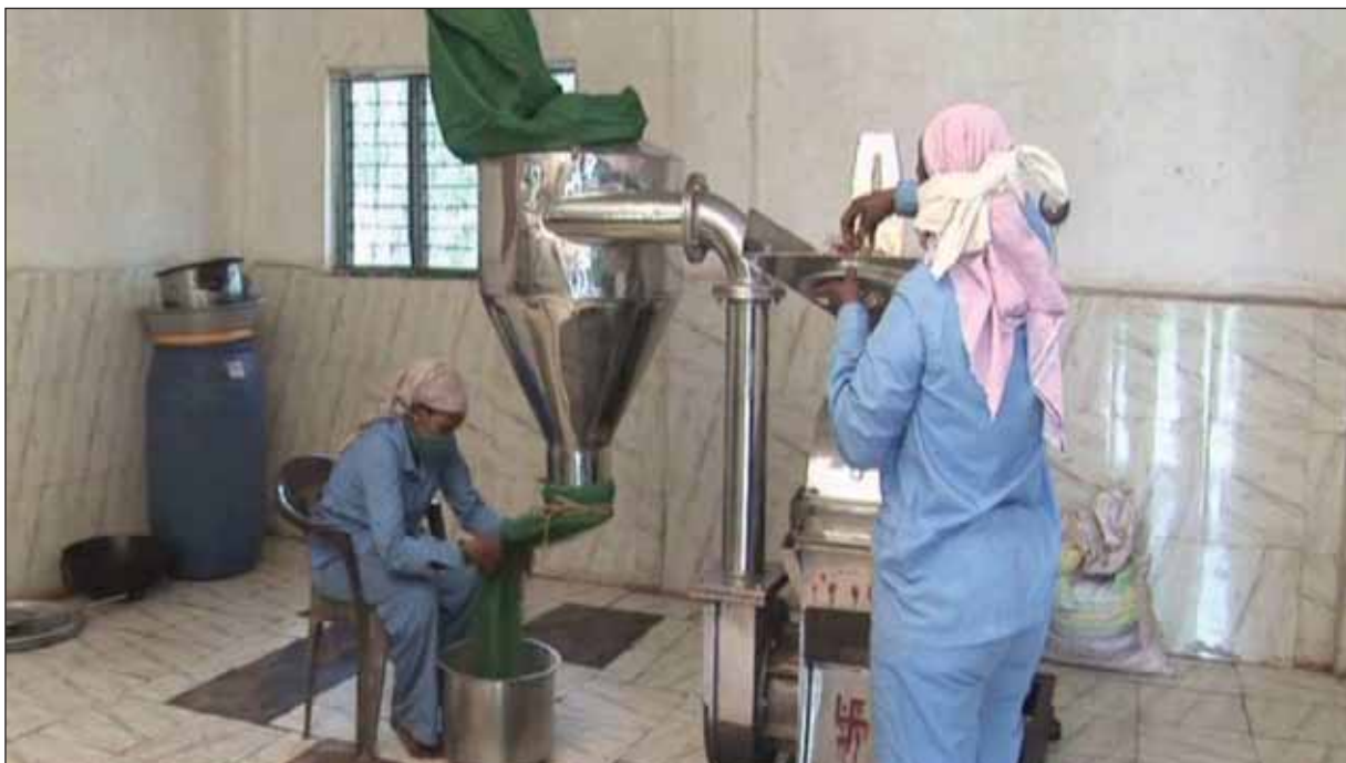
Women from Particularly Vulnerable Tribal Groups in Chhattisgarh's Gariaband are progressing towards financial prosperity by producing herbal products through traditional knowledge and modern technology under the PM JANMAN scheme.

They have urged the government and PNB management to pay immediate attention to their demands.