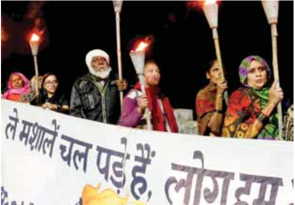
Survivors of the 1984 Bhopal gas tragedy take out a torch rally to mark the 40th anniversary of the disaster.