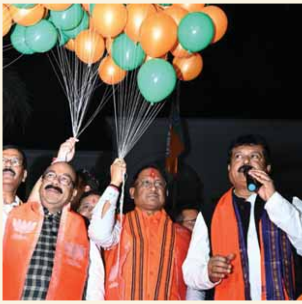
Sai said that more than 70 lakh women benefited under the Mahtari Vandan Scheme, under which married women aged 21 and above will get a monthly assistance of Rs 1,000 in their bank accounts. "In our one year tenure, we have tried to fulfill Modi's guarantee as much as possible and will continue to fulfil the promises made," Sai said.

The first cabinet meeting of our BJP government in Chhattisgarh okayed the construction of 18 lakh PM Awas for the homeless, he said in the post.