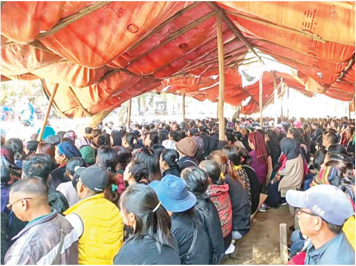
Members of the United Zou Organization (UZO) stage demonstration against the decision to scrap the Free Movement Regime and fence the India-Myanmar border.

Chandigarh has become the country's first administrative unit where 100 per cent implementation of the three criminal laws has been done with Prime Minister Narendra Modi on Tuesday saying these new legislations are becoming protector of citizen's rights and the basis of ease of justice. The laws -- Bharatiya Nyaya Sanhita, Bharatiya Nagrik Suraksha Sanhita and Bharatiya Sakshya Adhiniyam - came into effect on July 1, replacing the British-era Indian Penal Code, Code of Criminal Procedure and the Indian Evidence Act, respectively. Chandigarh has become the country's first administrative unit where 100 per cent implementation of the three laws has been done. Speaking on the occasion, the prime minister said the new criminal laws represent a concrete step towards realising the ideals enshrined in the Constitution for the benefit of all citizens. He said the new laws came into effect at a time when country is moving ahead with the pledge of "Viksit Bharat" and 75 years of adoption of Constitution have been completed, thus the launch of the Bharatiya Nyaya Sanhita, rooted in constitutional values, is a significant occasion.