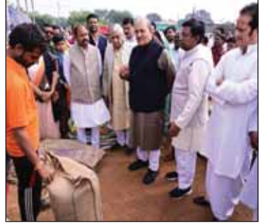
there was a complete 'mess' there.

The leaders alleged that the farmers were facing many problems in the procurement centres and that