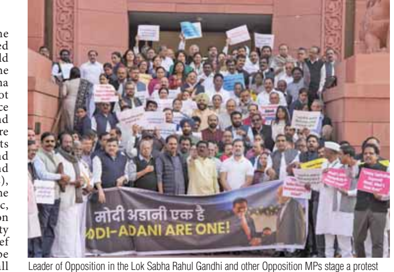
Leader of Opposition in the Lok Sabha Rahul Gandhi and other Opposition MPs stage a protest during the Winter session of Parliament