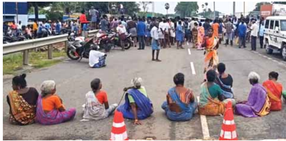
Residents affected by cyclone Fengal in Villupuram block Chennai-Tiruchirappalli National Highway demanding relief from the government.