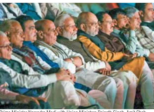
Prime Minister Narendra Modi with Union Ministers Rajnath Singh, Amit Shah, Nitin Gadkari, JP Nadda, and others during the screening of the film 'The Sabarmati Report', at the Parliament in New Delhi