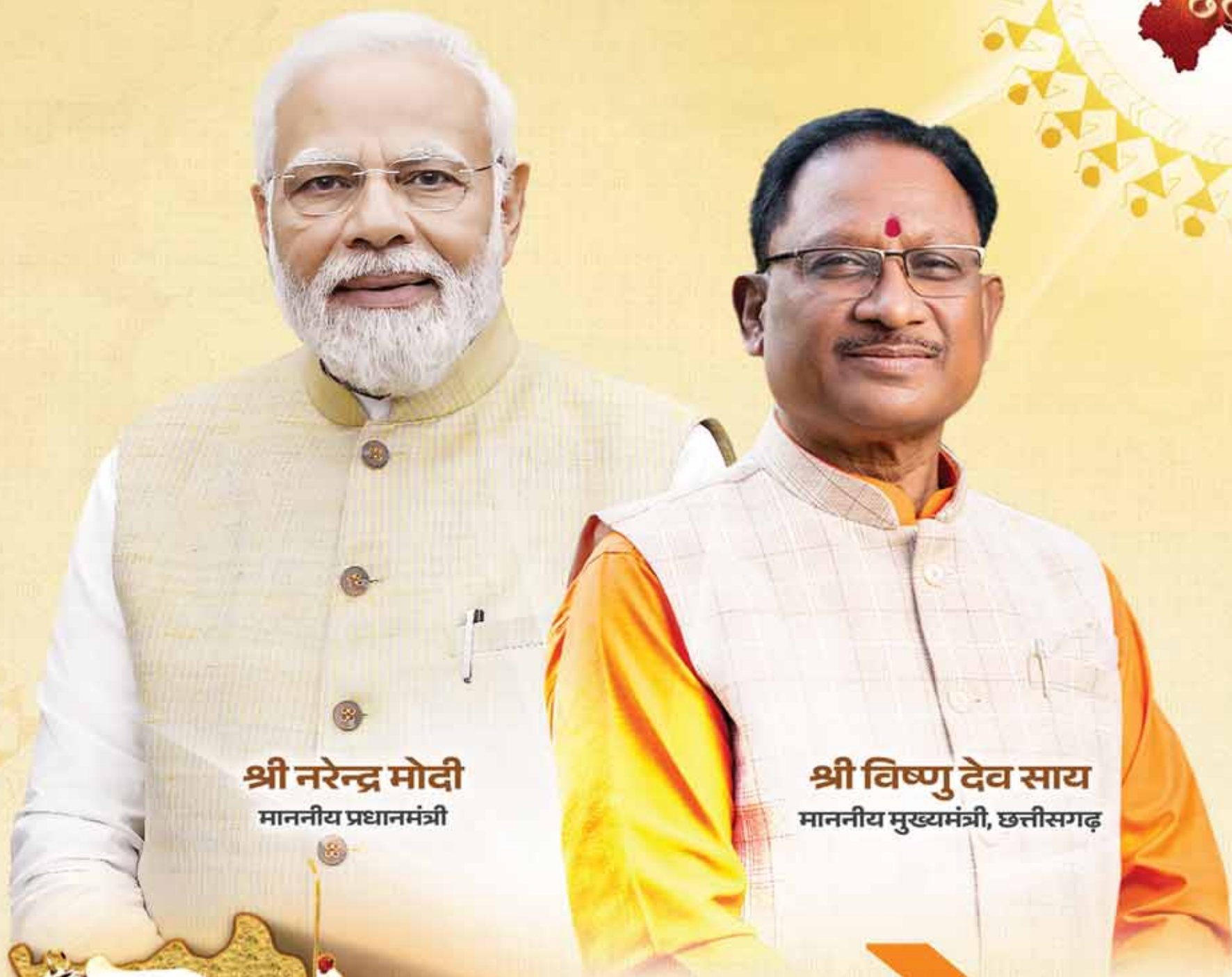
श्री नरेन्द्र मोदी माननीय प्रधानमंत्री