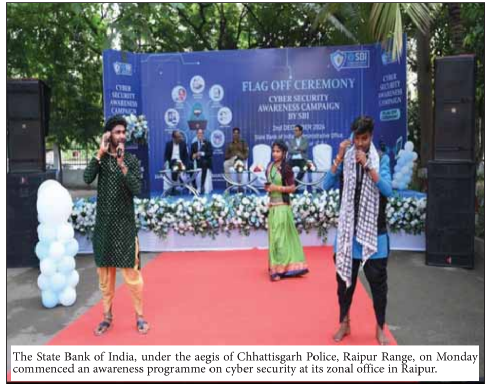
The State Bank of India, under the aegis of Chhattisgarh Police, Raipur Range, on Monday commenced an awareness programme on cyber security at its zonal office in Raipur.

foundation for economic resilience and individual empowerment, inspiring collaborative efforts toward a safer, healthier and more productive workforce in the country.