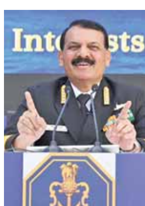
Chief of the Naval Staff Admiral Dinesh K. Tripathi addresses a press conference, ahead of Navy Day

Navy Chief Admiral Dinesh K Tripathi on Monday said here Indian Navy is aware of "surprising growth" of the Pakistan Navy, that aims to become a 50-ship Navy in the next decade with the help of China. He also said Pakistan has chosen weapons over the welfare of its people. Making this assertion here, the Naval Chief said given the state of its economy, Pakistan is strengthening its Navy. "They have chosen weapons over the welfare of their people," he said and quipped "good luck to them." "We are aware of the surprising growth of the Pakistan Navy which aims to become a 50-ship Navy," he said. On China helping Pakistan boost its maritime prowess, the Navy Chief said it showed Beijing's interest in making that country militarily stronger. "Many Pakistan Navy warships and submarines are being built with Chinese support showing that China is interested in making Pakistan's Navy stronger," he said. "Their eight new submarines will have significant combat potential for the Pakistan Navy but we