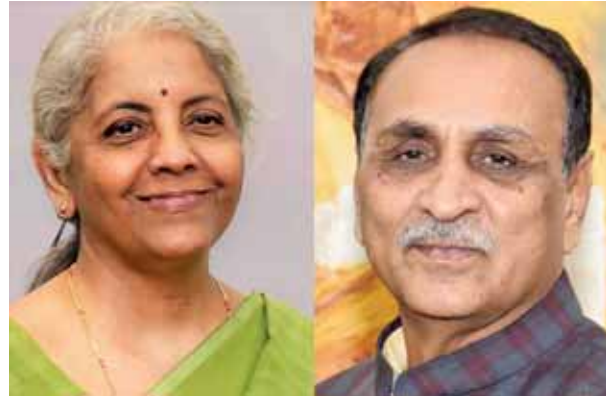
The BJP's Parliamentary Board is sending former Gujarat CM Vijay Rupani and Finance and Corporate Affairs Minister Nirmala Sitharaman as central observers

After days of uncertainty, in the wake of it leading the MahaYuti to a spectacular victory in the Maharashtra Assembly polls, the ruling Bharatiya Janata Party (BJP) finally began to get its act together on Monday as it called its legislature party meeting on December 4 to elect its leader - ahead of the swearing-in ceremony scheduled to be held on the following day. Though the BJP has not yet formally announced its Chief Ministerial choice, party sources said that the party's central leadership has put a stamp of approval on the name of its senior leader and former CM Devendra Fadnavis for the top post in the state. At a meeting to be held at 10 am on December 4 in the Central Hall of the Maharashtra Vidhan Bhavan, Fadnavis will in all likelihood be elected as the BJP's Legislature Party (BJPLP) leader, paving the way for his being sworn in as the next CM of Maharashtra on December 5. The BJP's Parliamentary Board is sending former Gujarat CM and the party's in-charge for Punjab Vijay Rupani and Finance and Corporate Affairs Minister Nirmala Sitharaman as the central observers for the BJPLP meeting. After the BJPLP meeting, the leaders of the ruling MahaYuti, comprising the BJP, Shiv Sena (Eknath Shinde) and NCP (Ajit Pawar), will call Maharashtra Governor CP Radhakrishnan, and formally stake claim to form a new government in the state. While confirming that the