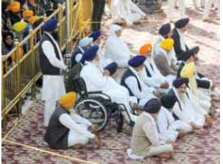
Sukhbir Singh Badal and other leaders of the previous SAD government during the hearing of 'tankhaiya' (guilty of religious misconduct) case by the Akal Takht