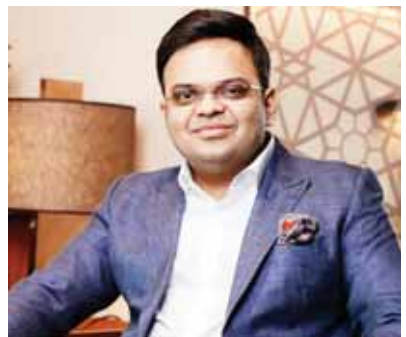
As of now, the Pakistan Cricket Board (PCB) has decided to accept the 'Hybrid Model' under which India play their matches in Dubai. But the PCB also wants the same courtesy to be accorded to Pakistan in all four ICC tournaments till 2031, which will be co-hosted or singularly hosted by the Indian cricket board. Now, as the head of the global body and with less than 100 days left for the tournament to begin, Shah will have to coordinate with both the PCB and his former colleagues at the BCCI for an "acceptable solution" in order to organise a hassle-free tournament.

PTI ■ DUBAI Indian cricket administrator Jay Shah on Sunday took charge as the chairman of the International Cricket Council (ICC) with an immediate goal of ending the impasse surrounding the Champions Trophy and a broader vision of making cricket a commercially viable Olympic sport. The 36-year-old Shah, who headlined the BCCI as its secretary for the last five years, is the fifth Indian and the youngest ever to head the global cricket body. He was the unanimous choice of the ICC's Board of Directors and replaced New Zealand attorney Greg Barclay, who didn't wish to continue for a third consecutive term. Before Shah, businessman late Jagmohan Dalmiya, politician Sharad Pawar, lawyer Shashank Manohar and industrialist N Srinivasan have all headed the world cricket body. Shah, the son of India's Home Minister Amit Shah, will have his task cut out as the ICC looks to find an acceptable solution to implement the 'Hybrid Model' for the Champions Trophy originally scheduled in Pakistan.