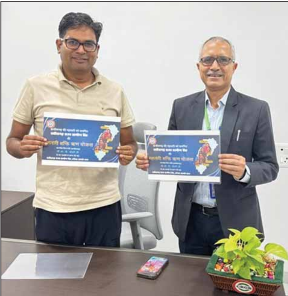
Chhattisgarh Finance Minister O.P. Choudhary on Sunday launched the 'Mahatari Shakti Loan Scheme' of the State Rural Bank to provide loans of up to Rs 25,000 to women without formalities.

smooth travel. As per the population, 100 e-buses will be for Raipur, 50 for the twin city of Bhilai-Durg, 50 for Bilaspur and 40 buses for Korba.