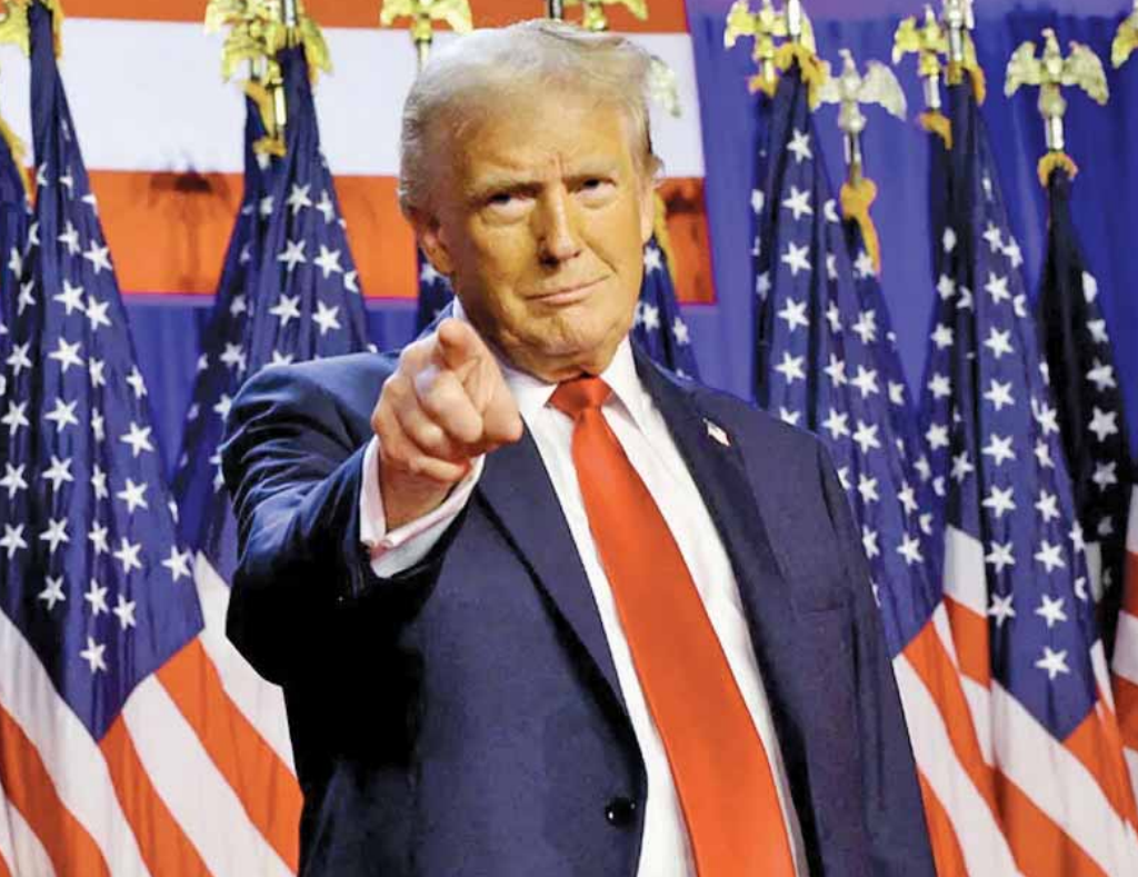
AP ■ WEST PALM BEACH (FL)

President-elect Donald Trump on Saturday threatened 100 per cent tariffs against a bloc of nine nations if they act to undermine the United States' dollar. His threat was directed at countries in the so-called BRIC alliance, which consists of Brazil, Russia, India, China, South Africa, Egypt, Ethiopia, Iran, and the United Arab Emirates. Turkey, Azerbaijan and Malaysia have applied to become members and several other countries have expressed interest in joining.