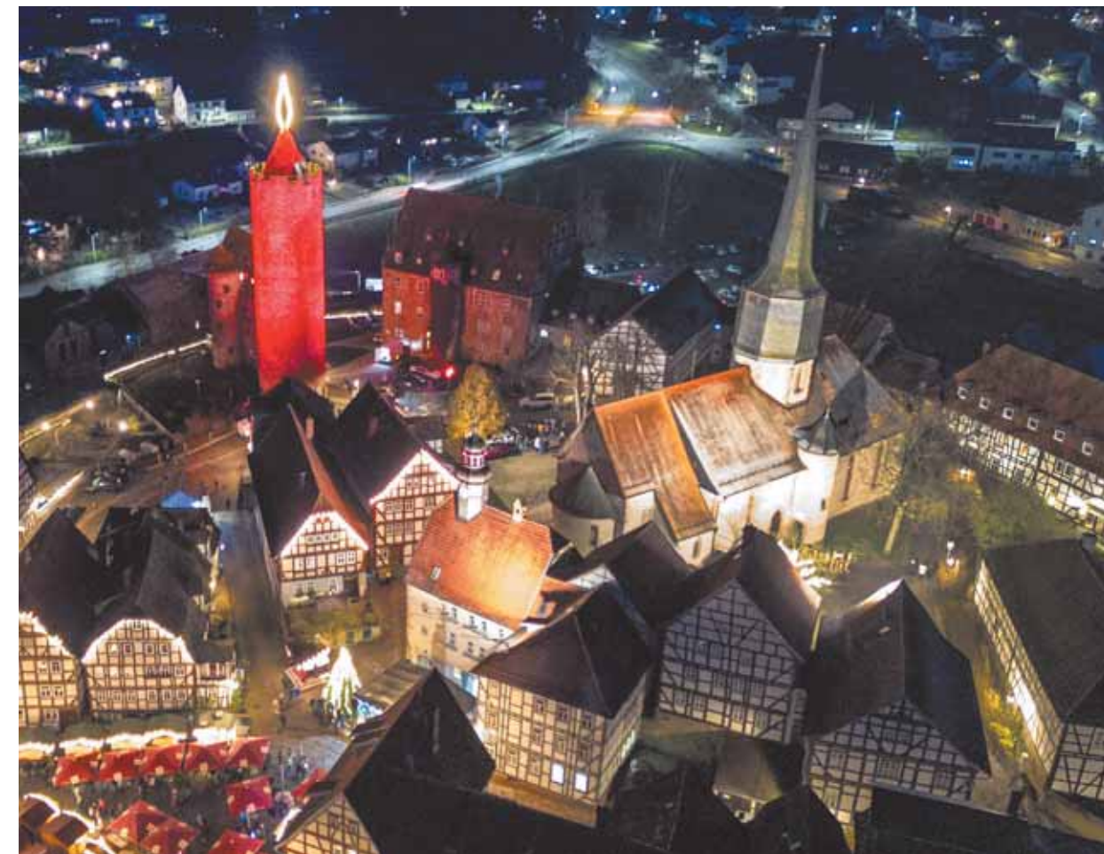
A 42-meter-high candle which is an illuminated medieval tower shines in the historic city centre of Schlitz, Germany.

candidates in order of preference. As a result, it can take days for full results to be known. "The people of Ireland have now spoken," Harris said. "We now have to work out exactly what they have said, and that is going to take a little bit of time." Partial results from Friday's election showed electors spreading their votes widely among the big three, several smaller parties and an assortment of independent candidates, and any coalition will likely involve smaller parties or independents. The cost of living — especially Ireland's acute housing crisis — was a dominant topic in the three-week campaign, alongside immigration, which has become an emotive and challenging issue in a country of 5.4 million people long defined by emigration. If early results are borne out, Ireland may buck the global trend of incumbents being ousted by disgruntled voters after years of pandemic, international instability and cost-of-living pressures. The outgoing government was led by the two parties that have dominated Irish politics for the past century. Fine Gael and Fianna Fail have similar policies, but are longtime rivals with origins on opposing sides of Ireland's 1920s civil war. After the 2020 election ended in a virtual dead heat, they formed a coalition.