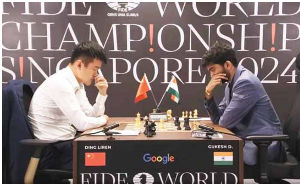
Knights and Bishops had changed hands, leading to a Queen and Rook endgame with equal pawns. Liren explained the reason behind his choice of opening. "In the last world championship match (against Russian Ian Nepomniachtchi), I had played the same opening and won a nice game, I wanted to repeat the opening," he said. Gukesh used up a little over 50 minutes in the first part of the game, giving Liren a 45-minute lead on the clock for the first time in the match. However, on the 20th move, Gukesh chose a dynamic continuation that required deep calculation as well as superior judgement. Liren thought for a long time, spending all his extra time, and