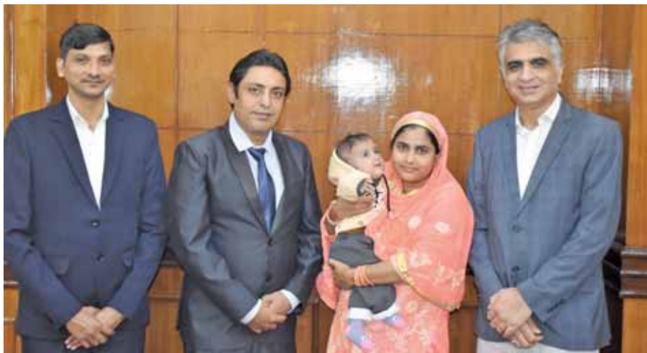
Sarvodaya Hospital, Faridabad achieved medical breakthrough by treating a 5-month-old baby for congenital hearing impairment making him the youngest in India to undergo a cochlear implant surgery.

The 17th edition of CPHI & PMEC India, organised by Informa Markets in India took place at the India Expo Centre, Greater Noida, Delhi-NCR. Over 50,000 global industry professionals, including key decision-makers, gathered to explore new partnerships and growth opportunities. The expo featured forward-thinking discussions on sustainability, digital transformation, and the future of pharma, with a special focus on empowering women in the industry.