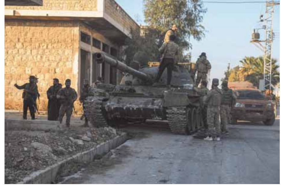
Syria. Thousands of Syrian insurgents have fanned out inside Syria's largest city Aleppo a day after storming it with little resistance from government troops.