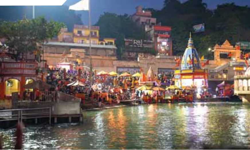
Devotees attend 'Ganga Aarti' at Har Ki Pauri, in Haridwar