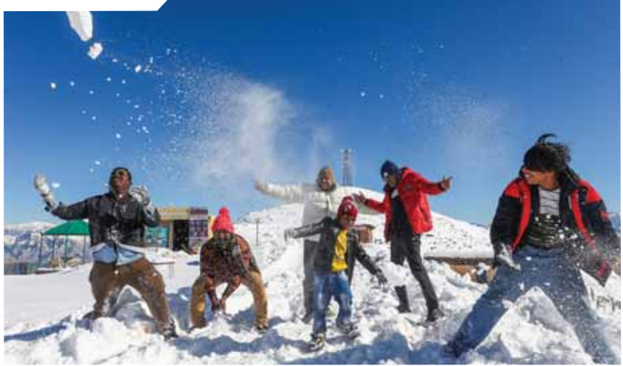
Tourists enjoy after fresh snowfall, at Patnitop hill station in Udhampur