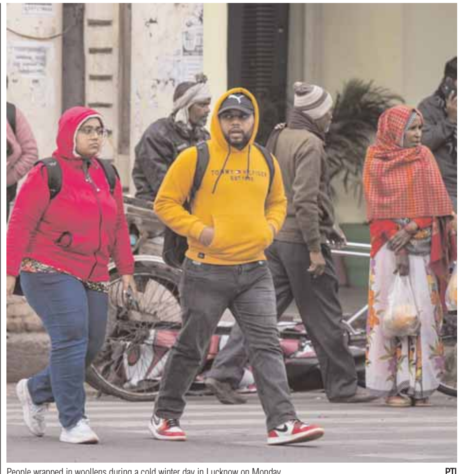
People wrapped in woollens during a cold winter day in Lucknow on Monday