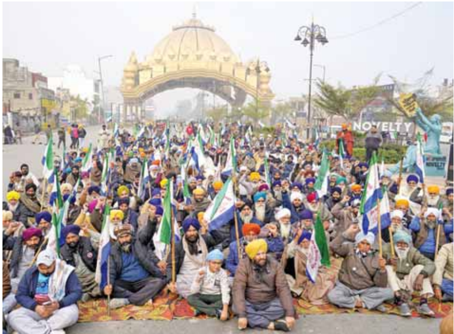
Farmers block a road during the statewide 'bandh' called as part of their ongoing protest at Punjab borders, in Amritsar.