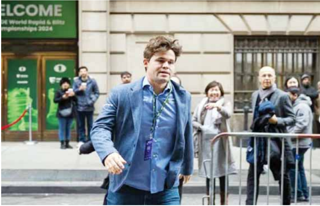
year-old Norwegian grandmaster said. But he added that he loves playing blitz — a fast-paced form of chess — and wanted fans to be able

Carlsen, meanwhile, said in a video posted Sunday on social media that he would play — and wear jeans — in the World Blitz Championship when it begins Monday. "I think the situation was badly mishandled on their side," the 34-