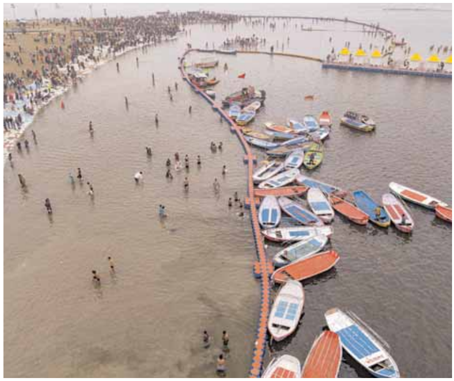
Devotees gather to take a holy dip in the River Ganga ahead of Maha Kumbh, at Sangam in Prayagraj on Monday

500 metres. Mela Adhikari (fair-in-charge) Vijay Kiran Anand said, "Between 2019 and 2024, Ganga has moved significantly, decreasing the available land for the Kumbh." With just a fortnight remaining until Makar Sankranti — when the first auspicious dip, or 'Rajasi Snaan', will take place — the pace of work has intensified. Driving into the Sangam area, one is immediately greeted by groups of workers constructing barricades, shelters, and temporary restrooms, while artists paint vibrant murals and messages of welcome on the walls. The event is not just another religious festival; for the Uttar Pradesh government, it is a matter of prestige. The preparations are receiving the same level of attention as the Ram Temple consecration in Ayodhya earlier this year. The government is also aiming higher this time around. In 2019, around 24 crore people attended the Kumbh, but this year, Chief Minister Yogi Adityanath has stated that over 40 crore pilgrims are expected to attend the Maha Kumbh. To accommodate this unprecedented influx, the 4,000-hectare Kumbh ground has been divided into 25 sectors on both sides of the river.