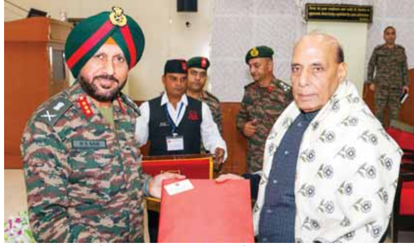
Defence Minister Rajnath Singh during his visit at the Army War College, at Mhow, in Indore district of Madhya Pradesh.

officers to explore the possibility of promoting integration through training in areas such as weapons training in Infantry School; AI and communication technology in Military College of Telecommunication Engineering (MCTE), and leadership - junior and senior command in AWC. Rajnath Singh said some officers will work as defence attaches in the future, and they should strive to secure national interests at the global level. "When you take up this post of defence attaché, you should imbibe the government's vision of 'aatmanirbhar Bharat'. Only through self-reliance can India strengthen its defence capabilities and gain more respect on the world stage," he added. The defence minister is on a two-day visit to Madhya Pradesh since Sunday. He said the government is committed to making India one of the strongest economic and military powers in the world. "Economic prosperity is possible only when full attention is paid to security. Similarly, the security system will be robust only when the economy is strong. Both complement each other," he added.