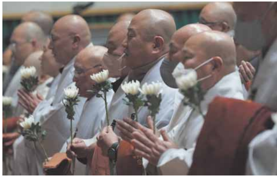
Buddhists monks (above) pray for the victims on a plane which skidded off a runway and burst into flames (left), at a memorial altar at Muan sport park in Muan, South Korea, on Monday.