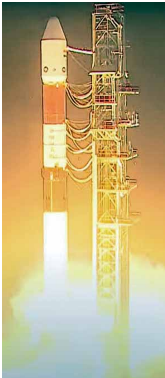
ISRO's PSLV-C60 carrying SpaDeX and its payloads, lifts off from the first launch pad at Satish Dhawan Space Centre, in Sriharikota.