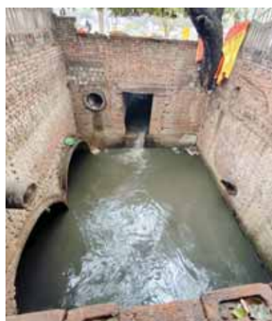
A dug up drain and an open drain near the Saket metro station