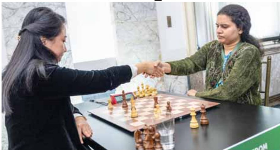
India's Koneru Humpy (R) during a match at the FIDE World Rapid Chess Championship, in New York

"I'm very excited and I feel very happy. In fact, I expected it to be a very tough day, like some sort of tie-break. But when I finished the game, I only got to know when the arbitrator told me, and it was a tense moment for me," said Humpy, who began with