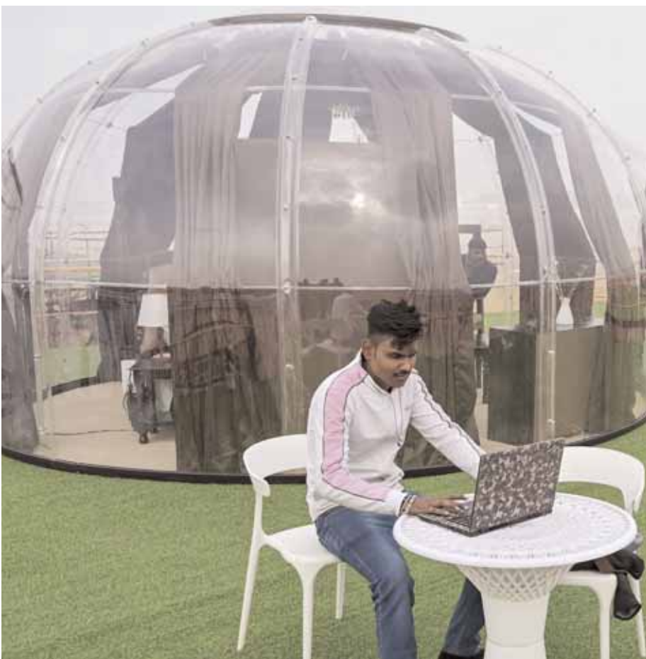
A view of a luxury cottage at the 'Dome' city for pilgrims ahead of Mahakumbh at Sangam, in Prayagraj on Sunday