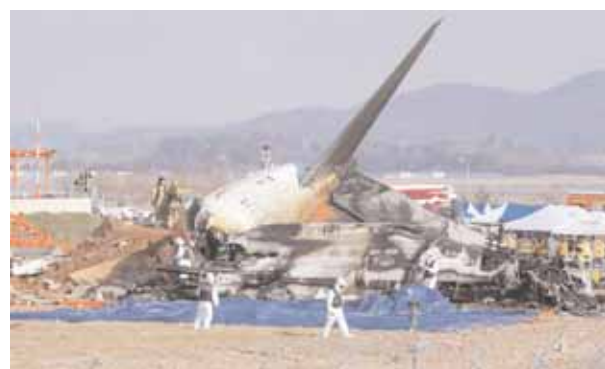
Firefighters and rescue team members work near the wreckage of a passenger plane at Muan International Airport in Muan, South Korea

Humpy's achievement capped a sensational year for Indian chess after D Gukesh defeated China's Ding Liren to emerge