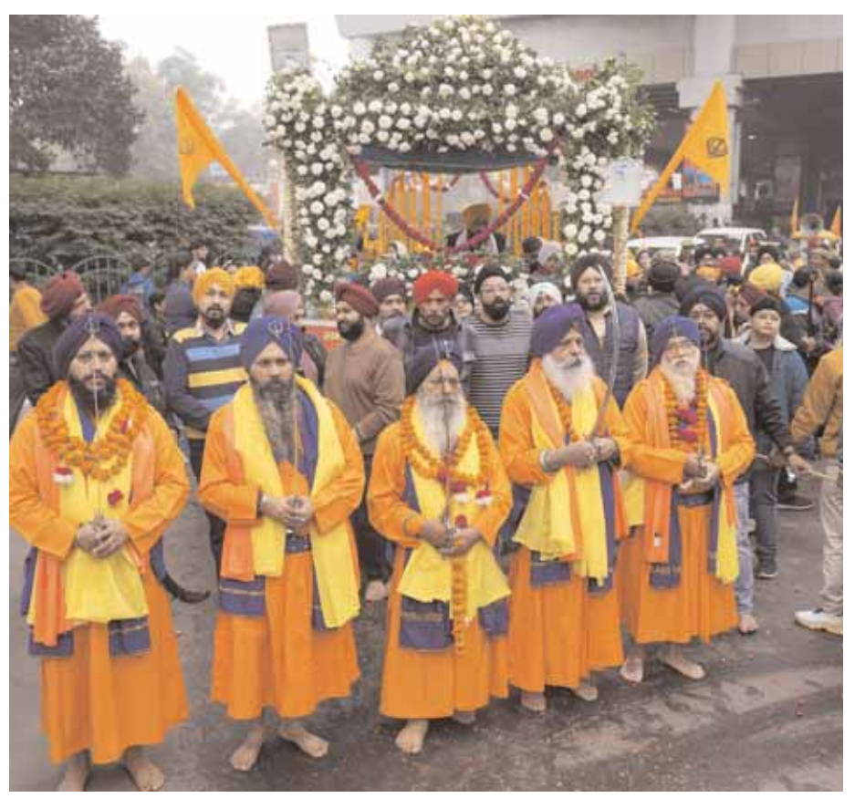
Devotees during 'Nagar Keertan' as part of 'Prakash Parv' of Guru Govind Singh in Lucknow on Sunday