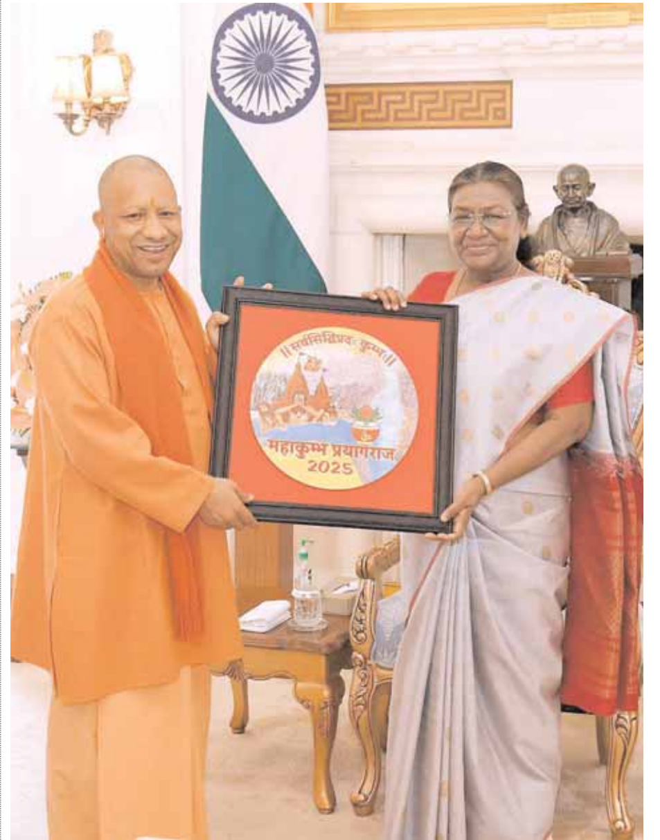
Uttar Pradesh Chief Minister Yogi Adityanath on Sunday met President Droupadi Murmu at the Rashtrapati Bhavan and invited her to attend the upcoming Maha Kumbh. Held every 12 years, the Maha Kumbh will be organised in Prayagraj in Uttar Pradesh from January 13 to February 26. "Uttar Pradesh Chief Minister Yogi Adityanath Ji met President Smt Droupadi Murmu at Rashtrapati Bhavan and invited her to attend the upcoming Maha Kumbh 2025," the president's office said in a post on X in Hindi, sharing a photograph of the meeting.