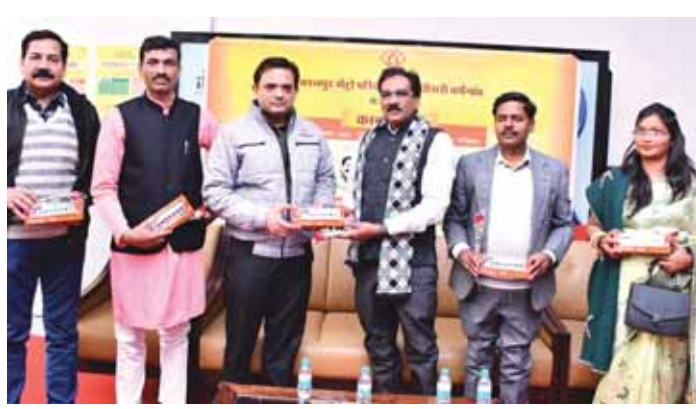
Poets being felicitated on the third anniversary of Kanpur Metro.