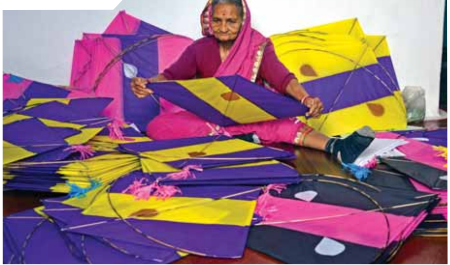
An elderly woman makes kites for the upcoming Makar Sankranti kite festival, in Hyderabad