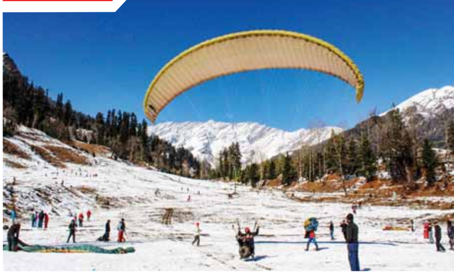
Tourists enjoy paragliding after fresh snowfall, in Solang valley in Manali