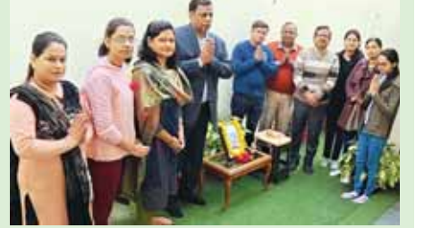
The members of 'Just for Environment' on Friday paying homage to former prime minister Dr Manmohan Singh