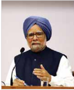
Dr Manmohan Singh