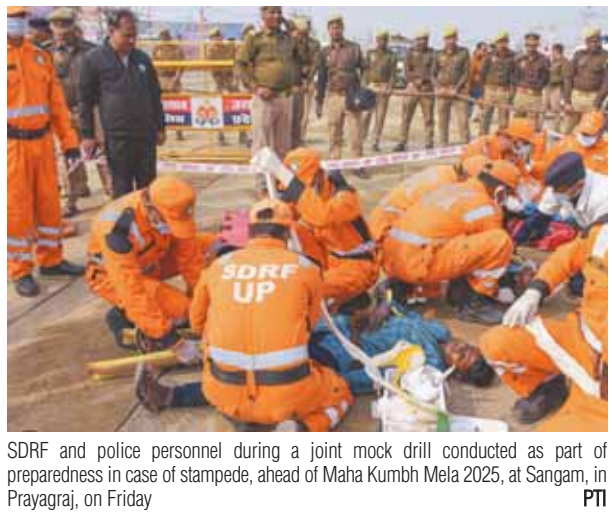
SDRF and police personnel during a joint mock drill conducted as part of preparedness in case of stampede, ahead of Maha Kumbh Mela 2025, at Sangam, in Prayagraj, on Friday