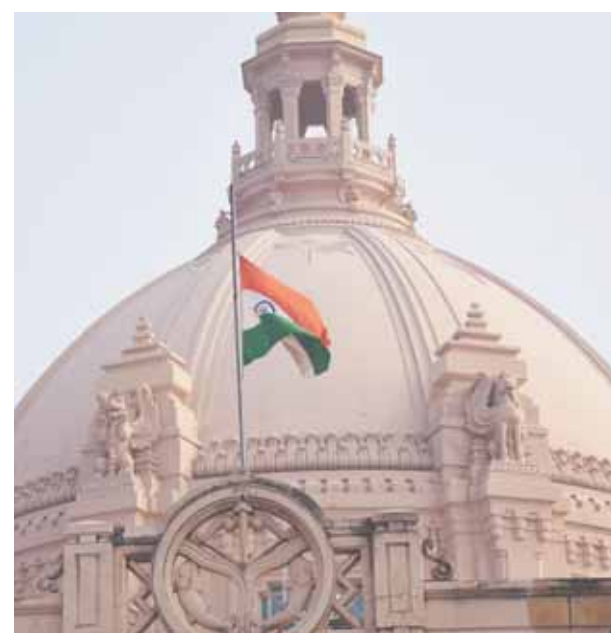
Indian flag flying at half-mast atop Vidhan Bhawan in Lucknow during the seven-day state mourning following the demise of former PM Manmohan Singh

Samajwadi Party president Akhilesh Yadav on Friday said former prime minister Dr Manmohan Singh will always be remembered as one of India's finest prime ministers, adding that he worked quietly yet profoundly for the country's progress. Speaking to reporters here, Samajwadi Party president Akhilesh Yadav said Singh's decisions both as finance minister and prime minister were instrumental in strengthening India's economy. "Many of the advancements we see today are because of the reforms he introduced. His bold moves in economic and market policies laid the foundation for India to stand as an equal on the global stage," Samajwadi Party president Akhilesh Yadav said. Singh, 92, passed away Thursday evening in Delhi. He served as India's prime minister from 2004 to 2014. Samajwadi Party president Akhilesh Yadav praised Singh's unique combination of knowledge and practicality, calling him both a brilliant economist and a thoughtful leader. "He was known for speaking less, but his decisions spoke volumes about his wisdom and foresight. His tenure was marked by transformative changes across sectors, and these changes resonate even today," Samajwadi Party president Akhilesh Yadav