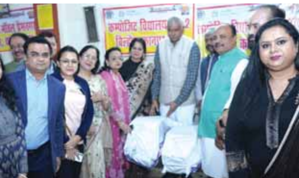
PIONEER NEWS SERVICE ■ KANPUR

he Rotary Club of New I Kanpur (RCNK) under the aegis and help of Rotary International distributed books to 19 primary schools in Kanpur city and villages to upgrade their libraries. The programme was held at Jaspat Rai Saraswati Shishu Vidya Mandir, Lajpatnagar, Kanpur. Rotary's primary objective is to simplify life and make it hurdle-free while imparting quality. To achieve this, Rotary focuses on education, health and providing facilities to the masses. One step towards this goal is setting up libraries. Books are a treasure trove of knowledge and stu-dents can access them for free. People can read books in the library that they cannot afford.