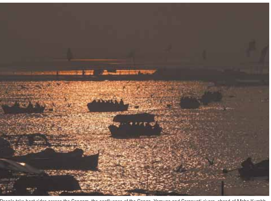
People take boat rides across the Sangam, the confluence of the Ganga, Yamuna and Saraswati rivers, ahead of Maha Kumbh Mela 2025, in Prayagraj on Sunday

These devices are expected to enhance the devotees' overall experience and ensure a healthy environment throughout the grand gathering, the officials said.