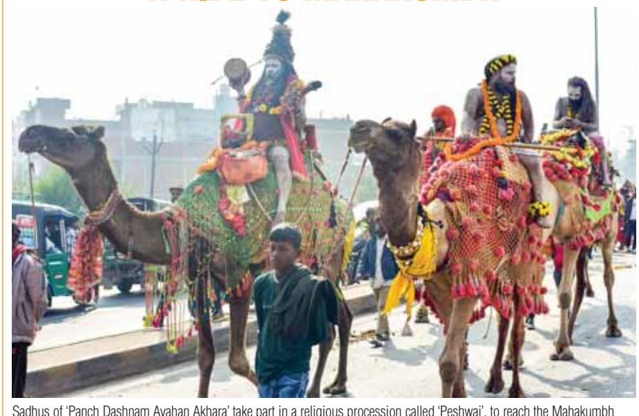
Sadhus of 'Panch Dashnam Avahan Akhara' take part in a religious procession called 'Peshwai', to reach the Mahakumbh ahead of Maha Kumbh Mela 2025, in Prayagraj