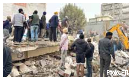
PTI ■ CHANDIGARH

Rescue operations were underway after a multistorey building collapsed in the Sohana village of Punjab's Mohali district on Saturday, officials said. Locals said some people were feared trapped under the debris. The district authorities launched a rescue operation. Two excavators were pressed into