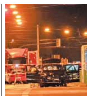
The car that was crashed into a crowd at the Magdeburg AP/PTI