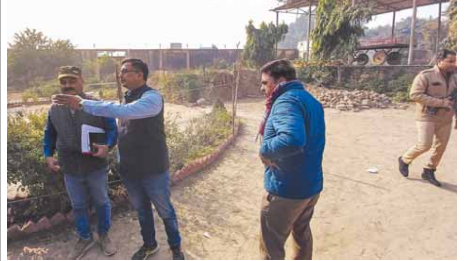
ASI team members at the ancient Kalki Vishnu temple for survey, in Sambhal on Saturday