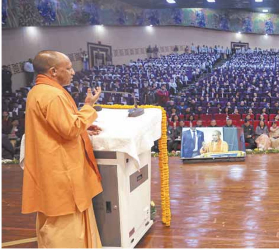
Uttar Pradesh Chief Minister Yogi Adityanath addresses the 120th Foundation Day programme of King George's Medical University in Lucknow on Saturday

Addressing the gathering, he highlighted the institution's progress, noting that KGMU started in 1905 with a contribution of Rs 10,75,800 and has since evolved into the largest medical institution in the country, spanning over 100 acres and introducing new services. Reflecting on KGMU's contribution during the COVID-19 pandemic, the CM highlighted how it worked swiftly and effectively, following the guidance of Prime Minister Narendra Modi and the state government, in contrast to another medical college where doctors were suspended after being found to be negative during quarantine. He also honoured 67 meritorious students, to whom he presented medals and certificates for their achievements. The chief minister said that the government has given every-