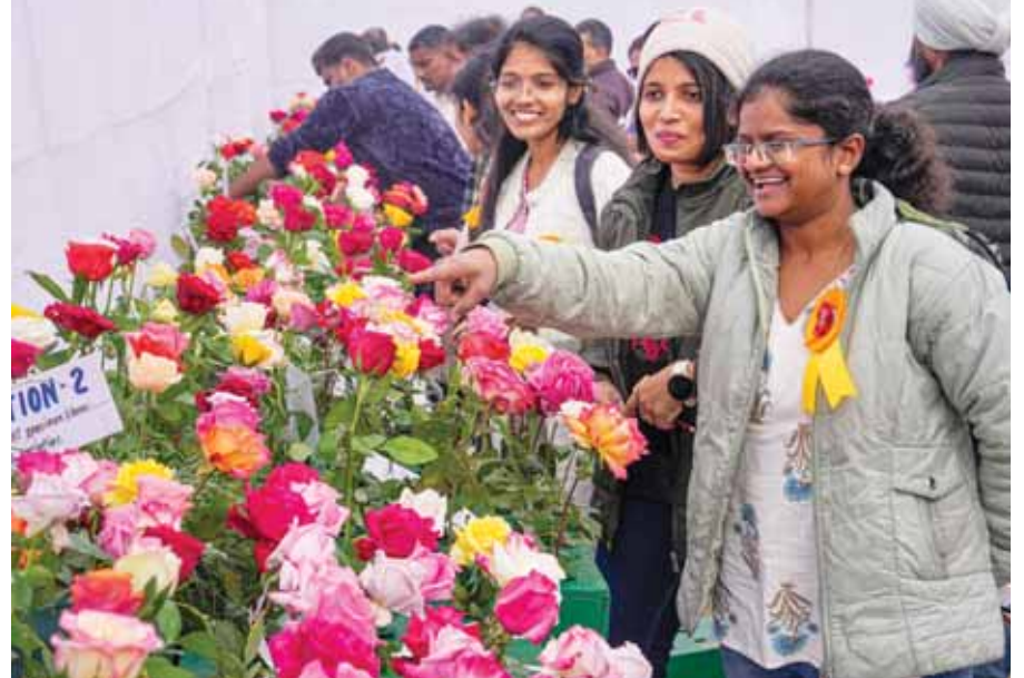
Visitors at the 'All India Winter Rose Show' organised by the New Delhi Municipal Council (NDMC) in association with The Rose Society of India, at India-Africa Friendship Rose Garden, Chanakyapuri