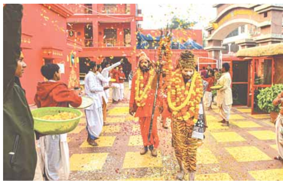
Sadhus of Shri Panchayathi Akhada Niranjani arrive at Prayagraj railway station ahead of the Maha Kumbh in Prayagraj on Saturday.

He appealed to the general public to avoid going into deep water and follow the guidelines issued by the local administration.