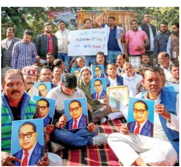
Congress SC ST cell workers stage a protest against Union Home Minister Amit Shah's remarks on BR Ambedkar in the Parliament in Bhonal

Addressing a Press conference, enshrined in the Constitution