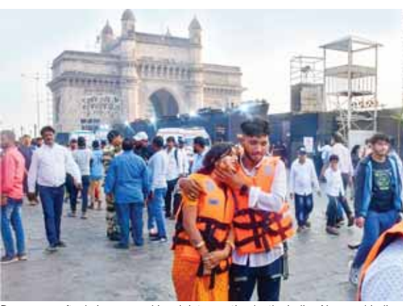
Passengers after being rescued in a joint operation by the Indian Navy and Indian

civil craft in the area -- have been transferred to jetties and hospitals in the vicinity," the Defence spokesperson said. Kamal" with many passengers on board was on its way from the Gateway of India to the Gharapuri Ísland, where there is UNESCO World Heritage Site of Elephanta Caves. The Indian Navy boat had six