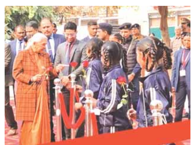
Governor Anandiben Patel talking to girls before inaugurating tne 'Sabal Kashi' programme at a Shivpur school in Varanasi on Wednesday.

Governor Anandiben Patel Gon Wednesday attended the Jeevan Raksha HPV Vaccine Abhiyan programme as the chief guest in a camp organised under the Cervical Cancer Awareness Programme at Kasturba Gandhi Residential Girls School (city area) located in Shivpur here. On the occasion, 100 girls were vaccinated for free against HPV. Under the campaign, 100 per cent vaccination of girls aged 9 to 14 years of all schools in the district will be done in the next 15 days. A total of 80,000 girls of the district will be vaccinated. The vaccination will be done twice at an interval of six months. The Governor also inaugurated the 'Sabal Kashi' programme by pressing the button. She expressed happiness while addressing the people and said that the government's focus is on the uplift of women as work is being done towards the health security of women. Referring to the work done in this field during the Gujarat government, she talked about the efforts made for the tion between son and daughter, treatment of congenital defor- only then will they earn you a