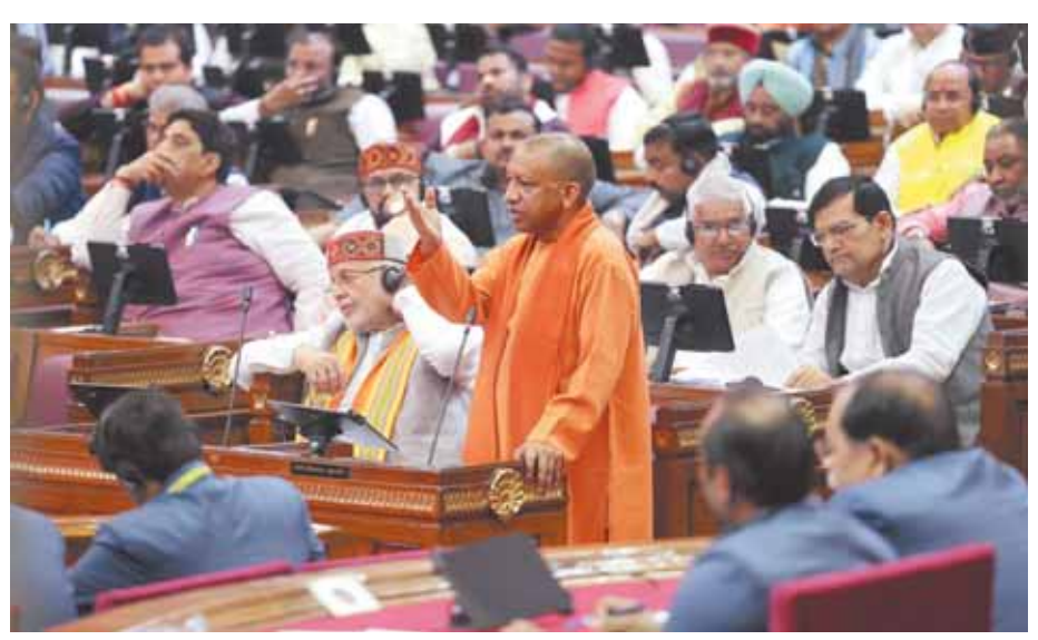
Uttar Pradesh Chief Minister Yogi Adityanath speaking in the state assembly on Tuesday

Addressing the challenge of unemployment faced by the country, the world, and Uttar Pradesh, the chief minister stated, "Uttar Pradesh is the youngest state globally. With a population of 25 crore, 56 to 60 per cent of the state's population comprises working-age youth. Our government has imple-