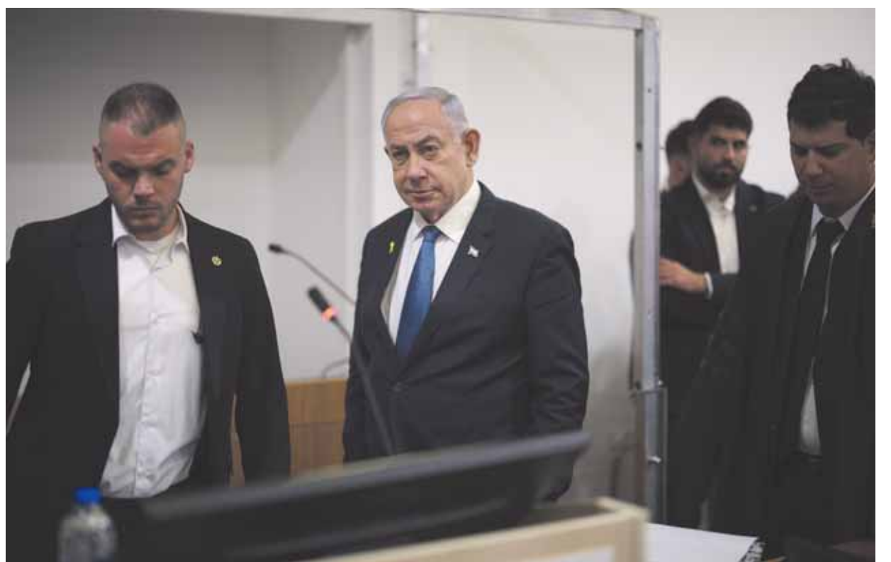
Israeli Prime Minister Benjamin Netanyahu attends his trial on corruption charges at the district court in Tel Aviv, Israel, on Monday.

passed, dozens more people came forward with claims of suspected losses that the bank is working to verify, it said. The MUFU case is the second recent one involving criminal activity at a major Japanese financial institution. In November, Nomura Holdings acknowledged that a former employee had been arrested on suspicion of robbery, attempted murder and arson targeting a client in Hiroshima. Asked about the MUFU thefts, the chief government spokesman said Monday that banking operations require high levels of trust and a sense of public service. The case was "extremely regrettable," said Chief Cabinet Secretary Yoshimasa Hayashi.