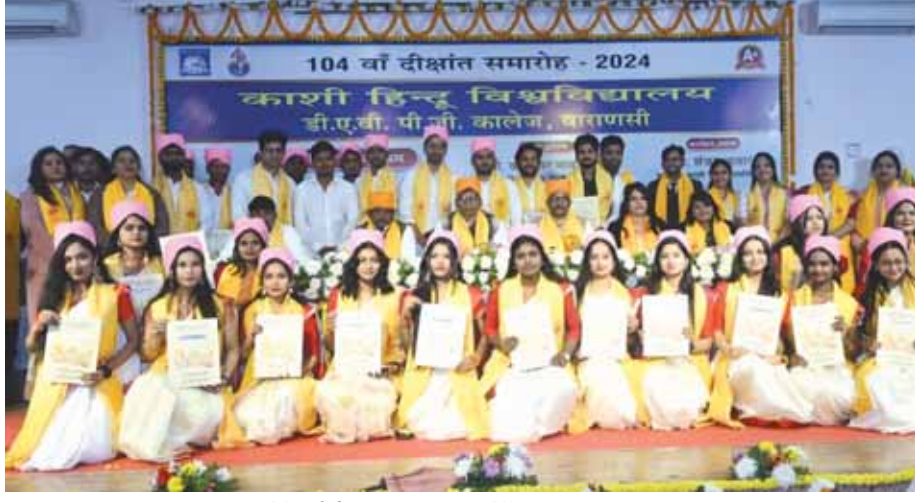
The degree distribution ceremony of DAV PG College being held at BHU in Varanasi on Monday.