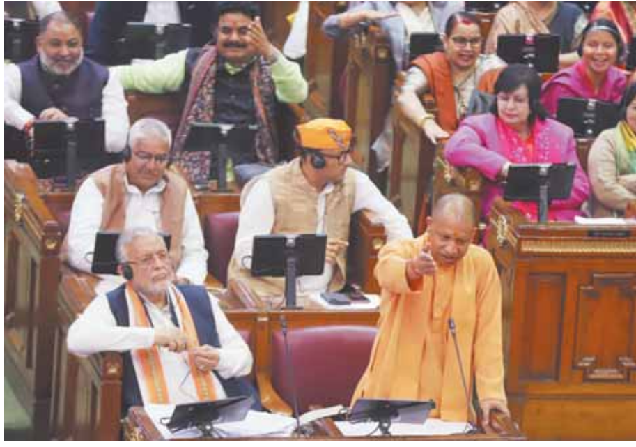
Chief Minister Yogi Adityanath speaking on the first day of the winter session in UP assembly on Monday

it clear—'Na Batenge, Na Katenge.'" Recalling the long history of communal riots in Sambhal since 1947, CM said, "There were deaths and riots in 1947, and 1948, and continued unrest through the decades, with significant violence in 1978, where 184 Hindus were burned alive. In 1980-1982, there were more riots, and in 1990-1992, five people were killed. A total of 209 Hindus have lost their lives in Sambhal since 1947." He also referred to the brutal murder of a businessman in the 1978 riots, whose limbs were cut and then his throat was slit. CM Yogi assured the House that anyone involved in stonelling or attempting to disrupt peace will be strictly dealt with and will not be spared. Yogi urged the opposition to read the preamble of Baba