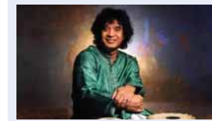
Tabla maestro Zakir Hussain passes away

The four-time Grammy Award winner, Indian tabla maestro and an innovative music fusion creator, Zakir Hussain is no more with us. The silence on his tabla is a huge loss for Hindustani classical music and jazz fusion. Zakir was truly an indelible gem in the world of music. The list of his national and international accolades is really long, as he had always made India proud with his tireless contribution in