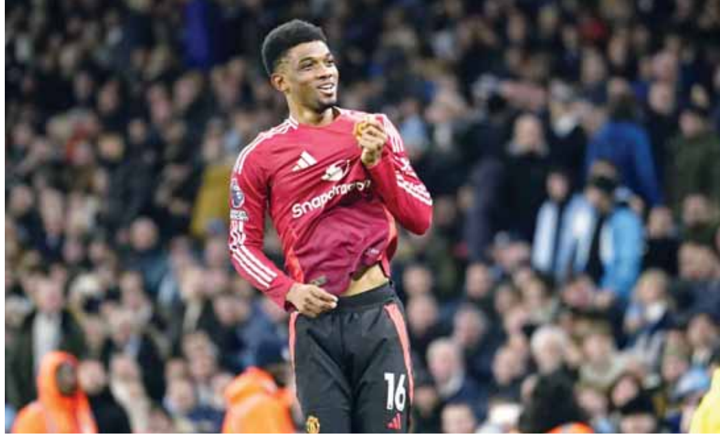
United is 13th and five points behind fifth-place City, which has seen its title defense unravel during its losing run.

simple as that,” Guardiola said. It was a first derby victory for new United head coach Ruben Amorim, who led Sporting Lisbon to a 4-1 win against City in one of his last games in charge of the Portuguese club in November. But for a long time it looked like being a third-straight league loss for United after Josko Gvardiol’s headed goal in the 36th. Fernandes was guilty of missing the target when through on goal in the second half and United struggled to create chances against a City team that rarely looked like adding to its lead. But in a dramatic end to the match, Diallo raced after an underhit backpass from Matheus Nunes. Nunes then brought down the United forward in the box and referee Anthony Taylor pointed to the penalty spot. Fernandes made no mistake this time — sending Ederson the wrong way. Moments later, Diallo ran onto a long pass from Lisandro Martinez, flicked the ball high and past Ederson before rolling it