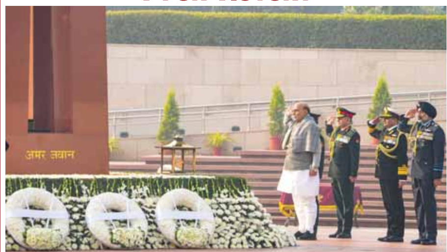
Union Defence Minister Rajnath Singh pays homage at the National War Memorial on the occasion of Vijay Diwas, marking India's victory in the 1971 Bangladesh liberation war. Chief of Defence Staff (CDS) Gen Anil Chauhan, Chief of Army Staff Gen. Manoj Pande, Navy Chief Admiral Dinesh K Tripathi and IAF Chief Air Chief Marshal AP Singh are also seen