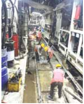
will now dig through about 720 metres of tunnel on the 'upline' until it reaches Jhakarkati underground station. After 'dragging' the 158-metre station length again in Jhakarkati, the TBM will be launched for the final stretch, constructing a tunnel of approximately 940 metres to Kanpur Central. The 80-metre-long 'Azad' TBM after reaching the Transport

The tunnel construction from Swadeshi Cotton Mill towards Kanpur Central under Corridor-1 of the Kanpur Metro Rail Project (IT-Naubasta) is progressing rapidly. Both Tunnel Boring Machines (TBMs) 'Azad' and 'Vidyarthi', have completed a 330-metre stretch from the ramp area near Swadeshi Cotton Mill to Transport Nagar station. The 'Azad' TBM is tunneling on the 'upline', while the 'Vidyarthi' TBM is working on the 'downline'. After reaching Transport Nagar station in October, the 'Azad' TBM was 'dragged' approximately 215 metres to the other end of the station. On Sunday it was launched to continue the tunnel construction along the remaining 1.80 km underground stretch towards Kanpur Central. This machine