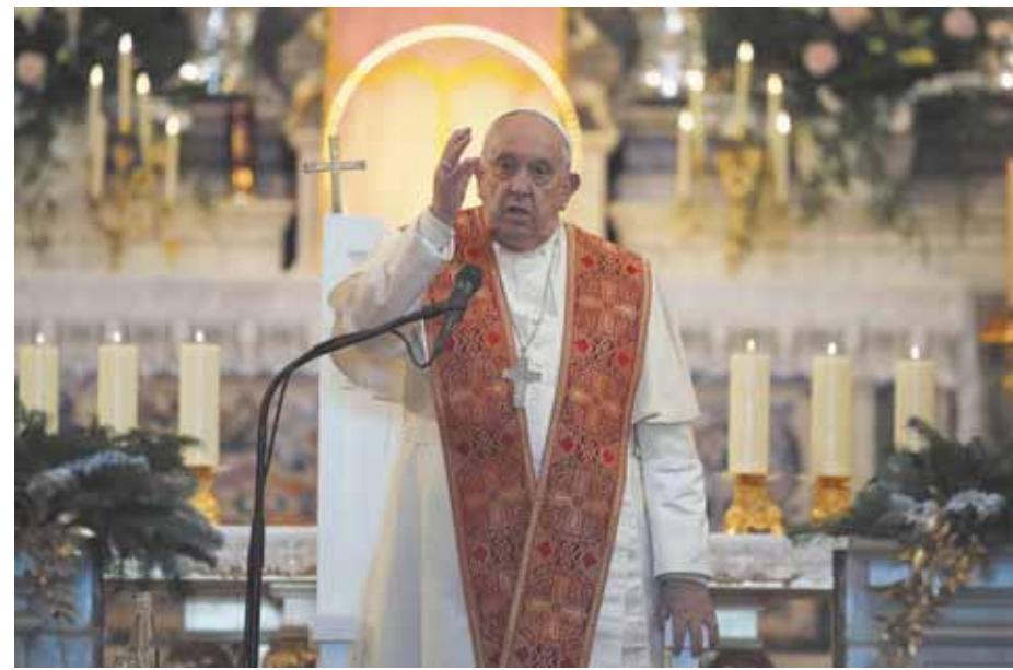
Pope Francis delivers the Angelus prayer inside the Cathedral of Our Lady of the Assumption of Ajaccio on the occasion of his one-day visit in the French island of Corsica on Sunday.

Pope Francis on the first papal visit ever to the French island of Corsica on Sunday called for a dynamic form of laicism, promoting the kind of popular piety that distinguishes the Mediterranean island from secular France as a bridge between religious and civic society. Speaking at the close of a Mediterranean conference on popular piety, Papa Francesco, as he is called in Corsican, described a concept of secularism "that is not static and fixed, but evolving and dynamic," that can adapt to "unforeseen situations" and promote cooperation "between civil and ecclesiastical authorities." The pontiff said that expressions of popular piety, including processions, communal prayer of the Holy Rosary, "can nurture constructive citizenship" on the part of Christians. At the same time, he warned against such manifestations being seen only in terms of folklore, or even superstition. During off-the-cuff remarks, the pope relayed his experience attending a festival in northern Argentina before his pontificate where he witnessed the importance of popular piety for the faithful "that seeks a healthy complexity." The visit to Corsica's capital Ajaccio, birthplace of Napoleon, is one of the briefest of his papacy beyond Italy's borders, just about nine hours on the ground, including a 40-minute visit with French President Emmanuel Macron. Francis was joined on the dais by the bishop of Ajaccio,