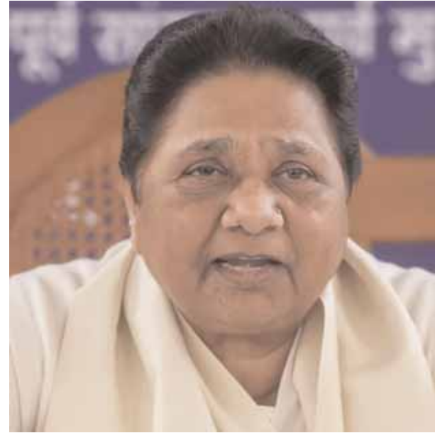
Bahujan Samaj Party president Mayawati addresses a press conference at her residence in Lucknow on Sunday

"And it would have been better if these two parties (Congress, SP) had remained silent on this