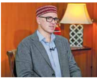
Assembly polls in Haryana, Maharashtra, Jharkhand and J & K where the party was outshined by their principle ally Jharkhand Mukti Morcha (JMM) and Jammu and Kashmir National Conference (JKNC), respectively. "When you get a hundred plus members of Parliament using the same EVMs, and you celebrate that as sort of a victory for

There seem to be further cracks developing in the Congress-led Opposition INDIA Bloc, as Jammu and Kashmir Chief Minister and head of National Conference Omar Abdullah on Sunday categorically rejected the grand old party's crying over Electronic Voting Machines (EVMs) after losing elections. Omar is one of the important ally of the INDIA Bloc and his resentment against Congress comes within one week which saw other constituents like Sharad Pawar-led Nationalist Congress Party (NCP), Mamata Banerjee-led Trinamool Congress (TMC), Lalu Yadav-led Rashtriya Janata Dal (RJD) echoed similar views and called for Congress must rethink and give up its Big brother attitude after the party had dismal performance in the just concluded