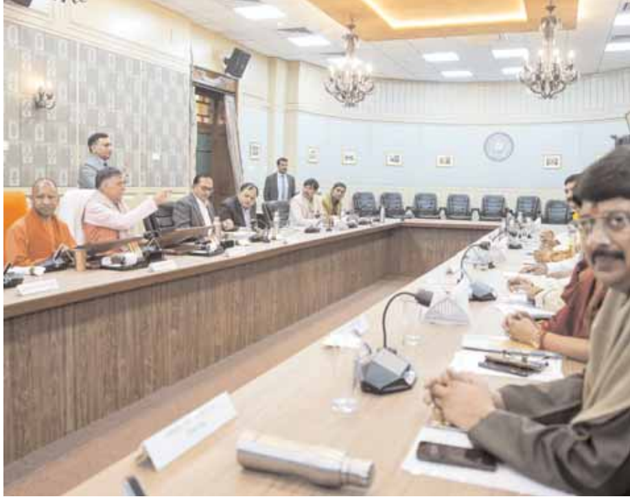
Uttar Pradesh Chief Minister Yogi Adityanath with Assembly Speaker Satish Mahana and other leaders during an all-party meeting ahead of the winter session, in Lucknow on Sunday

Uttar Pradesh legislative Assembly Speaker Satish Mahana and Chief Minister Yogi Adityanath on Sunday sought cooperation from all political parties for smooth proceedings as the winter session of the state assembly commences here on Monday. Leaders from various political parties participated in the all-party meeting presided over by the state assembly speaker. CM Yogi emphasised that constructive discussions in the House contribute to both the state's development and the resolution of public issues. "As public representatives, we must address the concerns and problems of the people constructively," he said. The chief minister, along with the assembly speaker, called for the cooperation of all parties to ensure the efficient functioning of the House.