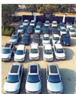
Toyota Kirloskar Motor, Hyundai Motor India, Kia