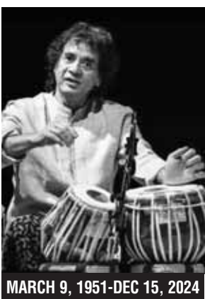
MARCH 9, 1951-DEC 15, 2024

in corrupt practices and bribery in India, UAE and Turkey. "In 2019, Oracle India sales employees also used an excessive discount scheme in connection with a transportation company, a majority of which was owned by the Indian Ministry of Railways... One of the sales employees involved in the transaction maintained a spreadsheet that indicated $67,000 was the "buffer" available to potentially make payments to a specific Indian SOE (State Owned Entity) official. "A total of approximately $330,000 was funneled to an entity with a reputation for paying SOE officials and another $62,000 was paid to an entity controlled by the sales employees," states the 10-page order of Securities and Exchange Commission imposing hefty fine of Rs.23 Million Dollars on Oracle, caught for bribery amount of 6.8 Million Dollars.