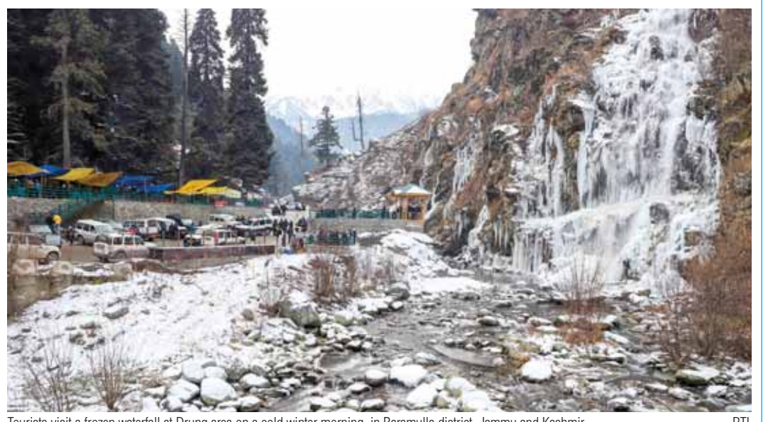
Tourists visit a frozen waterfall at Drung area on a cold winter morning, in Baramulla district, Jammu and Kashmir