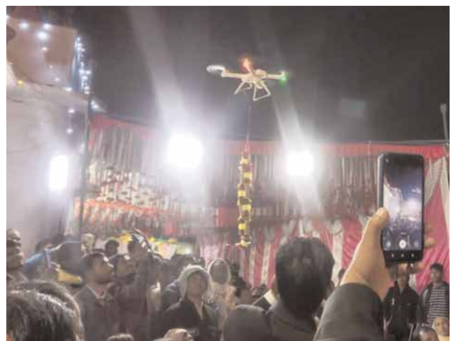
A drone is seen bringing garland to the couple atop a lotus shaped stage, in Ballia