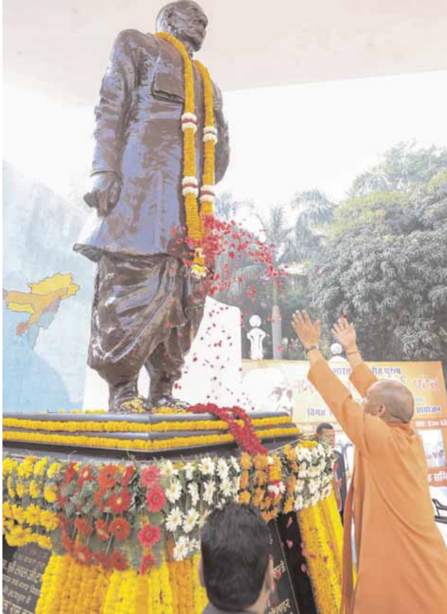
Uttar Pradesh Chief Minister Yogi Adityanath pays floral tribute to Sardar Vallabhbhai Patel on his death anniversary, in Lucknow, on Sunday

Adityanath further said Patel, a great son of Mother India, not only led the campaign for the country's unification but also ensured the restoration of its dignity, which was tarnished during the colonial period. He