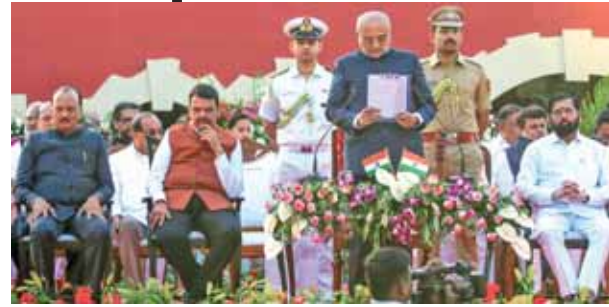
Maharashtra Governor CP Radhakrishnan, Chief Minister Devendra Fadnavis, Deputy Chief Ministers Ajit Pawar and Eknath Shinde and others during the swearing-in ceremony of cabinet ministers amid State Cabinet expansion, at Raj Bhavan, in Nagpur

In the first-ever expansion of this ministry undertaken by him ten days after he and two Deputy Chief Ministers were sworn in, Maharashtra Chief Minister Devendra Fadnavis on Sunday inducted 39 ministers, including 33 ranked ones, into his Cabinet, while he dropped 10 senior MahaYuti leaders, including BJP's Sudhir Mungantiwar and Nationalist Congress Party NCP (Ajit Pawar) leader Chhagan Bhujbal, from it. In a swearing-in ceremony held at Raj Bhavan in Nagpur for the second time since 1981, Maharashtra Governor CP Radhakrishnan administered oath of office to the 39 ministers, including six Ministers of State, ahead of the start of the Winter Session of the Maharashtra Legislature on Monday. Interestingly enough, as many as 25 new faces found place in the Devendra Fadnavis Cabinet. Late BJP leader Gopinath Munde's daughter Pankaja Munde, who has made a comeback as a State minister for the second time in her career, is among the four women ministers in the State Cabinet. With the induction of 39 ministers, the total number of ministers in the State Cabinet has gone up to 42, which is one less than the stipulated 43-member ministry which accounts for 15 percent of total