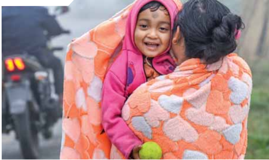
A woman protects her child from cold during a foggy winter morning, in Nadia