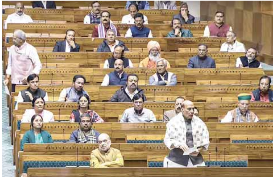
Defence Minister Rajnath Singh speaks during a discussion on the 75th anniversary of the adoption of the Constitution of India in the Lok Sabha during the Winter Session of Parliament