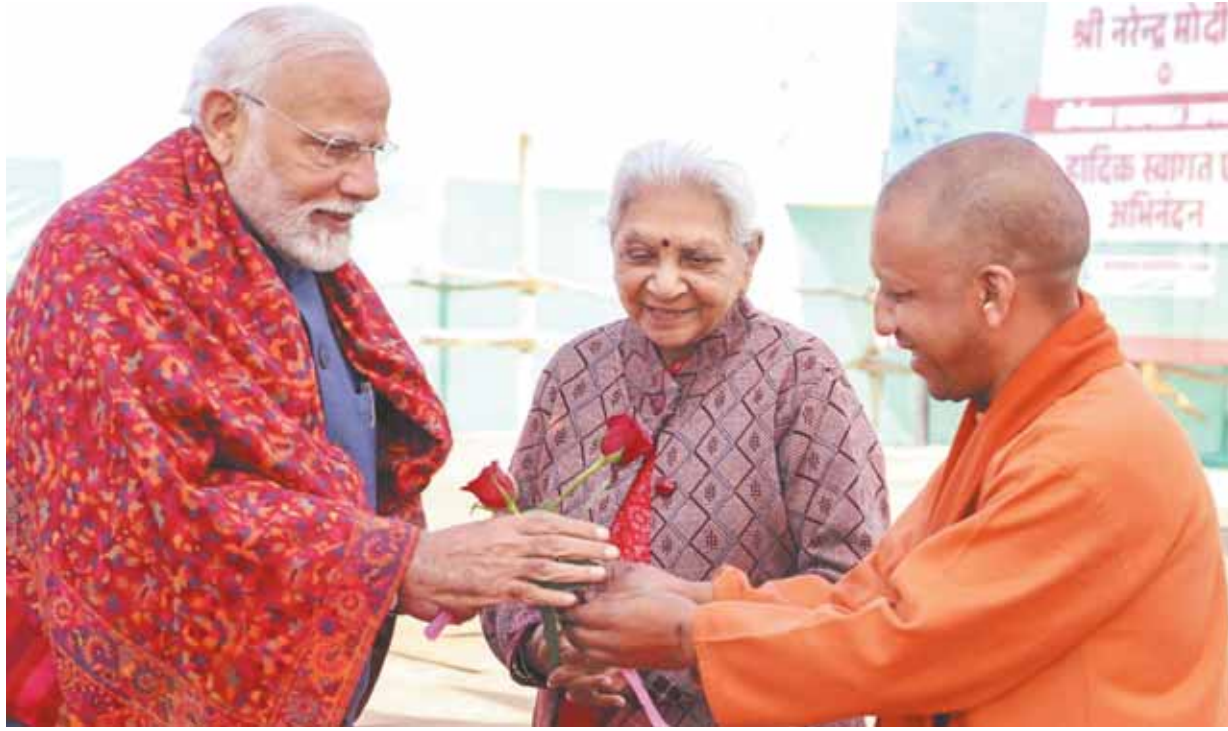
Prime Minister Narendra Modi being welcomed by Uttar Pradesh Governor Anandiben Patel and Chief Minister Yogi Adityanath upon his arrival, in Mahakumbh Nagar, Prayagraj, on Friday

inspiration and expressed gratitude for his continued guidance in preparing for Maha Kumbh 2025. While lauding the visionary leadership of PM Modi, Yogi acknowledged his efforts in upholding the values of Sanatan Dharma, safeguarding its traditions, and ensuring the highest standards for the Maha Kumbh are met. In his address, CM Yogi recalled that for the first time during the 2019 Kumbh in Prayagraj, and under the inspiration, guidance, and directives of PM Modi, devotees were blessed with the darshan of the sacred Akshayvat after hundreds of years. He noted that this time, the Akshayvat Corridor would also be inaugurated. The chief minister stated that the corridor of the Bade Hanuman Temple is also being inaugurated by PM Modi. He further elaborated on Saraswati Koop, where Maa Saraswati is believed to reside invisibly and where her confluence with Ganga and Yamuna occurs at the Sangam. "For the first time in the