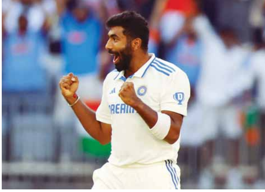
against the best batsmen of his era. "His ability to make it hard for

surgery already, it is not certain he will have a long career, but if he does, his name will be mentioned in the same breath as the champions above," Chappell wrote in the 'Sydney Morning Herald'. An all-format bowler, Bumrah has reinforced his status as the best bowler in the world several times including when he led India to a 295-run win in the Perth Test recently. "While the legends of yesteryear established the foundations, Bumrah is carving his own legacy – one that promises to inspire future generations of pacemen." The former Australia captain said Bumrah's lethal yorkers and unsettling bounce evoked memories of Lillee's raw aggression on the field. "Lillee was a warrior, combining raw aggression with psychological prowess. I opposed him many times in domestic cricket and watched him from close quarters