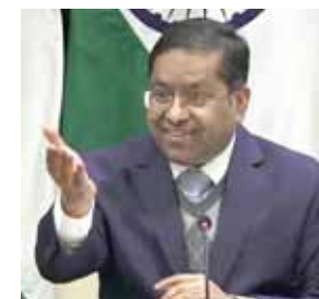
MEA spokesperson Randhir Jaiswal

Three Indian students have been murdered in Canada last week and the Indian High Commission in Ottawa has taken up the matter of safety of Indians with the Canadian authorities, the Ministry of External Affairs (MEA) said on Friday. The safety, security and welfare of Indian nationals in Canada remains of utmost importance to us, MEA spokesperson Randhir Jaiswal said. Jaiswal said the Indian missions in that country are in touch with the local authorities for thorough investigation of the incidents. "In the last week or so we have had unfortunate tragedies. Three Indian students have been murdered. We are saddened at these terrible tragedies that have struck our nationals in Canada. We extend our deepest