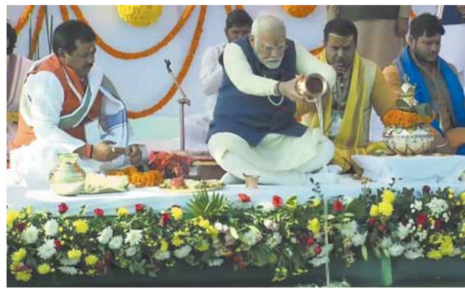
Prime Minister Narendra Modi performs worship at the Sangam, in Prayagraj, on Friday.

Modi inaugurates key development projects Prayagraj