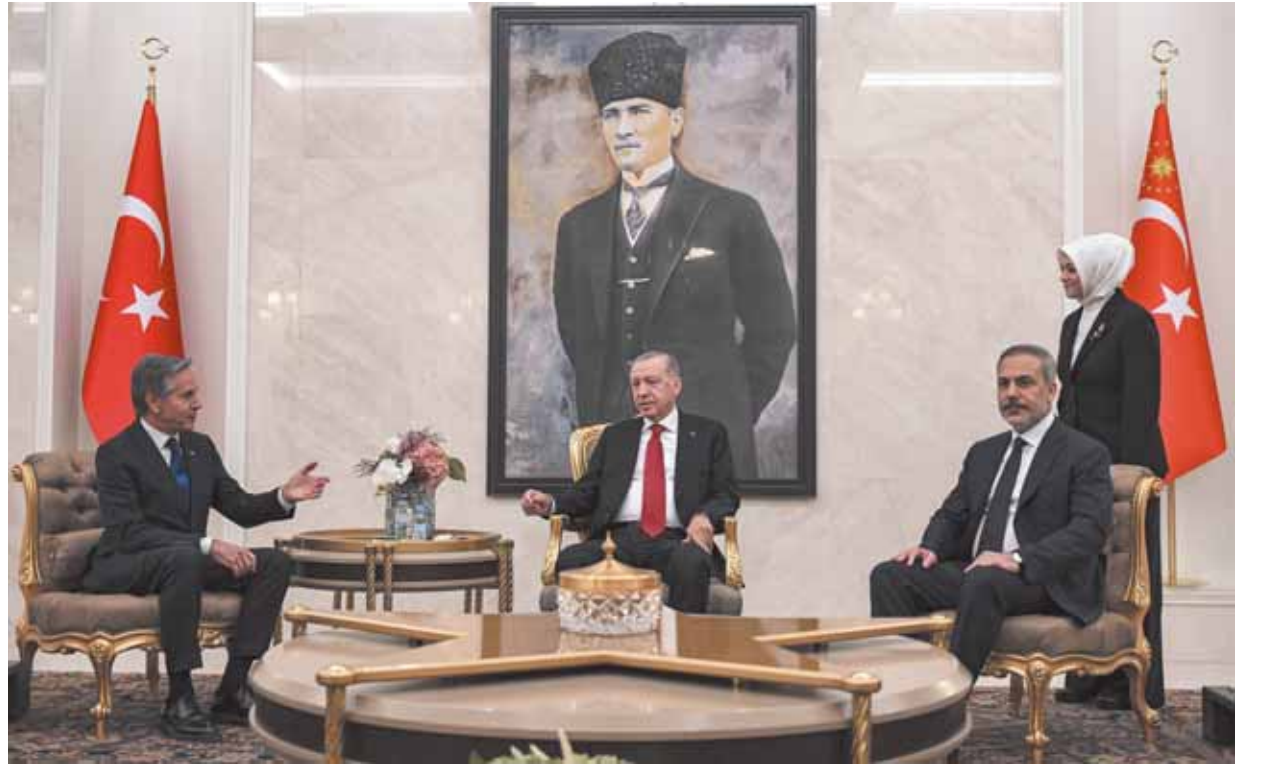
US Secretary of State Antony Blinken, left, meets with Turkey's President Recep Tayyip Erodgan, middle, and Foreign Minister Hakan Fidan, at Ankara Esenboga Airport.

rear its head again," Blinken said. The Turkish foreign minister said the two discussed ways of establishing prosperity in Syria and ending terrorism in the country. "Our priority is establishing stability in Syria as soon as possible, preventing terrorism from gaining ground, and ensuring that IS and the PKK aren't dominant," Fidan said, in a reference to the banned Kurdistan Workers Party. Blinken said: "We're very focused on the opportunity that now is before us and before the Syrian people to move from out from under the shackles of Bashar al-Assad to a different and better future for the Syrian people, one that the Syrian people decide for themselves." Blinken and Fidan said they had also discussed a ceasefire for Gaza. "We've seen in the last couple of weeks more encouraging signs that (a ceasefire) is possible," Blinken said.