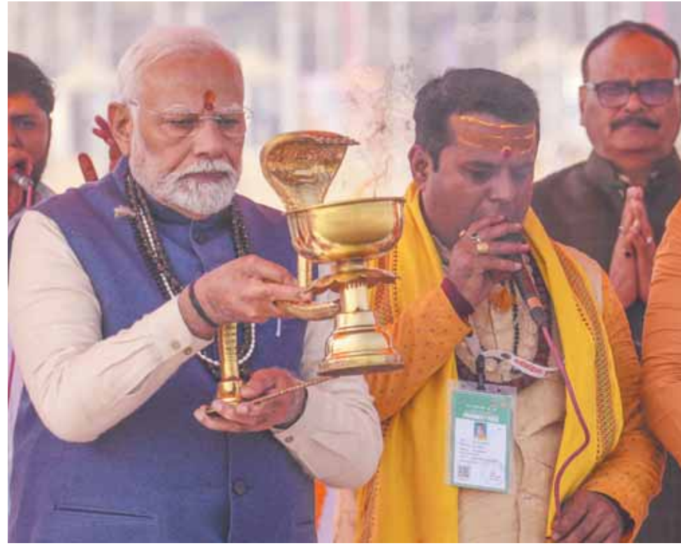
Prime Minister Narendra Modi performs worship at the Sangam Nose and Modi inspects developmental works of Maha Kumbh Mela 2025, in Prayagraj on Friday

In preparation for the Maha Kumbh 2025 in Uttar Pradesh, Prime Minister Narendra Modi visited Akshayavat on Friday, where he performed a sacred worship to seek blessings for the successful organisation of the event, the welfare of the world, and the prosperity of India. As the 'Yajman', PM Modi performed puja at the Sangam Nose and later at the revered Akshayavat, offering prayers and performing rituals to invoke divine grace. He bowed before the sacred tree, performed 'Pradakshina', and lit a ceremonial lamp for positive energy. PM Modi also reviewed the corridor development projects around Akshayavat to ensure smooth and accessible visits for millions of devotees expected during Maha Kumbh 2025. Akshayavat is revered as the embodiment of Lord Vishnu's Veni Madhav, the protector deity of Prayagraj. It is believed to house the presence of Lord Brahma, Vishnu, and Shiva, making it a powerful spiritual centre. The Akshayavat Corridor development, led by PM Modi's vision and implemented by Chief Minister Yogi Adityanath, is set to enhance accessibility for pilgrims. During his visit, PM Modi offered prayers at the Triveni Sangam in Prayagraj, the confluence of the Ganga, Yamuna, and Saraswati rivers, ahead of the Maha Kumbh festival, which