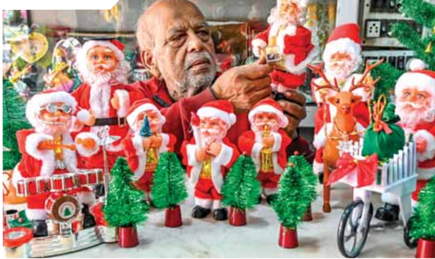
A vendor displays miniatures of Santa Claus ahead of Christmas celebrations, in Nadia