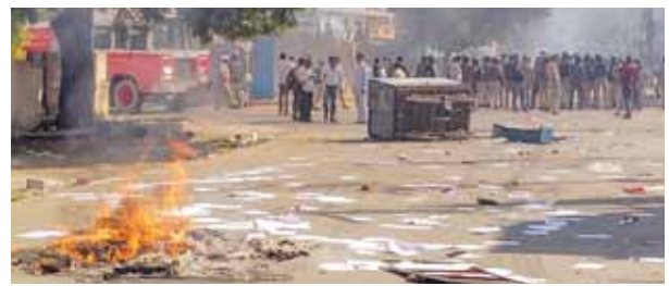
Protests continued for the second day over alleged vandalising of a replica of the Indian Constitution, in Parbhani, Maharashtra

For the first time after the shift in the season, Delhiites experienced winter chill as the minimum temperature dipped to the season's lowest on Wednesday at 4.9 degree celsius in Safdarjung station, dropping five degrees below normal this winter. There has been a three-degree celsius fall in the minimum temperature over Delhi-NCR during the past 24 hours. The Maximum and Minimum temperatures over Delhi are in the range of 20 to 23 degrees celsius and four to eight degrees Celsius respectively. According to data, the lowest minimum temperature during this period was recorded on December 6, 1987, at 4.1 degrees celsius. The IMD has issued a yellow alert, warning of similar cold wave conditions for the next two days. According to the data, in December 2023 and 2022, there were no cold wave days. However, November 2020 saw cold wave conditions with the minimum temperature plunging to 7.5 degrees Celsius. Continued on page 8