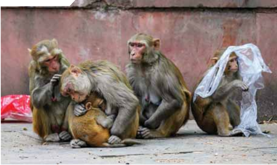
Monkeys huddle together on a chilly day, in New Delhi