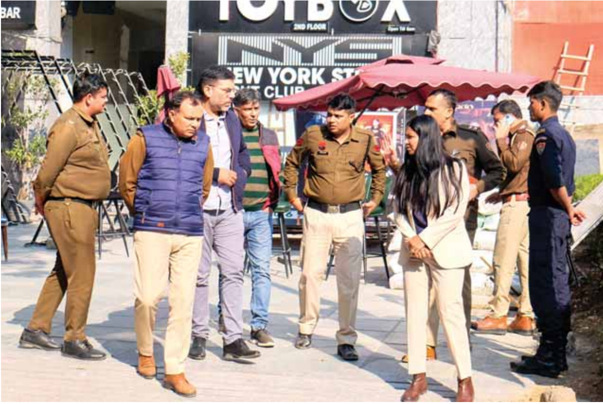
Police personnel investigate at the spot after a low-intensity explosion occurred outside a night club, in Gurugram.