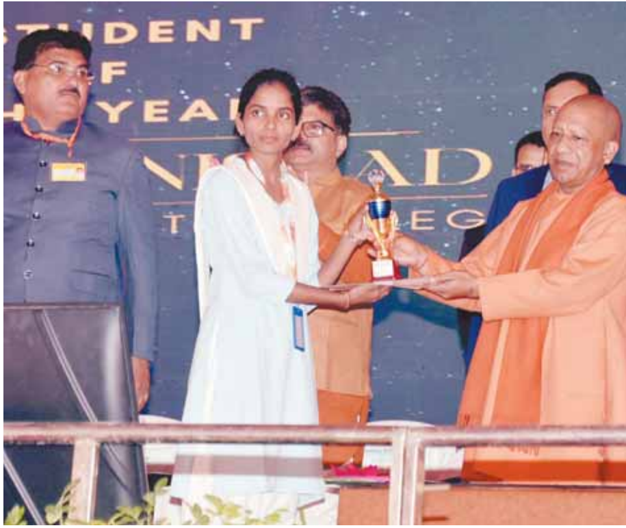
Chief Minister Yogi Adityanath at the 15th Foundation Day celebrations of Karma Devi Group in Basti

The chief minister honoured students and teachers for their outstanding achievements and