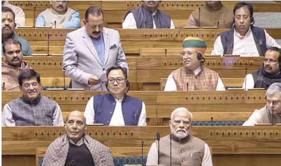
Prime Minister Narendra Modi with Defence Minister Rajnath Singh and others in the Lok Sabha during the Winter session of Parliament, in New Delhi

Parliament continued to be a battle-field virtually for the political parties on eleventh consecutive day on Wednesday as both ruling and Opposition benches trade charges against each other blaming neither of them are allowing smooth functioning of the Winter Session. With a brief functioning of the Lok Sabha which passed a bill to amend Railway Laws, Bharatiya Janata Party (BJP) led National Democratic Alliance (NDA) parties of the Treasury bench were at par with the Congress led Opposition INDIA Bloc in sloganeering in and out of the Lok Sabha and Rajya Sabha causing disruptions in both the Houses which ultimately led to adjournment of the day. Congress-led INDIA Bloc and BJP soon after the adjournments held Presser to flag concerns over non functioning of the Winter Session. Parliament proceedings were washed out in the first week of the winter session starting November 25 due to protests by Opposition members demanding discussion on issues like the indictment of industrialist Gautam Adani in a United States court and Sambhal violence and since last week, the ruling BJP MPs have been raising the issue of alleged nexus between Soros and the Congress posing a threat to national security. While several Opposition members alleged Rajya Sabha Chairman Jagdeep Dhankhar's "partisan" conduct which prompted them to move a