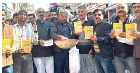
The members of Srimad Bhagavad Gita Vedic Nyas distributing copies of Srimad Bhagavad Gita to people in Govind Nagar on Wednesday.