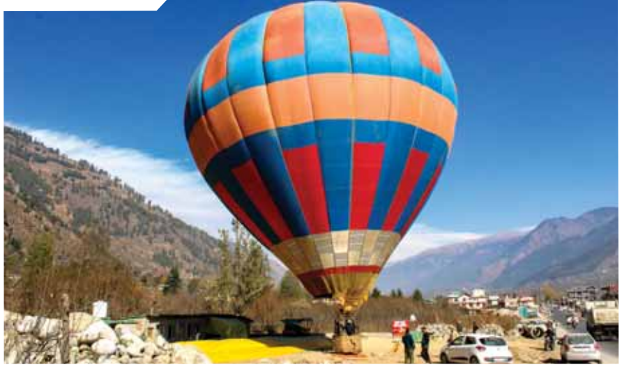
Tourists gear up to take a hot air balloon ride in Manali