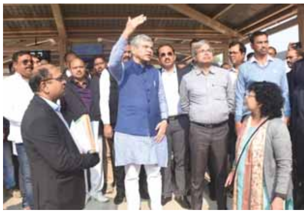
Railway Minister Ashwini Vaishnaw inspecting arrangements at Jhusi station on Sunday.

has 24 girders of 76.2 metres span and its length is about 2 km. Bridge construction work has been completed. Girder launching work through the duct has been completed at both ends and 100 per cent formation work has been completed in the Jhusi-Prayagraj rail section. It is to be noted that a total of 113.59 km of doubling from Banaras to Jhusi has been completed with electrified lines, the remaining Prayagraj Rambagh to Jhusi (7.36 km) is to be opened on