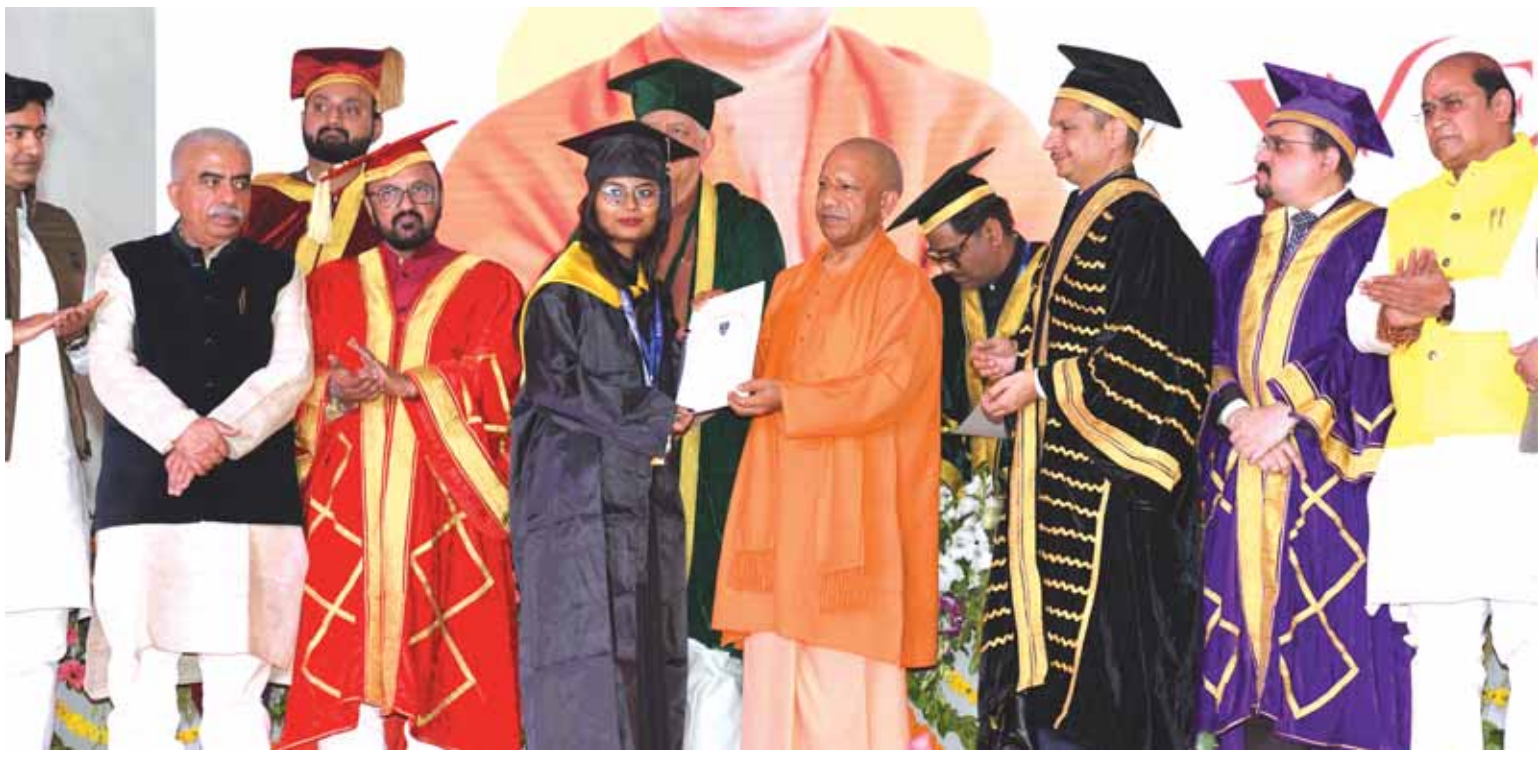
CM participating in third convocation of Rama University