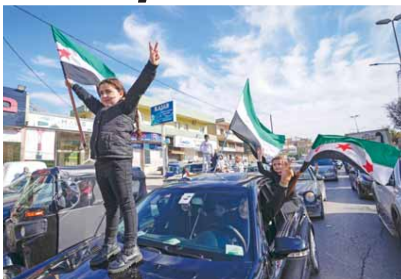
Syrians celebrate the fall of Bashar Assad's government in the town of Bar Elias, Lebanon, near the border with Syria.

Syrians poured into streets echoing with celebratory gunfire on Sunday after a stunning rebel advance reached the capital, putting an end to the Assad family's 50 years of iron rule but raising questions about the future of the country and the wider region. Joyful crowds gathered in central squares in Damascus, waving the Syrian revolutionary flag in scenes that recalled the early days of the Arab Spring uprising, before a brutal crackdown and the rise of an insurgency plunged the country into a nearly 14-year civil war. Others gleefully ransacked the presidential palace and the Assad family residence after President Bashar Assad and other top officials vanished, their whereabouts unknown. Russia, a close ally, said