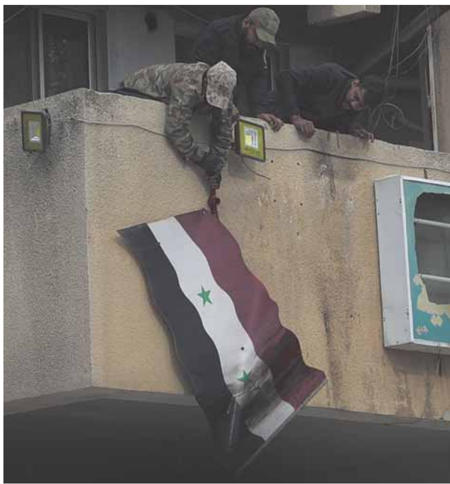
Syrian opposition fighters remove a government Syrian flag from an official building in Salamiyah, east of Hama, Syria

Qaida. "This new organisation has no affiliation to any external entity," he said in the video, filmed wearing military garb and a turban. The move paved the way for al-Golani to assert full control over fracturing militant groups. A year later, his alliance rebranded again as Hayat Tahrir al-Sham — meaning Organisation for Liberating Syria — as the groups merged, consolidating al-Golani's power in northwest Syria's Idlib province. HTS later clashed with independent Islamist militants who opposed the merger, further emboldening al-Golani and his group as the leading power in northwestern Syria, able to rule with an iron fist. With his power consolidated, al-Golani set in motion a transformation that few could have imagined. Replacing his military garb with shirt and trousers, he began calling for religious tolerance and pluralism. He appealed to the Druze community in Idlib, which the Nusra Front had previously targeted, and visited the families of Kurds who were killed by Turkish-backed militias. In 2021, al-Golani had his first interview with an American journalist on PBS. Wearing a blazer, with his short hair gelled back, the now more soft-spoken HTS leader said that his group posed no threat to the West and that sanctions imposed against it were unjust. "Yes, we have criticised Western policies," he said. "But to wage a war against the United States or Europe from Syria, that's not true. We didn't say we wanted to fight."