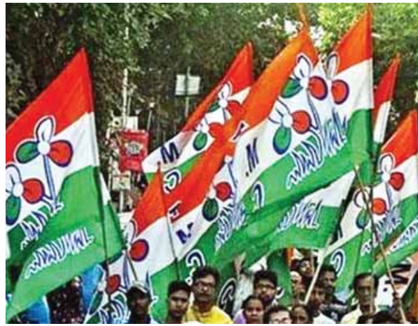
fake certificates being provided to any foreign national ... if so strong action will be taken," the TMC leader said. Another senior functionary of the TMC responsible for handling the municipal body said that he too was not aware of

Afghanistan have acquired similar credentials from various municipal authorities. A senior district Trinamool Congress leader and a top functionary of the civic body said that he had no information regarding the issuance of such certificates to any foreign nationals and said inquiries had been ordered and actions would be taken if anyone would be found guilty of misconduct. "I was not coming to office for several days and hence had not much information about such developments ... however considering these as routine affair ... I have given instructions to the department concerned to find out the veracity of the reports of