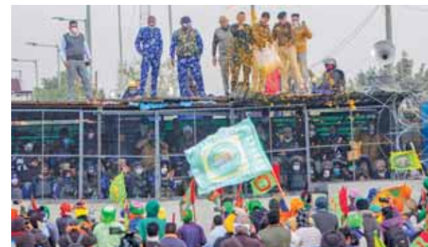
Police personnel shower flowers on farmers agitating at Shambhu border, in Patiala district.

Agitating farmers on Sunday afternoon suspended their "Dilli Chalo" foot march for the day after some of them suffered injuries in tear gas shelling by Haryana police, the protesting farmers will decide on the next course of action on Monday. After the farmers started the foot march on Sunday, they were halted by the multilayered barricading erected by the Haryana Police at the entry point to Haryana from Punjab. A heated argument took place between protesting farmer 'jatha' and security personnel. Haryana Police asked the farmers to show them the requisite