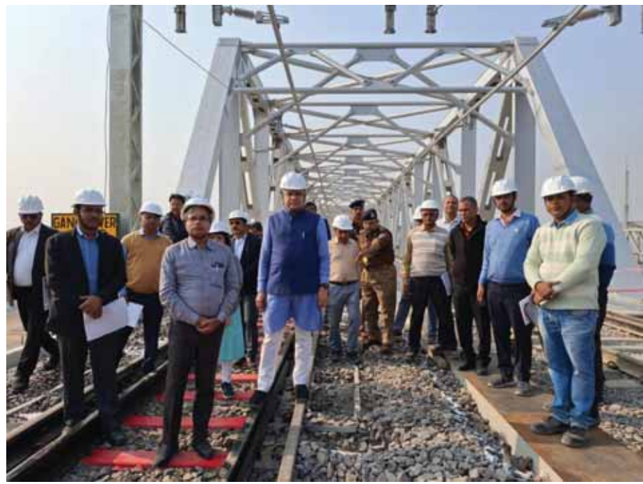
Railway and Information Broadcasting Minister Ashwini Vaishnaw on Sunday inspected the to be commissioned 2.2 kilometres double line New Railway Bridge over Ganga in Prayagraj where the Mahakumbh is scheduled early next year. The Old bridge was single line and of more than 100 years which will be decommissioned shortly. The work for the New Ganga Bridge started in October 2020 and will be commissioned soon by Prime Minister Narendra Modi. Railways also announced that it will run 13000 trains for the Mahakumbh between early January 2025 till February 2025.