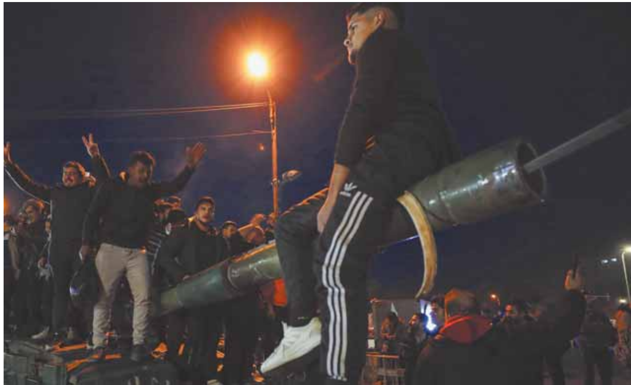
Syrians celebrate the arrival of opposition fighters in Damascus on Sunday.

skirts of the capital following a yearslong siege. The night before, opposition forces had taken the central city of Homs, Syria's third largest, as government forces abandoned it. The rapidly developing events have shaken the region. Lebanon said it was closing all its land border crossings with