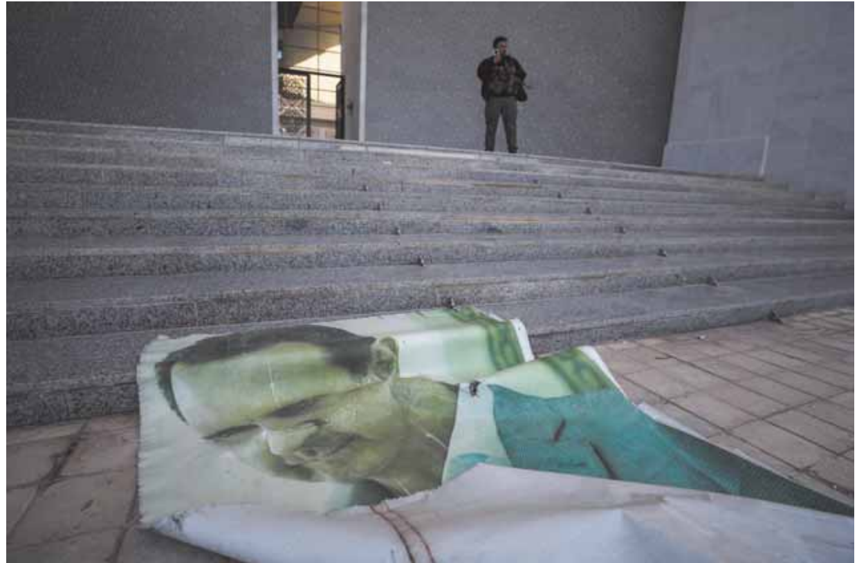
A giant picture of Syrian President Bashar Assad lies on the ground as a Syrian opposition fighter stands nearby, inside the Presidential Palace in Damascus, Syria on Sunday.

lowing the downfall of Syria's Bashar Assad. Many welcomed Assad's ouster after decades of repression under his rule and that of his father Hafez Assad. Others, however, expressed concerns about the future of Syria, mostly given the extremist past of rebel commanders, especially Abu Mohammed al-Golani who leads Hayat Tahrir al-Sham, labelled a terrorist by the United States. EU top diplomat welcomes Bashar Assad's ouster: The European Union's top diplomat welcomed the fall of Bashar Assad and said that the collapse of his rule underlines how weak his supporters in Moscow and Tehran have become. "The end of Assad's dictatorship is a positive and long-awaited development," EU for-