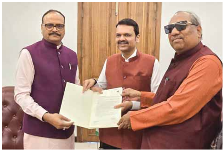
Uttar Pradesh's Deputy Chief Minister Brajesh Pathak meets Maharashtra Chief Minister Devendra Fadnavis to invite him for his dignified presence in the Maha Kumbh 2025, in Mumbai, on Sunday