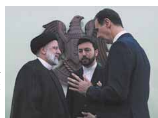
FILE: Syrian President Bashar Assad (right) speaks with Iranian President Ebrahim Raisi (left).

noon Sunday, there was "no serious threat" to the security of Russia's military bases there. Russia has waged a military campaign in Syria since September 2015, teaming up with Assad's government to fight armed opposition groups and reclaim control over most of the country. While Russia now concentrates the bulk of its military resources in Ukraine, it has maintained a military foothold in Syria and keeps troops at its bases there.