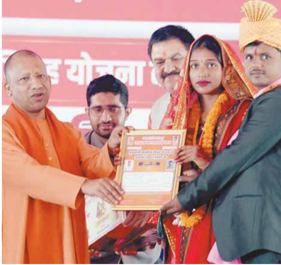
Chief Minister Yogi Adityanath giving blessings to a newly-married couple in Varanasi on Saturday

He added that the Beti Bachao, Beti Padhao initiative is deeply connected to the safety, honour, and self-reliance of daughters. The Mukhyamantri Samuhik Vivah Yojana, he remarked, is a historic step in this direction, symbolising the collective effort to support women's dignity and societal welfare.