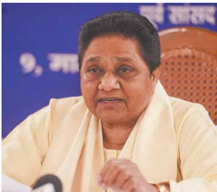
Bahujan Samaj Party president Mayawati addresses a press conference at her residence, in Lucknow on Saturday

"Most of them are Dalits and people from weaker sections... Congress party is silent and is now shouting 'be careful' only for Muslim votes," the BSP chief said while addressing a press conference. She further said that Congress, Samajwadi Party and their supporters are "two sides of the same coin". She alleged that both parties are inciting divisions within the Muslim community in Sambhal to secure votes. Mayawati claimed that Samajwadi Party and Congress are prioritising Muslim votes over other pressing issues. "These two parties are pitting Turks and non-Turks in the Muslim community against each other in Sambhal. Muslims must remain cautious about these tactics," she said. "The Congress has remained silent on atrocities against Hindus in Bangladesh but is now vocally addressing Sambhal solely to win Muslim votes. This proves that Congress and Samajwadi Party are two sides of the same coin," she remarked. Mayawati expressed disappointment over the silence of Dalit parliamentarians on issues affecting their community. She accused them of prioritising party loyalty over the interests of Dalits, whether in India or Bangladesh. The BSP chief mentioned historical injustices faced by Dalits during the Partition of India. According to her, the Jessore-Khulna region in Bangladesh, which was a Hindu-majority area, was handed over to Pakistan during Partition as a deliberate move by the Congress. This, she said, was an act of casteist poli-