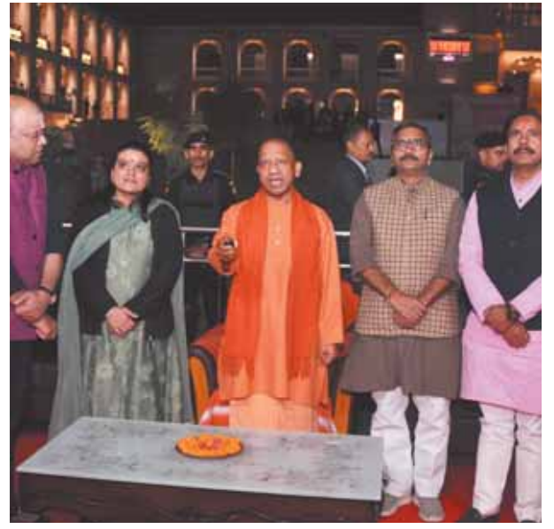
Shrikesh P and others were also present.

Chief Minister Yogi Adityanath unveiled 11 LED screens installed by Axis Bank in the Kashi Vishwanath Temple (KVT) complex here late Friday evening, after offering prayers at the temple.