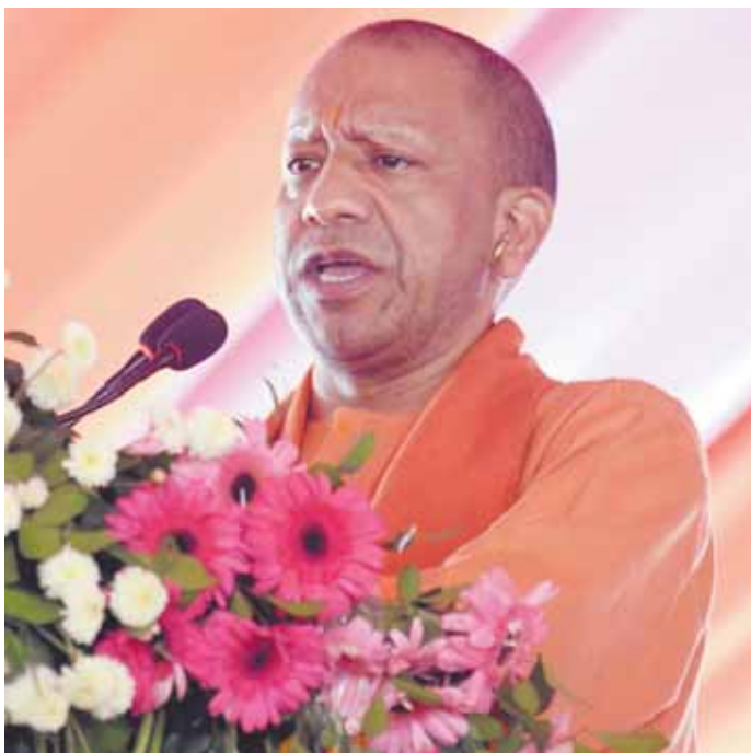
Chief Minister Yogi Adityanath speaking at the centenary celebrations of the Vihangam Yoga Sant Samaj at Swarved Mahamandir Dham in Varanasi on Saturday

Chief Minister Yogi Adityanath, on Saturday, said that Bharatiyata (Indianness) had the power to unite all. "A secure nation ensures the security of religion and individuals," he said, emphasising Prime Minister Narendra Modi's vision of dedicating every action to the nation. He urged everyone to prioritise national interests, transcending personal, social, or religious boundaries, while staying connected to India's Vedic and spiritual traditions rooted in Sanatan Dharma.