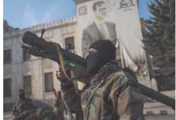
A Syrian opposition fighter holds a rocket launcher in front of the provincial government office, where an image of Syrian President Bashar Assad is riddled with bullets on the facade, in the aftermath of the opposition's takeover of Hama, Syria.

that Iran's military advisers have started leaving Syria. He added that Iran-backed fighters in eastern Syria, mainly from Afghanistan and Pakistan, have withdrawn into central Syria. The shock offensive began November 27 led by the jihadi Hayat Tahrir al-Sham group, or HTS, during which gunmen captured the northern city of Aleppo, Syria's largest, and the central city of Hama, the country's fourth largest city. The group has its origins in al-Qaida and is considered a terrorist organisation by the US and the United Nations. HTS leader Abu Mohammed al-Golani told CNN in an exclusive interview Thursday from Syria that the aim of the offensive is to overthrow Assad's government. The Britain-based Observatory said Syrian troops have withdrawn from much of the two southern provinces and are sending reinforcements to Homs, where a battle is looming. If the insurgents capture Homs, they would cut the link between Damascus, Assad's seat of power, and the coastal region where the president enjoys wide support. The Syrian army said in a statement Saturday that it has carried out redeployment and repositioning in Sweida and