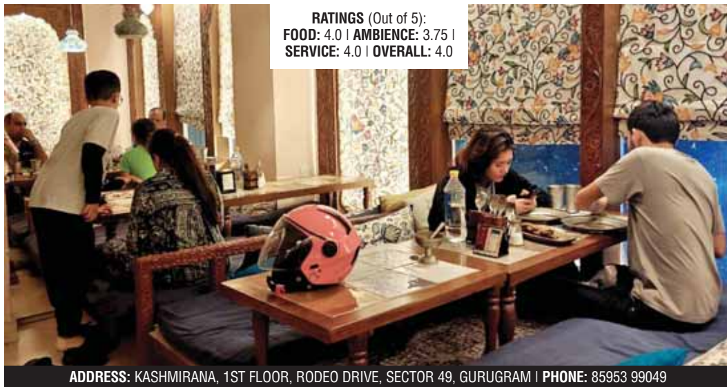
ADDRESS: KASHMIRANA, 1ST FLOOR, RODEO DRIVE, SECTOR 49, GURUGRAM | PHONE: 85953 99049

RATINGS (Out of 5): FOOD: 4.0 | AMBIENCE: 3.75 | SERVICE: 4.0 | OVERALL: 4.0