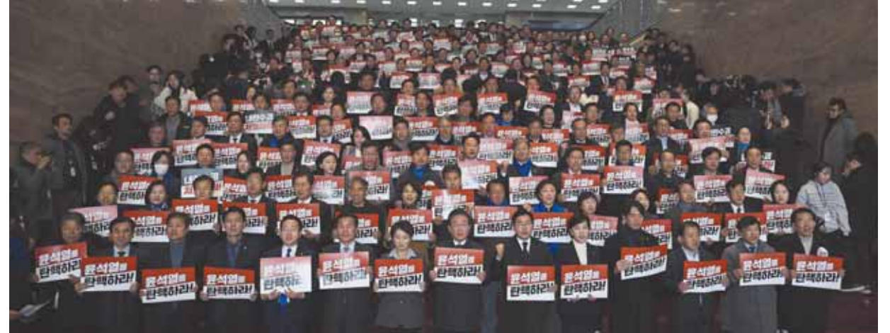
South Korea's main opposition Democratic Party leader Lee Jae-myung, bottom centre, and his party members stage a rally to denounce President Yoon Suk Yeol's apology over Tuesday's martial law declaration at the National Assembly in Seoul on Saturday. The signs read, 'Punish.'

sparked alarm among key diplomatic partners like the US and Japan. Tuesday night saw special forces troops encircling the parliament building and army helicopters hovering over it, but the military withdrew after the National Assembly unanimously voted to overturn the decree, forcing Yoon to lift it before daybreak Wednesday. The declaration of martial law was the first of its kind in more than 40 years in South Korea. Eighteen lawmakers from the ruling party voted to reject Yoon's martial law decree along with opposition lawmakers. Yoon's speech fuelled speculation that he and his party may push for a constitutional amendment to shorten his term, instead of accepting impeachment, as a way to ease public anger over the martial law and facilitate Yoon's early exit from office. Lee Jae-myung, the leader of the main liberal opposition Democratic Party, told reporters that Yoon's speech was "greatly disappointing" and that the only way forward is his immediate resignation or impeachment. His party called Yoon's martial law "unconstitutional, illegal rebellion or coup." The passage of Yoon's impeachment motion appeared more likely Friday when the chair of Yoon's party called for his