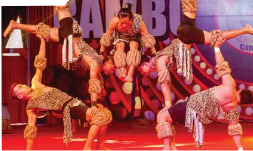
Artistes perform during a show of Rambo Circus, in Mumbai