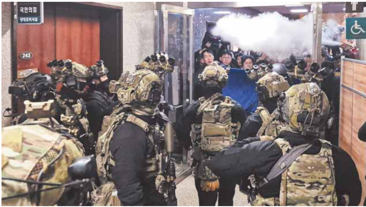
A National Assembly staff sprays fire extinguishers to block soldiers entering the main hall of the National Assembly in Seoul, South Korea, Wednesday.

In his speech announcing the abrupt order Tuesday night, Yoon vowed to eliminate "anti-state" forces and continued to criticise the Democratic Party's attempts to impeach key government officials and senior prosecutors. But martial law lasted only about six hours, as the National Assembly voted to overrule Yoon before his Cabinet formally lifted it around 4:30 a.m. The Democratic Party, which holds a majority in the 300-seat parliament, said Wednesday that its lawmakers decided to call on Yoon to quit immediately or they would take steps to