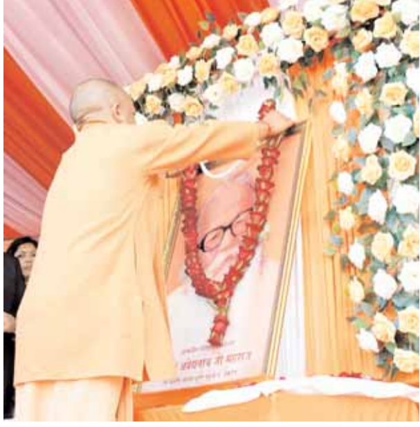
Chief Minister Yogi Adityanath garlanding the portrait of late Mahant Avedyanath