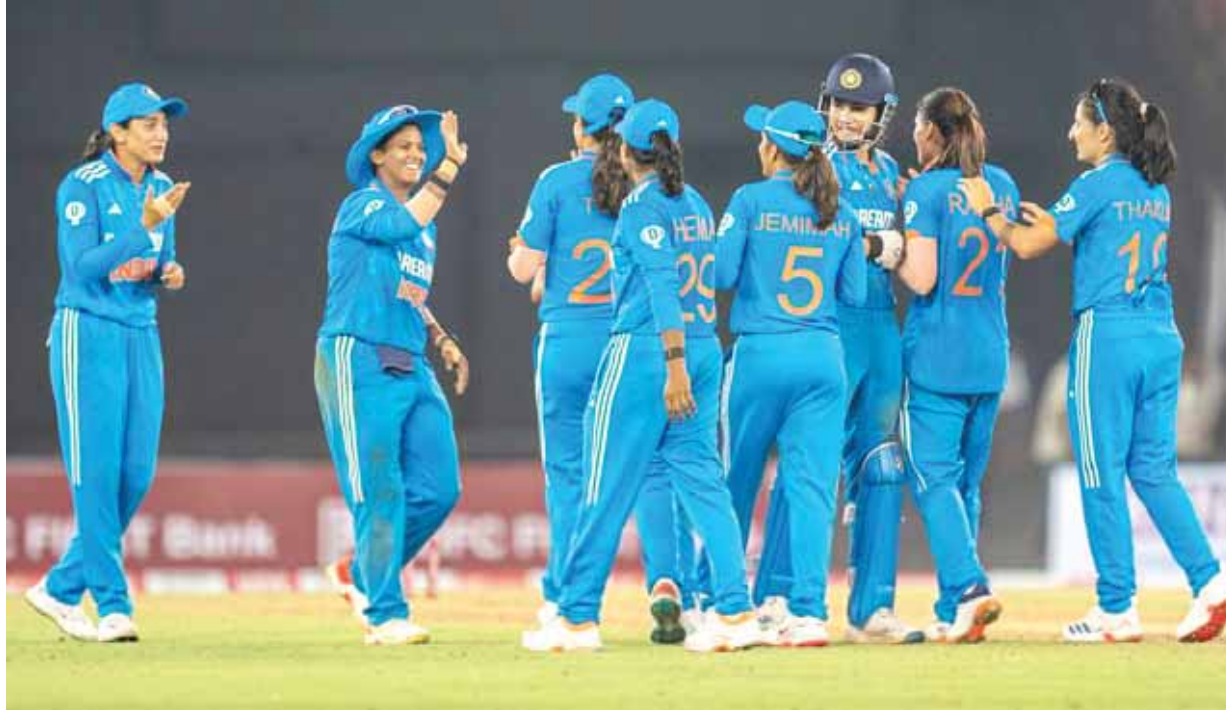
consistency this year. With much at stake, her captaincy and batting have come under scrutiny following India's early exit from the T20 World Cup. Additionally, she will face increased pressure after failing to score in double figures in the last ODI series against Australia. The likes of Jemimah Rodrigues and Deepti Sharma will also be keen to get big scores. The Indian team will miss

The series will give skipper Kaur and coach Amol Majumdar a perfect opportunity to bolster their preparations for the ODI World Cup at home next year. Australia will be without regular skipper Alyssa Healy, who is nursing a knee injury. Additionally, the hosts have not played in this format since March and will be aiming to shake off the rust. "(India) have got superstars ... Always hard-fought and crucial key moments in every game, and while we're at home we're expecting a lot of India support," Australia captain Tahlia McGrath said. For India, Smriti Mandhana will bear the responsibility of providing a solid start with the bat. Besides two single digit scores, the flamboyant opener has been in fine form this year, scoring 448 runs at an impressive average of around 75 in her last six ODIs. Kaur's form will be a significant concern for India, as she has struggled with