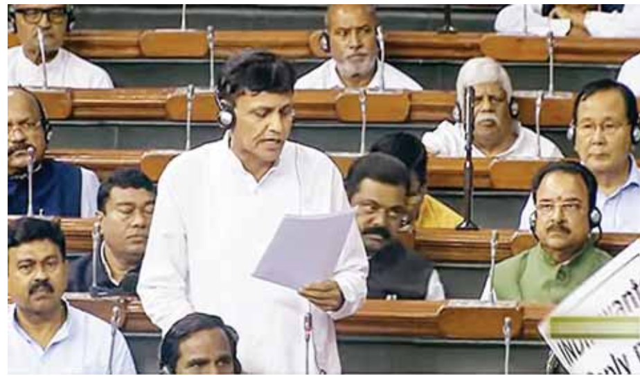
The data cited by the minister shows that 42,797 CAPF and AR personnel have availed 100 days' leave in a year between 2020 and October 2024. To a question on financial assistance provided to martyred CAPF and AR personnel through the Bharat Ke Veer portal, the minister said financial assistance of Rs 25 lakh in addition to other financial entitlements is being provided to next of kin (NoKs) of martyrs through the portal. "The Bharat Ke Veer Trust ensures that NoK of martyrs get a minimum of Rs one crore from all entitlements. Parents of married martyrs are also provided financial assistance of Rs. 10 Lakh from 'Bharat Ke Veer Trust', he said. The minister said the Bharat Ke Veer portal was launched in 2017 while the Bharat Ke Veer Trust was established in 2018 and 501 dependents of martyrs have been provided financial assistance from it so far.

Over one lakh positions are vacant in Central Armed Police Forces (CAPF) and Assam Rifles (AR), Rajya Sabha was informed on Wednesday. The total posted strength of CAPF and AR was 9,48,204 as on September 30, according to the Union Home Ministry data. Minister of State for Home Affairs Nityanand Rai said the government is taking steps to fill the vacancies expeditiously. It has created 71,231 new posts in the CAPFs and AR in the last five years, according to the data provided by Rai in a written response to a question. The minister said vacancies in CAPFs and AR arise on account of retirements, resignations, promotions, deaths, the raising of a new battalion, the creation of new posts, etc, and filling them up is a continuous process. The data showed that 1,00,204 posts are vacant in CAPFs