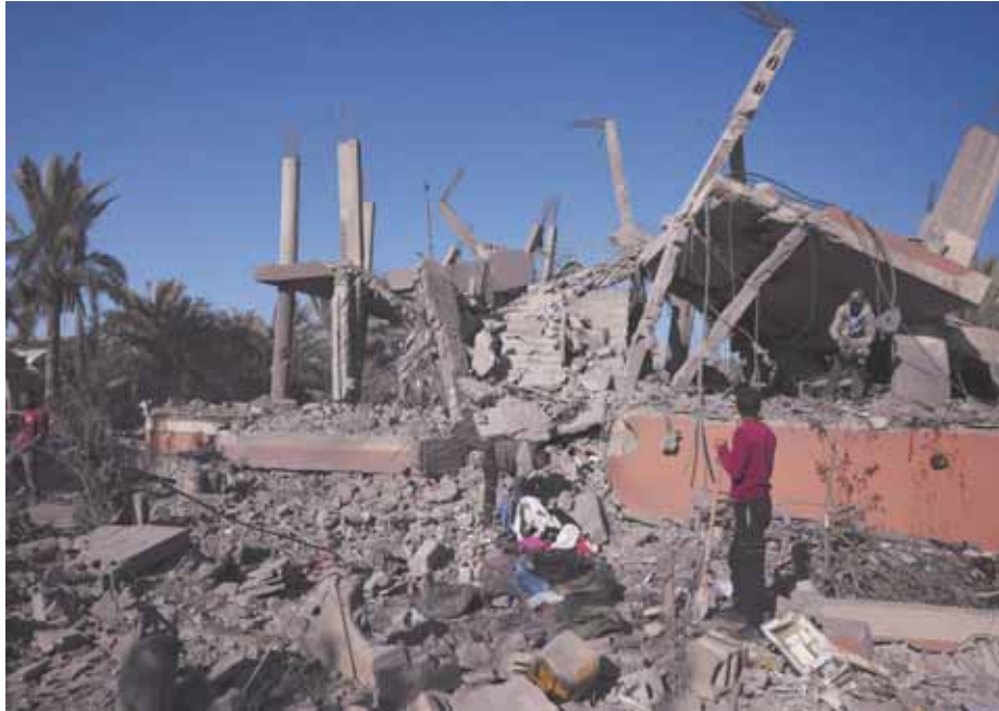
Palestinians check the rubble of a destroyed building following an overnight Israeli strike in Deir al-Balah, Gaza Strip, Wednesday.

Israel's blistering retaliatory offensive has killed at least 44,500 Palestinians, more than half of them women and children, according to Gaza's Health Ministry, which does not say how many of the dead were combatants. Israel says it has killed over 17,000 militants,