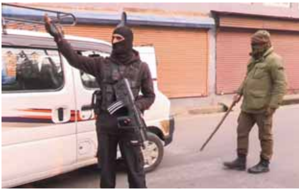
Security personnel stand guard on a road amid a joint operation by Indian Army and J and K Police. File photo