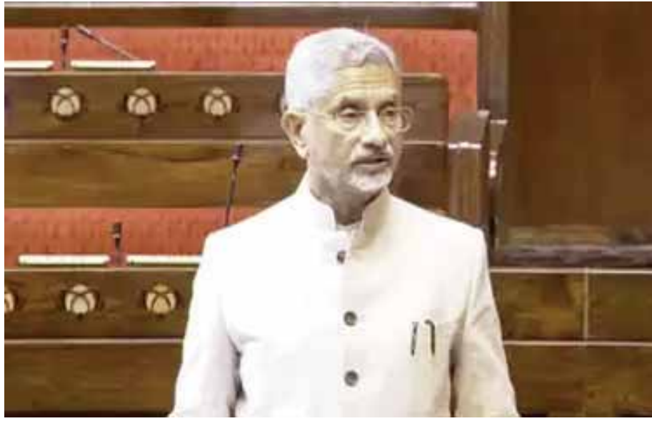
Jaishankar said disengagement has now been achieved in full in eastern Ladakh through a step-by-step process, culminating in Depsang and Demchok. He had earlier made an identical statement in the Lok Sabha on Tuesday.

said disengagement has now been achieved in full in eastern Ladakh through a step-by-step process, culminating in Depsang and Demchok. He had earlier made an identical statement in the Lok Sabha on Tuesday. Jaishankar, in his statement, said India was and remains very clear that the three key principles must be observed in all circumstances, he said explaining: "one: both sides should strictly respect and observe the Line of Actual Control (LAC), two: neither side should attempt to unilaterally alter the status quo, and three: agreements and understandings reached in the past must be fully abided by in their entirety". "Our relationship had progressed in many domains, but was obviously negatively affected by recent events. We are clear that the main-