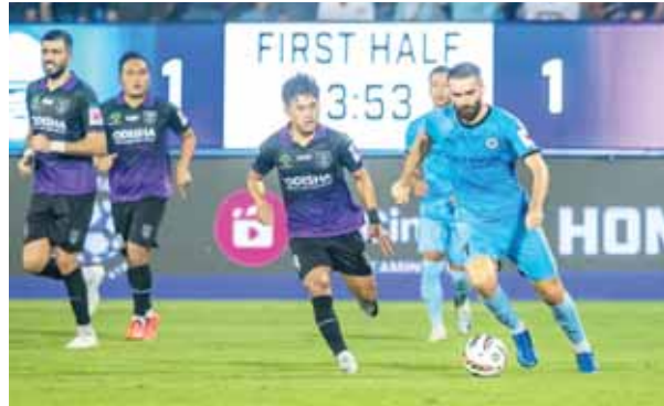
not just an incredible player but also a fantastic human being. "We'll miss him on the pitch, but I'm sure he'll continue to support us off it. He's one of the best professionals I've worked with, and I wish him a speedy recovery." Despite this loss, the team remains focused and ready for the challenges ahead. Mumbai have been unbeaten in its earlier six clashes versus Odisha, having been successful on four occasions and drawing twice. Only against FC Goa (13 games) and Chennaiyin FC (9 games) does the side have a

Coming on the back of successive wins, Odisha FC will look to maintain their winning momentum when they face a tricky Mumbai FC test in the Indian Super League here on Thursday. The Kalinga Warriors defeated former champions Bengaluru FC in their previous encounter to jump to third place in the ISL standings with 15 points from 10 matches as they would aim for a hat-trick of wins, while the Islanders would be keen to extend their unbeaten run against Odisha FC. Odisha have scored in each of their previous 10 home ISL contests, and a goal in this game will allow it to equal its record of scoring in 11 successive home fixtures, set between December 2019 and December 2022. The team faces a significant setback as their ace marksman Roy Krishna sidelined for the season due to injury. Confirming the news, head coach Sergio Lobera said, "It's sad news for the team. Roy is