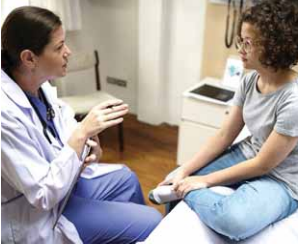
strong, friendly relationship with children helps them share their feelings without fear.

identify early signs of mental health problems in children provide guidance. Parenting is also a key factor in shaping a child's mental health. Parents should avoid unhealthy comparisons and ensure their children feel emotionally secure. Building a