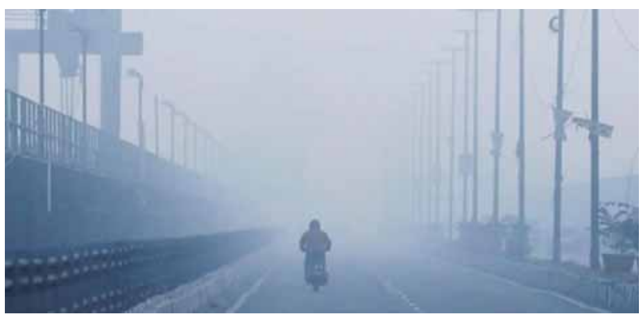
PNS NEW DELHI

India is set to experience a milder winter with fewer coldwave days, the weather office said on Monday and forecast above-normal minimum temperatures during the season.