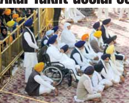
Sukhbir Singh Badal and other leaders of the previous SAD government during the hearing of 'tankhaiya' (guilty of religious misconduct) case by the Akal Takht