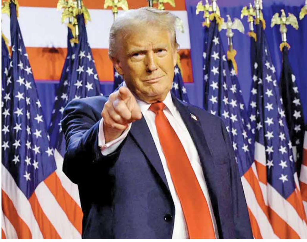
AP ■ WEST PALM BEACH (FL)

President-elect Donald Trump on Saturday threatened 100 per cent tariffs against a bloc of nine nations if they act to undermine the United States' dollar. His threat was directed at countries in the so-called BRIC alliance, which consists of Brazil, Russia, India, China, South Africa, Egypt, Ethiopia, Iran, and the United Arab Emirates. Turkey, Azerbaijan and Malaysia have applied to become members and several other countries have expressed interest in joining.