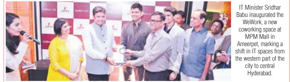
IT Minister Sridhar Babu inaugurated the WeWork, a new coworking space at MPM Mall in Ameerpet, marking a shift in IT spaces from the western part of the city to central Hyderabad.