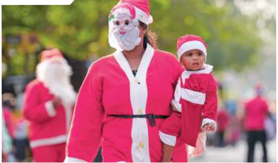
People dressed as Santa Claus during Christmas celebration, in Chennai