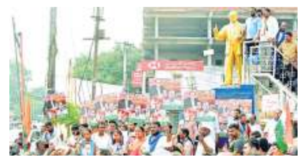
Congress party taking out a massive rally in Sangareddy on Saturday

Ambedkar, a world-renowned intellectual, played