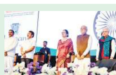
Governor Jishnu Dev Varma, along with Tourism Minister Jupally Krishna Rao seen at the First World Meditation Day at Gachibowli Stadium on Saturday

Her swift actions resulted in successfully freezing Rs 4,65,858 of the transferred amount, preventing a major loss for the victim. The Commissioner of Police, Hyderabad City, lauded Women Head Constable Dheena's efforts in recovering the funds. The Hyderabad City Police urged citizens to exercise caution against unsolicited calls, messages, or social media advertisements, especially those offering lucrative investments.