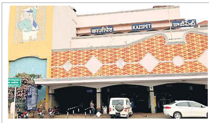
drop off passengers. In addition, waiting lounges and specially designated rooms for passengers travelling in air-conditioned coaches will be built. The construction of general wait-

Vehicles will be allowed to drive directly up to the station entrance to