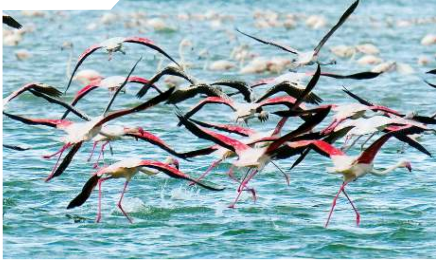
Flamingos at the Pulicat Lake with backwaters brimming to the full, near Sriharikota