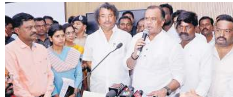
Minister for Roads and Buildings Komatireddy Venkat Reddy speaking to the media in Nalgonda on Thursday

Once completed, wet and dry garbage will be transported to the dumping yard near Manubothula Tank. The brick-making project will not only help manage waste but also generate revenue for the Panchayat.