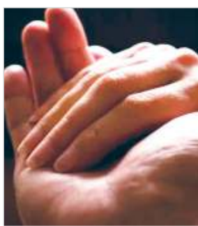
joy and pain alike will forever remain with me. I also recall the happy gurgling sounds of my younger cousins as I patted or tickled them.

We have read the story of five blind men and the elephant. Each man touched a part and described the animal differently. They would have correctly visualised the pachyderm if they also had sight. There is no denying that all five senses combined define how we live from birth to death. The absence of any will make us feel incomplete. Touch is probably foremost. Scientists say touch is the first of the senses we develop. It is not a single feeling. It consists of several distinct sensations communicated to the brain through neurons in the skin. Touch plays an important role in shaping us. It also conveys compassion from one human to another.