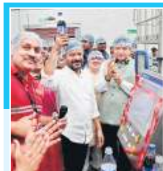
Chief Minister Revanth Reddy inaugurating a nursing college