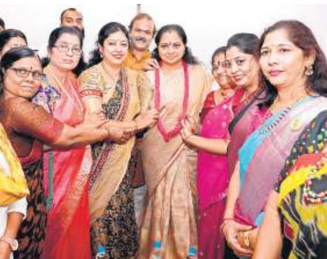
advising them to expose the Congress government's failures and broken promises. "In tough times, those who stand with the party prove to be its true strength," she emphasised.

She highlighted the establishment of a legal team by the BRS to fight back against false cases filed against its workers. "Harassment of BRS workers won't be tolerated. We stood strong during the Telangana Movement, and we'll stand strong now," she declared. Kavitha urged BRS workers to prepare for the upcoming local body elections,