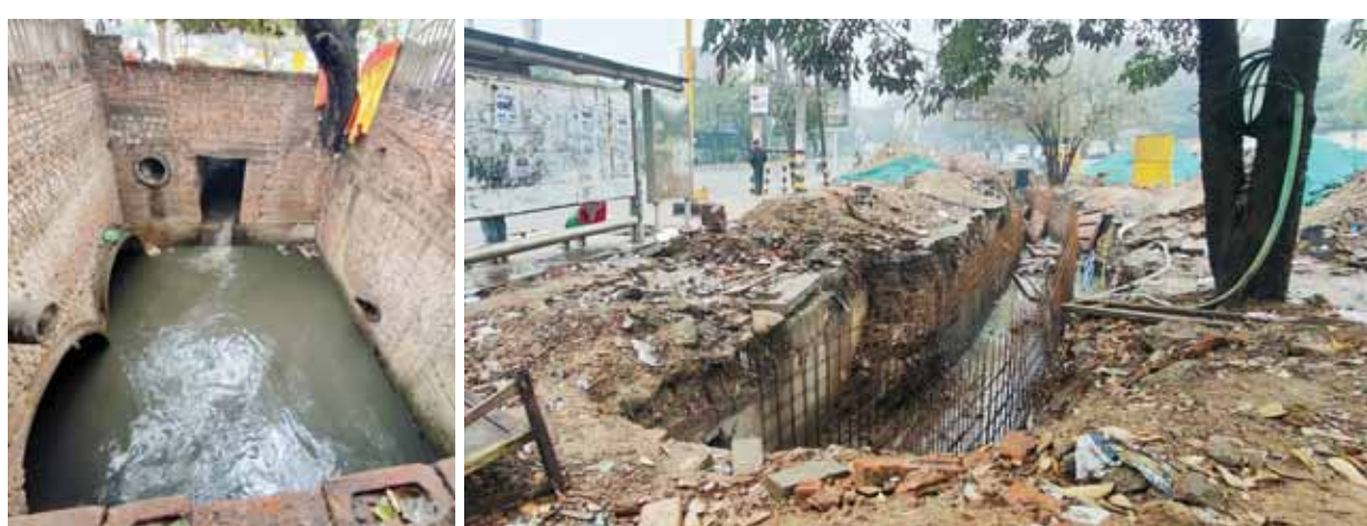
A dug up drain and an open drain near the Saket metro station