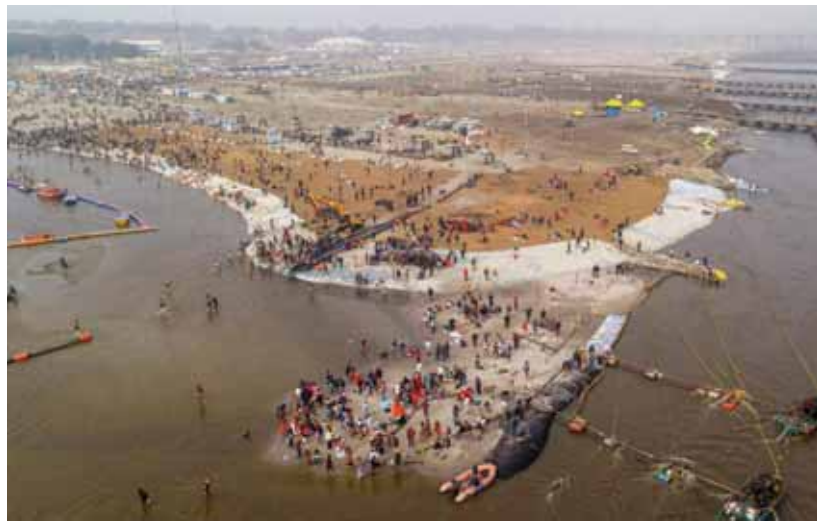
An aerial view of Sangam, the confluence of the Ganga and Yamuna rivers, area ahead of the Mahakumbh 2025.

"Special provisions have been made for international visitors with multilingual signages and cultural programmes showcasing India's diversity. Through these comprehensive efforts, Mahakumbh 2025 aims to be not just a religious gathering but a global celebration of spirituality, culture, safety, sustainability and modernity," the statement said. 'Mahakumbh Nagar' is being transformed into a temporary city with thousands of tents and shelters, including super deluxe accommodations like the IRCTC's "Mahakumbh Gram" luxury tent city which offers deluxe tents and villas with modern amenities, the ministry added. According to the statement, renovation of 92 roads and beautification of 17 major roads are nearing completion. The construction of 30 pontoon bridges using 3,308 pontoons is underway and 28 are already operational. A total of 800 multilingual signages (Hindi, English and regional languages) are being installed to guide the visitors, the ministry said. "Over 400 have been