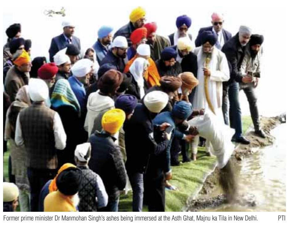
Former prime minister Dr Manmohan Singh's ashes being immersed at the Asth Ghat, Majnu ka Tila in New Delhi.

across six districts of Jammu region namely Jammu, Udhampur, Kathua, Doda, Poonch and Rajouri. In the Kashmir Valley, security forces neutralised foreign terrorists in districts such as Baramulla, Bandipora, Kupwara, and Kulgam. Maximum number of 14 terrorists were killed across nine encounters in the Baramulla district. The numbers reportedly indicate a significant decline in the presence of local terrorists operating in Jammu and Kashmir, leaving mainly Pakistani terrorists active in the region.