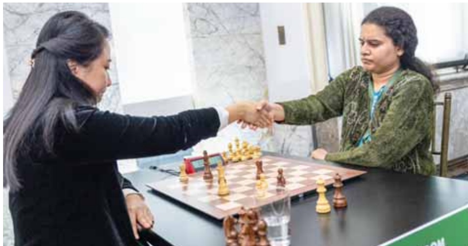
India's Koneru Humpy (R) during a match at the FIDE World Rapid Chess Championship, in New York

India's Koneru Humpy bagged an epochal second World Rapid Chess Championship title, beating Irene Sukandar of Indonesia here on Sunday. Humpy had won the event back in 2019 at Georgia and the Indian No 1 is only the second player after China's Ju Wenjun to clinch the title more than once. The 37-year-old Humpy finished the tournament with 8.5 out of 11 points. "I'm very excited and I feel very happy. In fact, I expected it to be a very tough day, like some sort of tie-break. But when I finished the game, I only got to know when the arbitrator told me, and it was a tense moment for me," said Humpy, who began with