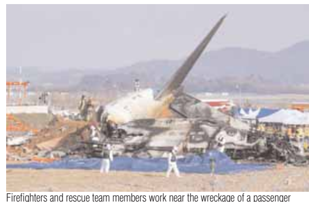
Firefighters and rescue team members work near the wreckage of a passenger plane at Muan International Airport in Muan, South Korea