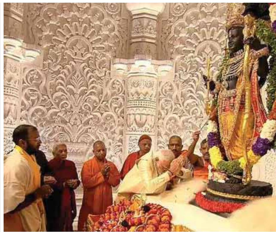
The ceremonial installation of Lord Ram's idol in Ayodhya's temple positioned UP as a symbol of cultural and spiritual significance.

days for their first year of employment were not being fully counted. "For instance, employees whose date of joining falls after May and before December would not meet the 240-day service requirement for their first calendar year of service, thus affecting their job security," it said. "In addition, for the year 2024, employees raised concerns as the number of days until the cut-off date of August 15, 2024, is only 227, which falls short of the required 240 days," it added. In response to these requests, the Haryana Cabinet has approved the amendment to consider 240 days of service during a period of one year of contractual service, thereby addressing these issues and ensuring better job security for contractual employees, it said. Under the Haryana Contractual Employees (Security of Service) Act, 2024, the benefit of job security is admissible to those contractual employees who fulfil the five years contractual service between August 15, 2024, the statement added.