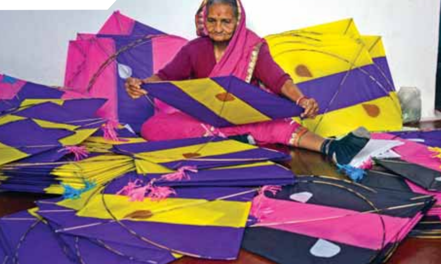
An elderly woman makes kites for the upcoming Makar Sankranti kite festival, in Hyderabad