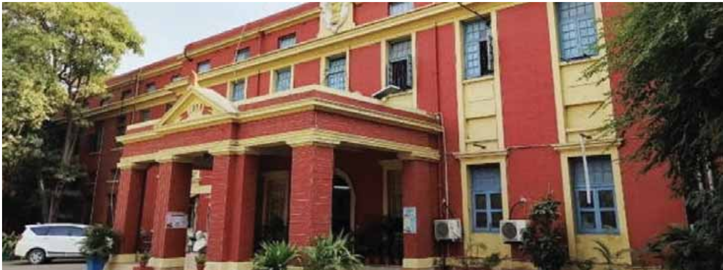
The headquarters of Danapur Division of the Indian Railways, at Khagaul, near Patna.

The historic Danapur division of the Indian Railways network that manages some of the lines and stations originally set up nearly 160 years ago will complete an eventful journey of 100 years on January 1. The division has planned a grand celebration on January 31 at the old Jagjivan Stadium where it will also host an exhibition showcasing its rich history through archival documents, photographs and railway artefacts. We are also working on a coffee table book on the centenary of the Danapur division. Besides going through our old documents and photographs kept in different departments at the DRM office, we are also trying to crowd-source relevant material for the book," said a senior Railway Ministry official of the Danapur division. Danapur (earlier Dinapore) division was established on January 1, 1925. Its office is located in a majestic building erected in