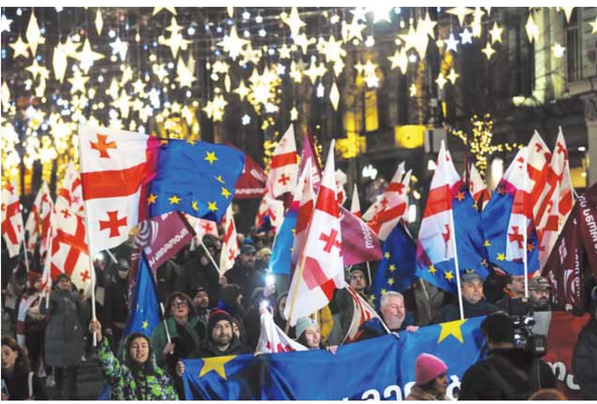
Demonstrators with Georgian national and EU flags march during an anti-government rally outside the Parliament building in Tbilisi, Georgia, on Saturday.

to a ceasefire and hostage release with Hamas. Families of the hostages and their supporters have held weekly mass demonstrations for months, and diplomats have reported recent progress in the long-running indirect talks. Strike on a hospital in Gaza City kills 7: An Israeli strike on the upper floor of a hospital in Gaza City on Sunday killed at least seven people and wounded several others, according to the Civil Defense, first responders affiliated with the Hamas-run government. The Israeli military said it struck a Hamas control centre inside the building, which it said was no longer serving as a hospital. Israel's offensive has killed over 45,000 Palestinians and wounded more than 1,00,000, according to local health authorities. They say women and children make up more than half the fatalities but do not distinguish between militants and civilians in their count. Israel says it has killed over 17,000 militants, without providing evidence. Israel's bombardment and ground operations have displaced some 90 per cent of Gaza's population of 2.3 million people, often multiple times. Vast areas of the territory, including entire neighbourhoods, have been pounded to ruins, and critical infrastructure has been destroyed. Israeli restrictions, ongoing fighting and the breakdown of law and order have hindered the delivery of humanitarian aid, raising fears of famine, while widespread hunger has left people at greater risk of disease and death.