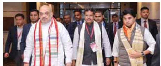
Home Minister Amit Shah with Union Minister for Development of North Eastern Region (DoNER) Jyotiraditya Scindia and Tripura Chief Minister Manik Saha at the 'Bankers Conclave' organised as part of the North Eastern Council, in Agartala.