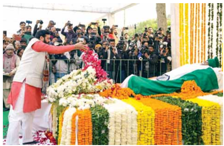
Haryana Chief Minister Nayab Saini pays last respect to the mortal remains of former Haryana chief minister Om Prakash Chautala during his last rites at Teja Khera farmhouse, in Sirsa.