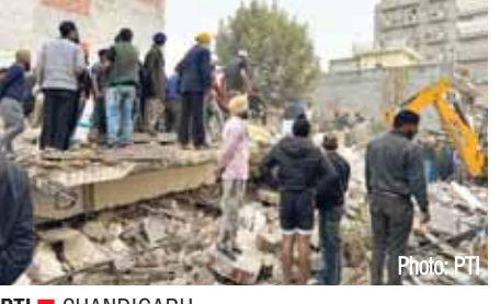
PTI ■ CHANDIGARH

Rescue operations were underway after a multistorey building collapsed in the Sohana village of Punjab's Mohali district on Saturday, officials said. Locals said some people were feared trapped under the debris. The district authorities launched a rescue operation. Two excavators were pressed into