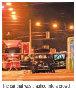
The car that was crashed into a crowd at the Magdeburg

movement showing little growth, however after the pandemic, even the high months i.e. April-May are at a distinctly lower level as compared to the corresponding period before the pandemic, passenger levels for May 2023 being 6.67 per cent lower than the corresponding number for May 2012. Further, it is interesting to note that a majority (>75%) of our predicted migration flows are within 500 kms of the origin. This is in line with gravitation effects and theories such as Ravenstein's Theory of Human Migration (1834 - 1913)," it said. "We hypothesize that this is on account of availability of improved services such as education, health, infrastructure and connectivity as well as improved economic opportunities in or near in major sources of migration and is an indicator of overall economic growth," noted the paper authored by former EAC-PM chairman Bibek Debroy. Continued on page 2