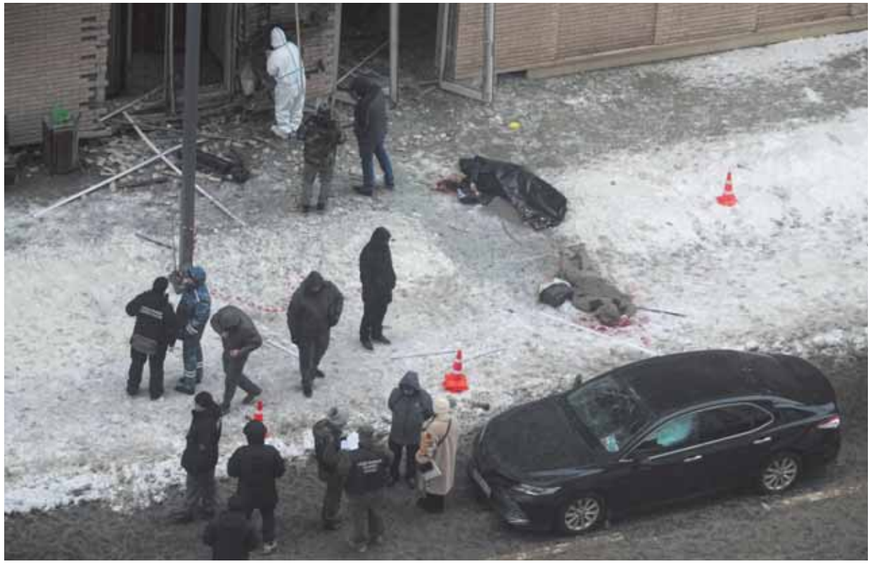
Investigators work at the place where Lt. General Igor Kirillov, the head of Russia's Nuclear, Biological, and Chemical Defence Forces and his assistant were killed by an explosive device planted close to a residential apartment's block in Moscow on Tuesday

Darya Dugina, a commentator on Russian TV channels and the daughter of Kremlin-linked nationalist ideologue Alexander Dugin, died in a