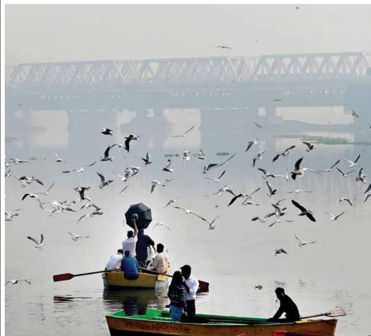
Hundreds of seagulls fly over the Yamuna River on a Tuesday morning.

conventional fans, BLDC fans consume 40-45 watts less power, saving approximately 96 units of electricity per fan annually. "This translates to monetary savings of Rs 950 to Rs 1100 per fan each year," the Chief Minister said. She added, "5-Star Rated ACs save between 2800 and 3042 units of electricity annually compared to regular ACs, resulting in savings of Rs 27,000 to Rs 29,000 per AC each year." "The primary objective of this initiative is to curb the rising demand for electricity and promote energy efficiency. This summer, Delhi's peak electricity demand reached 8656 MW, a significant increase from 7438 MW the previous year," a statement by the party said. "Government buildings, being major electricity consumers, will play a key role in achieving these goals through the efficient use of energy-saving appliances. This step marks a critical contribution to addressing growing energy demands while fostering environmental sustainability," it added.