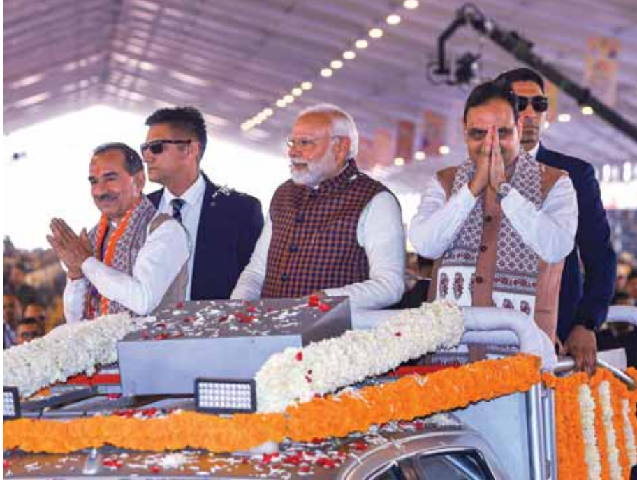
PM Narendra Modi with Rajasthan CM Bhajanlal Sharma during the 'Ek Varsh-Parinaam Utkarsh' event.