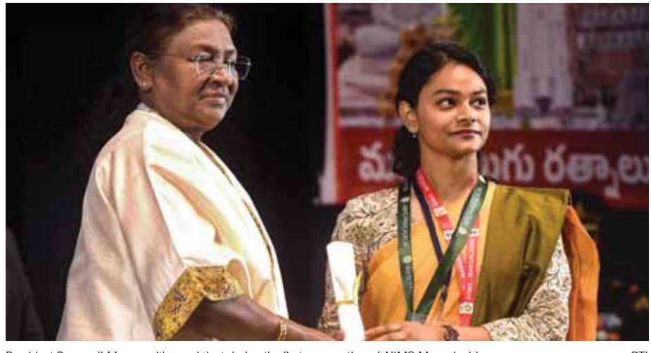
President Droupadi Murmu with a recipient during the first convocation of AIIMS Mangalagiri.