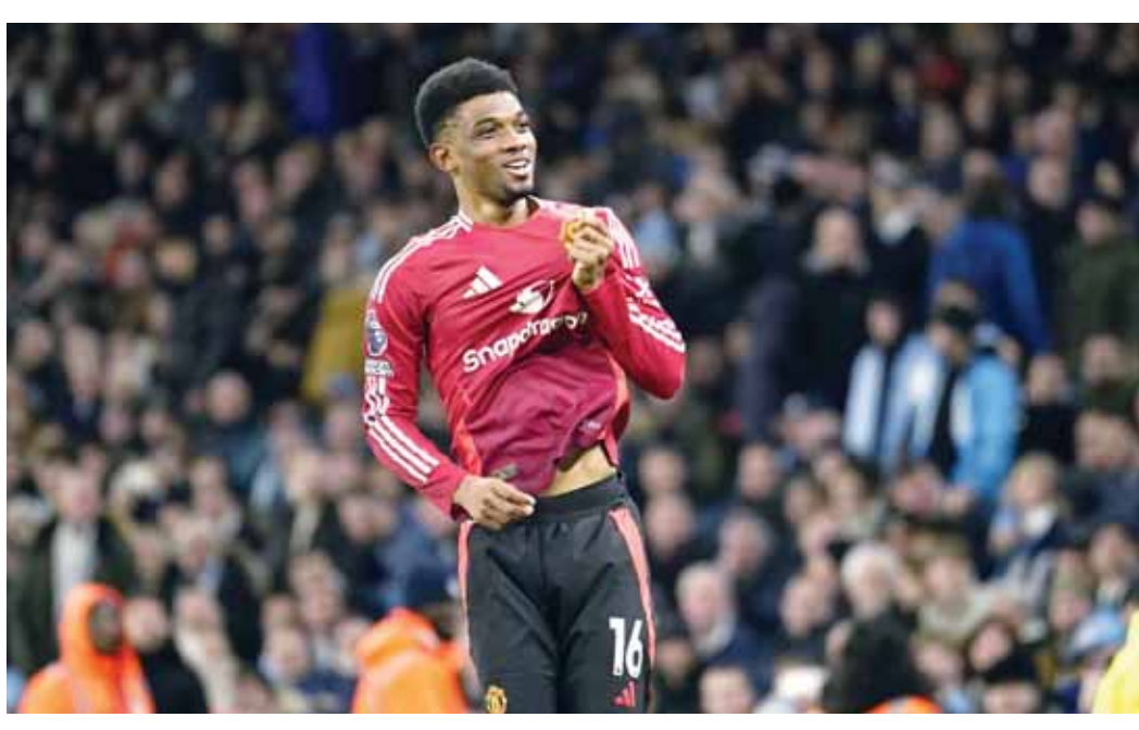
United is 13th and five points behind fifth-place City, which has seen its title defense unravel during its losing run. “This is a big club and in a big club when you lose eight in 10 (11) something wrong is happening,” Guardiola said.

simple as that,” Guardiola said. It was a first derby victory for new United head coach Ruben Amorim, who led Sporting Lisbon to a 4-1 win against City in one of his last games in charge of the Portuguese club in November. But for a long time it looked like being a third-straight league loss for United after Josko Gvardiol’s headed goal in the 36th. Fernandes was guilty of missing the target when through on goal in the second half and United struggled to create chances against a City team that rarely looked like adding to its lead. But in a dramatic end to the match, Diallo raced after an underhit backpass from Matheus Nunes. Nunes then brought down the United forward in the box and referee Anthony Taylor pointed to the penalty spot. Fernandes made no mistake this time — sending Ederson the wrong way. Moments later, Diallo ran onto a long pass from Lisandro Martinez, flicked the ball high and past Ederson before rolling it