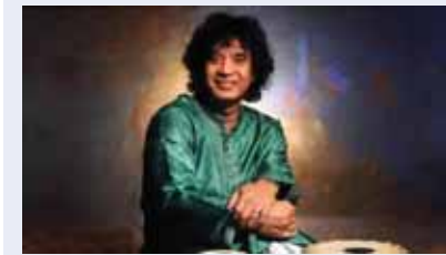
Tabla maestro Zakir Hussain passes away

The four-time Grammy Award winner, Indian tabla maestro and an innovative music fusion creator, Zakir Hussain is no more with us. The silence on his tabla is a huge loss for Hindustani classical music and jazz fusion. Zakir was truly an indelible gem in the world of music. The list of his national and international accolades is really long, as he had always made India proud with his tireless contribution in