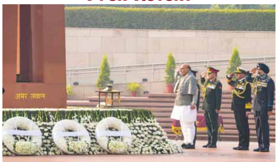
Union Defence Minister Rajnath Singh pays homage at the National War Memorial on the occasion of Vijay Diwas, marking India's victory in the 1971 Bangladesh liberation war. Chief of Defence Staff (CDS) Gen Anil Chauhan, Chief of Army Staff Gen. Manoj Pande, Navy Chief Admiral Dinesh K Tripathi and IAF Chief Air Chief Marshal AP Singh are also seen