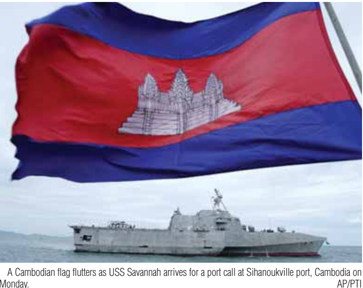
A Cambodian flag flutters as USS Savannah arrives for a port call at Sihanoukville port, Cambodia on Monday.

call will include "a working meeting with the commander of the Ream Naval Base," as well as meetings with provincial officials and "a friendship sports competition between the crews of the US Navy and the Cambodian Navy."