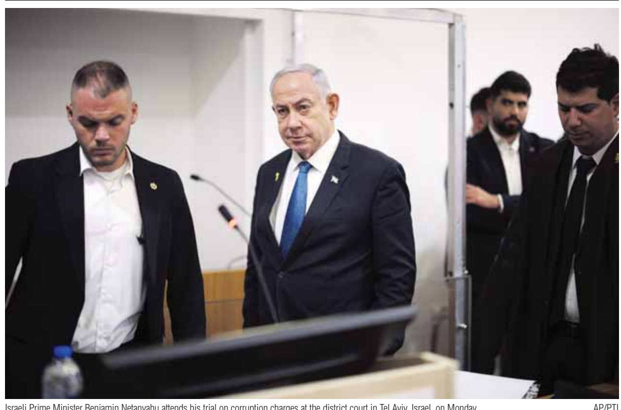
Israeli Prime Minister Benjamin Netanyahu attends his trial on corruption charges at the district court in Tel Aviv, Israel, on Monday.

face, dozens more people came forward with claims of suspected losses that the bank is working to verify, it said. The MUFG case is the second recent one involving criminal activity at a major Japanese financial institution. In November, Nomura Holdings acknowledged that a former employee had been arrested on suspicion of robbery, attempted murder and arson targeting a client in Hiroshima. Asked about the MUFG thefts, the chief government spokesman said Monday that banking operations require high levels of trust and a sense of public service. The case was "extremely regrettable," said Chief Cabinet Secretary Yoshimasa Hayashi.