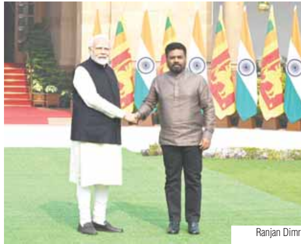
Rameshwaram and Talaimanar to boost connectivity between the two nations.

India and Sri Lanka on Monday here adopted a futuristic vision to expand their partnership, resolved to soon conclude a defence cooperation pact and decided to ramp up energy ties by establishing electricity grid connectivity and multi-product petroleum pipelines. The decisions were taken during wide-ranging talks between Prime Minister Narendra Modi and Sri Lankan President Anura Kumara Dissanayaka. Modi said both sides decided to emphasise investment-led growth and connectivity for the India-Sri Lanka economic partnership, and it was decided that physical, digital and energy connectivity will be key pillars of the cooperation. Work will be done to establish electricity grid connectivity and multi-product petroleum pipelines, Modi said, adding India will supply liquefied natural gas to the island nation's power plants. The prime minister also announced that a ferry service will be started between