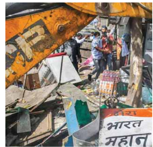
A bulldozer being used to demolish unauthorised structures in Jahangirpuri earlier this year.

of NCT of Delhi." Dealing with every report on a separate file, the LG has uniformly noted that, "The CAG reports are vital to assess the financial and administrative health of Government in a democratic set up. These Reports are the touchstone of transparency in governance. Adherence to the constitutional mandate of placing such reports on the Table of the Legislature from time to time expeditiously is an essential ingredient of a functional democracy to ensure full disclosure and to seek guidance of the Apex Legislative Body for taking course corrections where necessary."