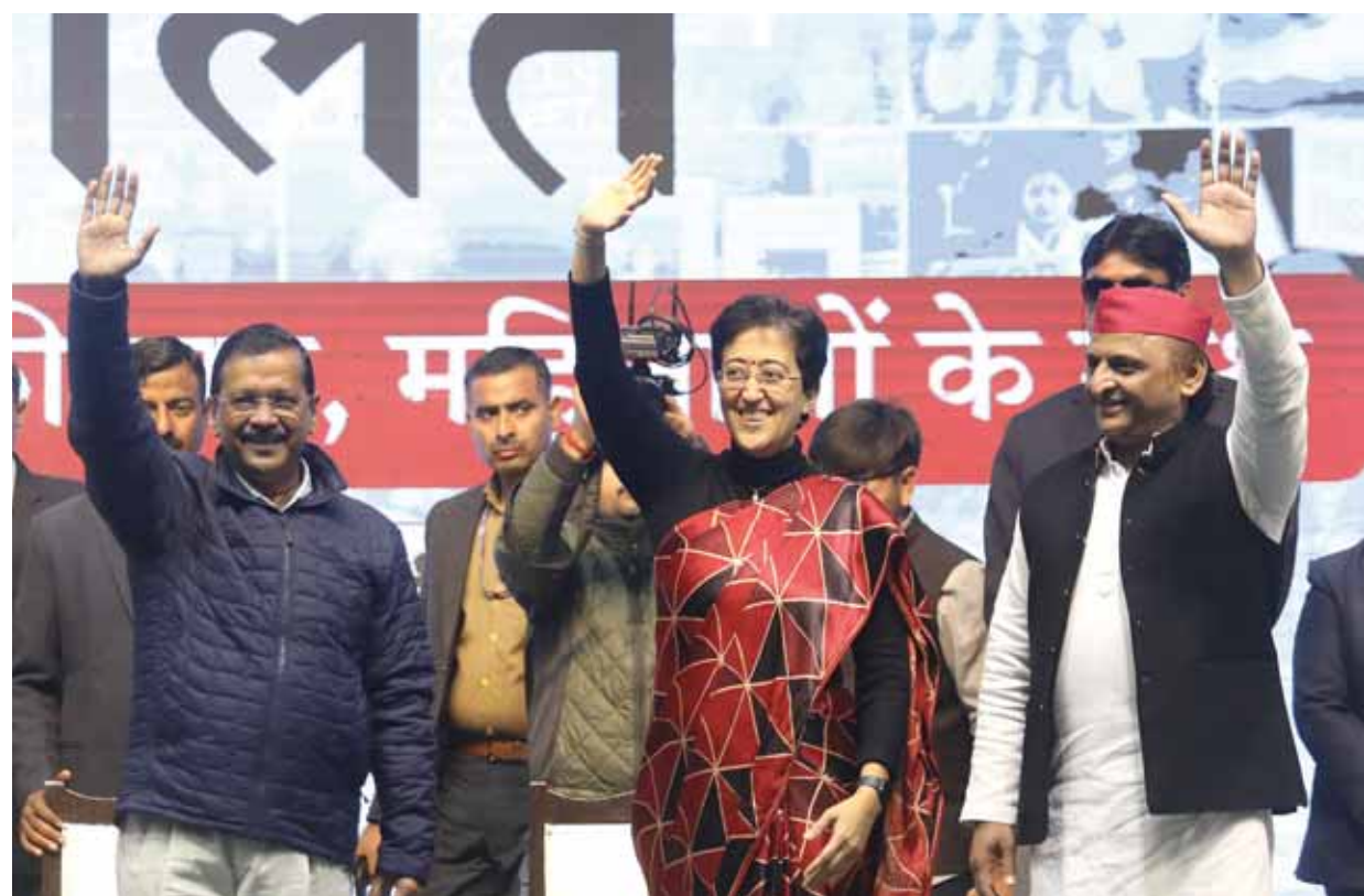
Delhi Chief Minister Atishi with Arvind Kejriwal and Samajwadi Party president Akhilesh Yadav during the Mahila Adalat.