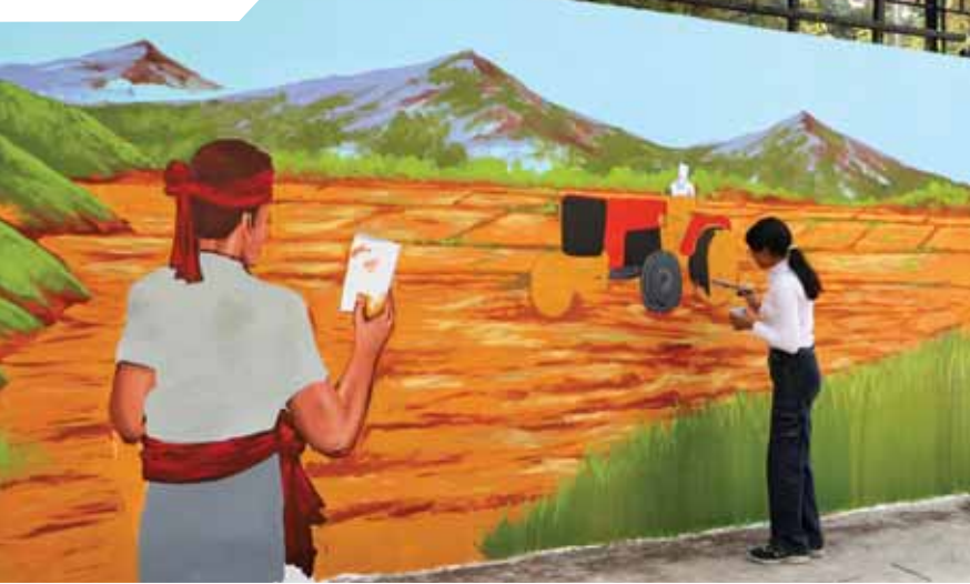
An artist paints a wall at Lodhi Road area, in New Delhi