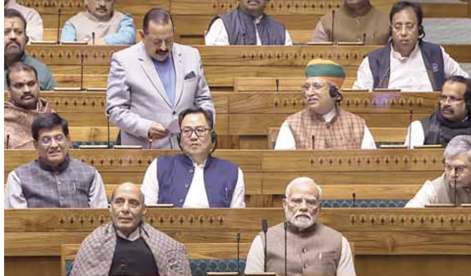
Prime Minister Narendra Modi with Defence Minister Rajnath Singh and others in the Lok Sabha during the Winter session of Parliament, in New Delhi

Parliament continued to be a battle-field virtually for the political parties on eleventh consecutive day on Wednesday as both ruling and Opposition benches trade charges against each other blaming neither of them are allowing smooth functioning of the Winter Session. With a brief functioning of the Lok Sabha which passed a bill to amend Railway Laws, Bharatiya Janata Party (BJP) led National Democratic Alliance (NDA) parties of the Treasury bench were at par with the Congress led Opposition INDIA Bloc in sloganeering in and out of the Lok Sabha and Rajya Sabha causing disruptions in both the Houses which ultimately led to adjournment of the day. Congress-led INDIA Bloc and BJP soon after the adjournments held Presser to flag concerns over non functioning of the Winter Session. Parliament proceedings were washed out in the first week of the winter session starting November 25 due to protests by Opposition members demanding discussion on issues like the indictment of industrialist Gautam Adani in a United States court and Sambhal violence and since last week, the ruling BJP MPs have been raising the issue of alleged nexus between Soros and the Congress posing a threat to national security. While several Opposition members alleged Rajya Sabha Chairman Jagdeep Dhankhar's "partisan" conduct which prompted them to move a