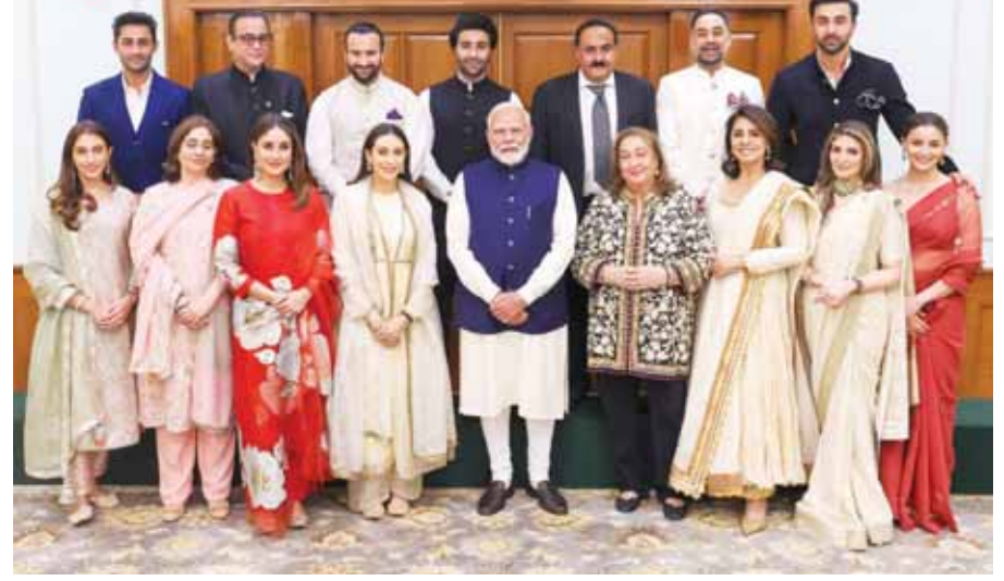
Prime Minister Narendra Modi with the members of Raj Kapoor's family, in New Delhi. The entire Kapoor family, including Ranbir Kapoor, Alia Bhatt, Neetu Singh, Kareena Kapoor Khan, Saif Ali Khan, Karisma Kapoor and others met Prime Minister Modi and invited him to the Raj Kapoor Film Festival to be organised to commemorate the 100th birth anniversary of the legendary actor-filmmaker