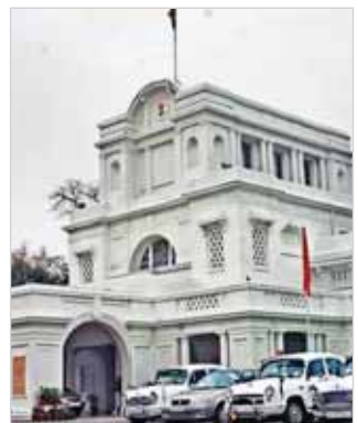
Monkeys huddle together on a chilly day, in New Delhi