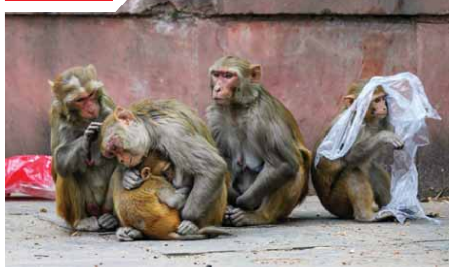
Monkeys huddle together on a chilly day, in New Delhi