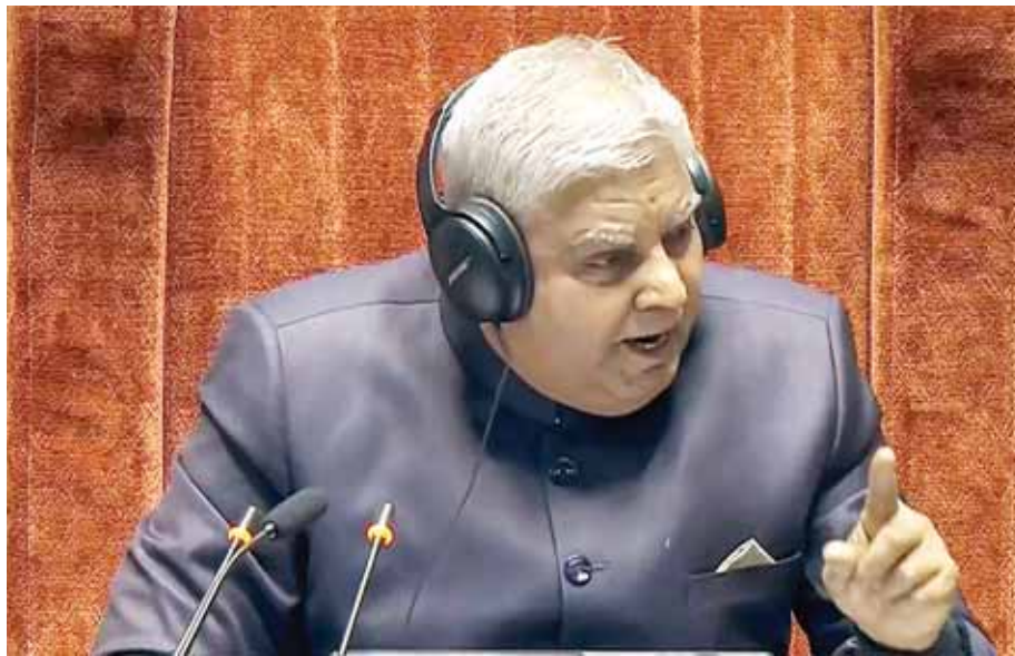
the opposition INDIA bloc in Maharashtra to move the Supreme Court over allegations of manipulation of electronic voting machines (EVMs) in the state assembly elections held recently, saying it shows they do not have any respect for the Constitution. Addressing a press conference at the BJP headquarters, BJP MP and national spokesper-