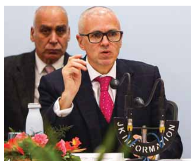
Jammu and Kashmir Chief Minister Omar Abdullah during an interaction with members of the civil society at his official residence.

Sambalpur (Rs 17.79 crore), Tata Steel Ltd, Kalinganagar (Rs 16 crore), and Vedanta Ltd, Lanjigarh (Rs 10.13 crore) were also exempted by the Odisha government, he informed. According to data provided by the engineer-in-chief-cum-principal chief electrical inspector, power dues worth Rs 1096.32 crore were pending against 23 industries as of October this year, Singh Deo added. The largest outstanding amount of Rs 285.02 crore is pending from Jindal India Thermal Power Ltd, Talcher in Angul district, followed by Visa Steel Ltd, Jajpur, which has not paid Rs 246 crore in electricity dues, he stated. Similarly, Dhenkanal-based GMR Kamalanga Energy Ltd, Maithan Ispat Nigam Ltd, Jajpur, and Shyam Metalics & Energy Ltd, Sambalpur have not paid power bills of Rs 179.35 crore, Rs 85.31 crore, and Rs 83.25 crore, respectively.