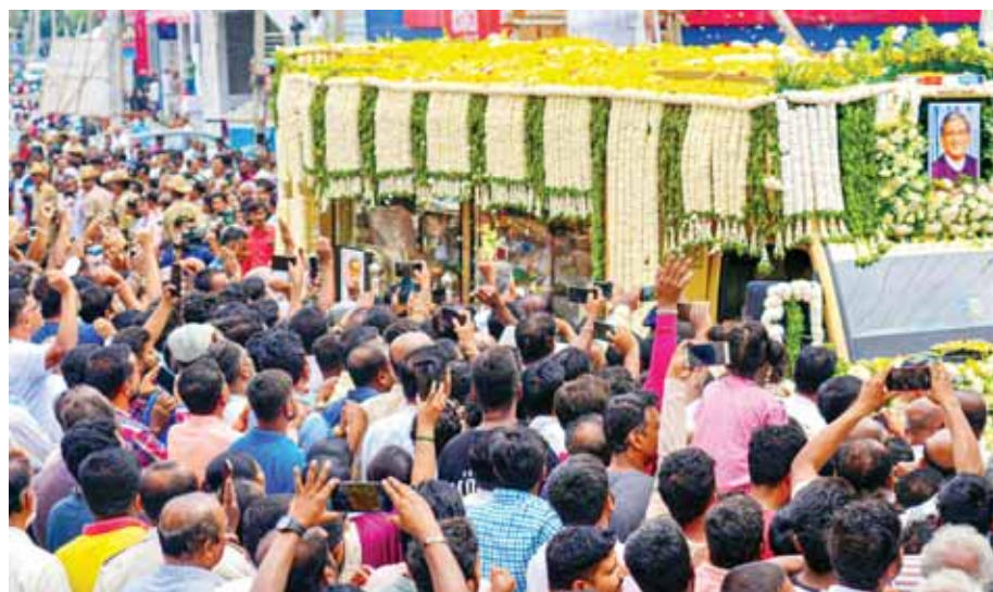
People pay their last respects as mortal remains of former union minister SM Krishna are being taken to his hometown, in Bengaluru.