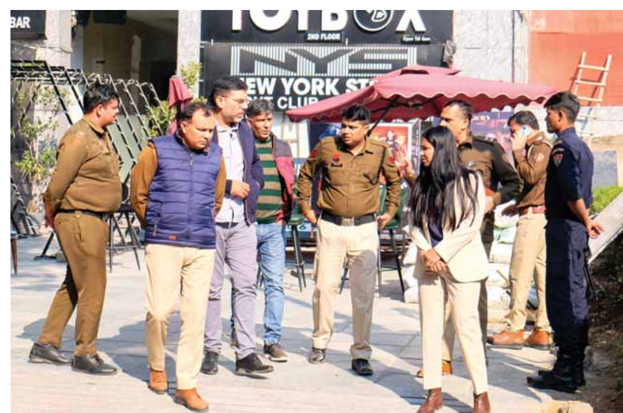
Police personnel investigate at the spot after a low-intensity explosion occurred outside a night club, in Gurugram.