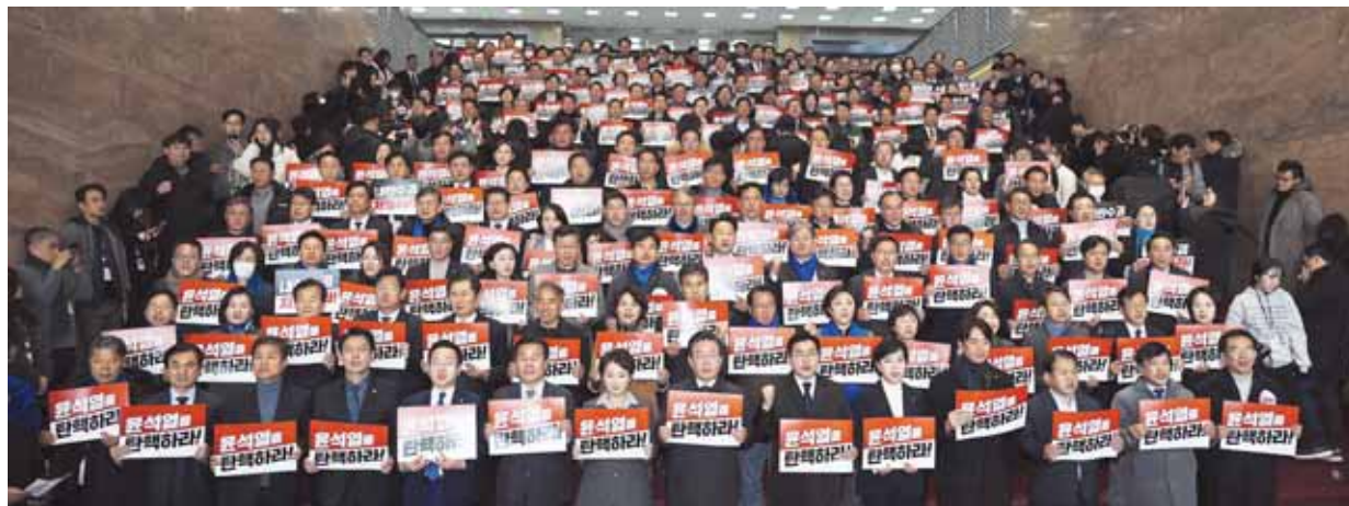
South Korea's main opposition Democratic Party leader Lee Jae-myung, bottom centre, and his party members stage a rally to denounce President Yoon Suk Yeol's apology over Tuesday's martial law declaration at the National Assembly in Seoul on Saturday. The signs read, 'Punish'.

sparked alarm among key diplomatic partners like the US and Japan. Tuesday night saw special forces troops encircling the parliament building and army helicopters hovering over it, but the military withdrew after the National Assembly unanimously voted to overturn the decree, forcing Yoon to lift it before daybreak Wednesday. The declaration of martial law was the first of its kind in more than 40 years in South Korea. Eighteen lawmakers from the ruling party voted to reject Yoon's martial law decree along with opposition lawmakers. Yoon's speech fuelled speculation that he and his party may push for a constitutional amendment to shorten his term, instead of accepting impeachment, as a way to ease public anger over the martial law and facilitate Yoon's early exit from office. Lee Jae-myung, the leader of the main liberal opposition Democratic Party, told reporters that Yoon's speech was "greatly disappointing" and that the only way forward is his immediate resignation or impeachment. His party called Yoon's martial law "unconstitutional, illegal rebellion or coup." The passage of Yoon's impeachment motion appeared more likely Friday when the chair of Yoon's party called for his