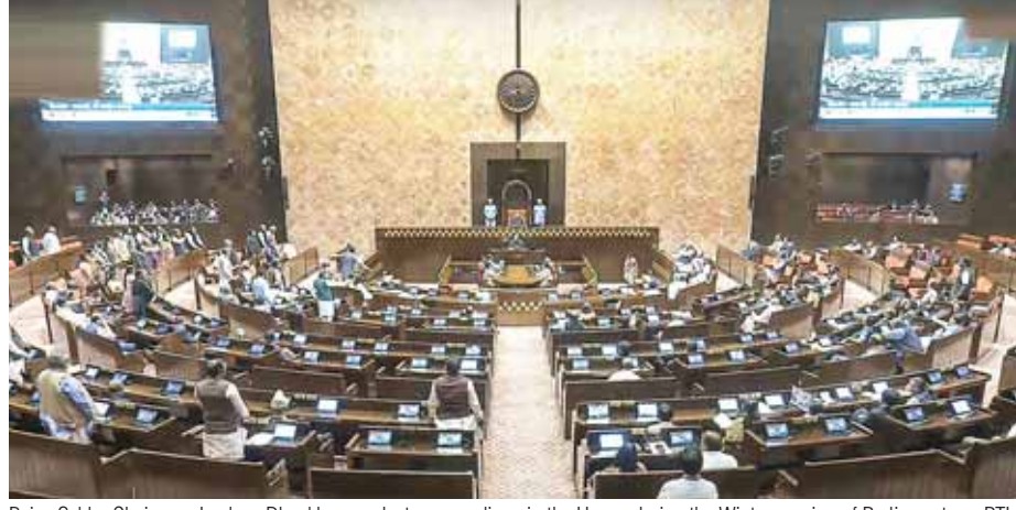
Rajya Sabha Chairman Jagdeep Dhankhar conducts proceedings in the House during the Winter session of Parliament

A wad of currency notes found near the seat allotted to Congress leader and eminent lawyer Abhishek Singhvi in the Rajya Sabha rocked the Upper House on Friday, with the Opposition, and ruling alliance Member of Parliament demanding a probe into the 'security lapse'. An investigation has been ordered in accordance with practice by Chairman Jagdeep Dhankhar. "It was my duty and I'm obliged to inform the House. This is a routine anti-sabotage check which takes place," Dhankhar said. Dhankhar added that he was expecting someone would claim the currency notes, but no one has so far. "Does it reflect the state of the economy that people can afford to forget it," he posed. Soon after the official papers were laid on the table in the morning, Dhankhar said security staff had recovered a wad of Rs 500 notes from the seat allotted to Congress MP Abhishek Manu Singhvi, leading to an uproar in the House. While Leader of Opposition Mallikarjun Kharge said the Chairman should not have named the member without an investigation being completed, Leader of the House JP Nadda accused the Opposition of showing eagerness on "some issues" while wanting to cover up other issues. Singhvi Friday termed the "recovery" of cash from his