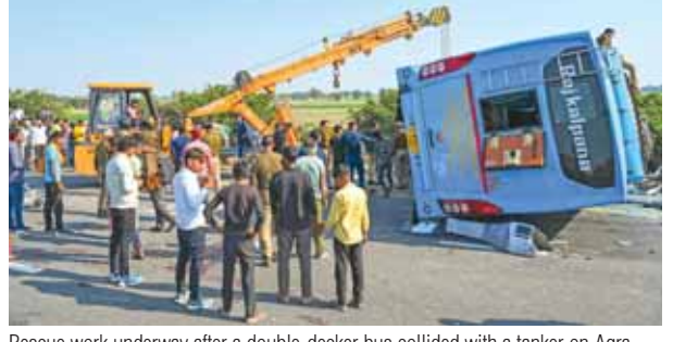
Rescue work underway after a double-decker bus collided with a tanker on Agra-Lucknow Expressway, in Kannauj district, Uttar Pradesh. At least six people were killed and 40 others suffered injuries, according to officials

The Union Cabinet approved the 26.463-km Rithala-Kundli corridor of the Delhi Metro's Phase-IV project on Friday, which will further enhance connectivity between the National Capital and neighbouring Haryana. The entire stretch will comprise 21 stations, all of them elevated. Addressing a press conference, Union Minister Ashwini Vaishnav said the project is scheduled to be completed in four years from the date of its sanction. This line will be an extension of the operational Shaheed Sthal (New Bus Adda) - Rithala (Red Line) corridor and will boost connectivity in the northwestern parts of Delhi, such as Narela, Bawana and parts of Rohini. The Cabinet meeting chaired by Prime Minister Narendra Modi allotted Rs. 6230 Crore for the completion of the project. "The completion cost of the project is Rs. 6,230 Crore and is to be implemented Delhi Metro Rail Corporation Limited (DMRC) the existing 50:50 Special Purpose Vehicle (SPV) of the Government of India (GoI) and Government of National Capital Territory of Delhi (GNCTD) in four years," said the statement, detailing the Delhi Metro's new project. This line will be an extension of the presently operational Shaheed Sthal (New Bus Adda) - Rithala (Red Line) corridor and will boost connectivity in the north western parts of the national capital in areas such as Narela, Bawana, parts of Rohini etc.