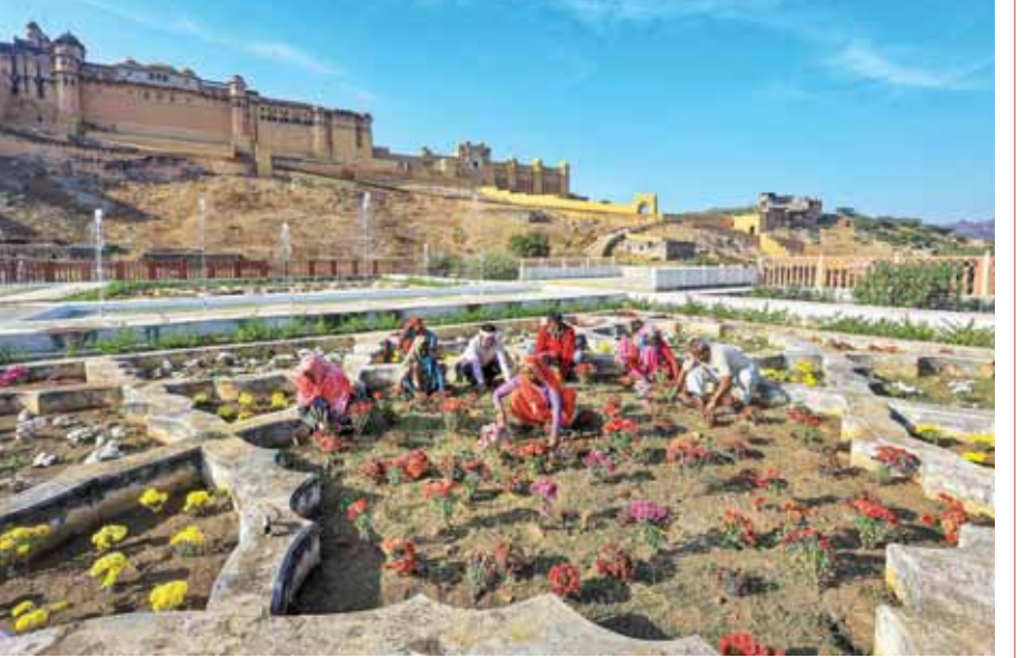
Beautification work in progress ahead of the Rising Rajasthan Global Investment Summit, at Kesar Kyari Garden of historical 'Amber Fort', in Jaipur