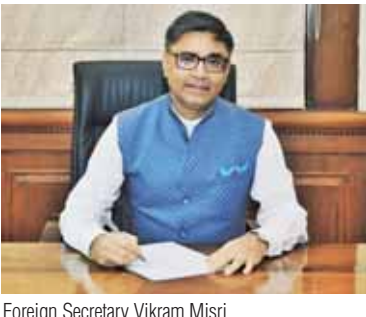
Foreign Secretary Vikram Misri