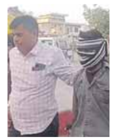
Continued on page 2