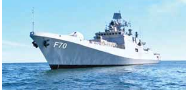
The new sentinel of the seas

The Indian Navy will commission its latest multi-role stealth guided missile frigate INS Tushil, an upgraded Krivak III class frigate, at Kaliningrad in Russia on December 9. The commissioning of INS Tushil — a 125 metre, 3900 ton ship which is a blend of Russian and Indian cutting edge technologies and best practices in warship construction — will take place at an event to be presided over by Defence Minister Rajnath Singh and attended by many high ranking Russian and Indian government and defence officials. INS Tushil is an upgraded Krivak III class frigate from Project 1135.6, of which six are already in service. The six frigates of this class that are