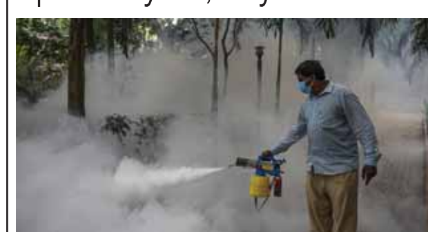
STAFF REPORTER ■ NEW DELHI

The Municipal Corporation of Delhi (MCD) has spent nearly Rs 100 crore on dengue control operations in the financial year 2024-25 so far, up from Rs 87.99 crore in the previous fiscal year, according to the Right to Information (RTI) response.